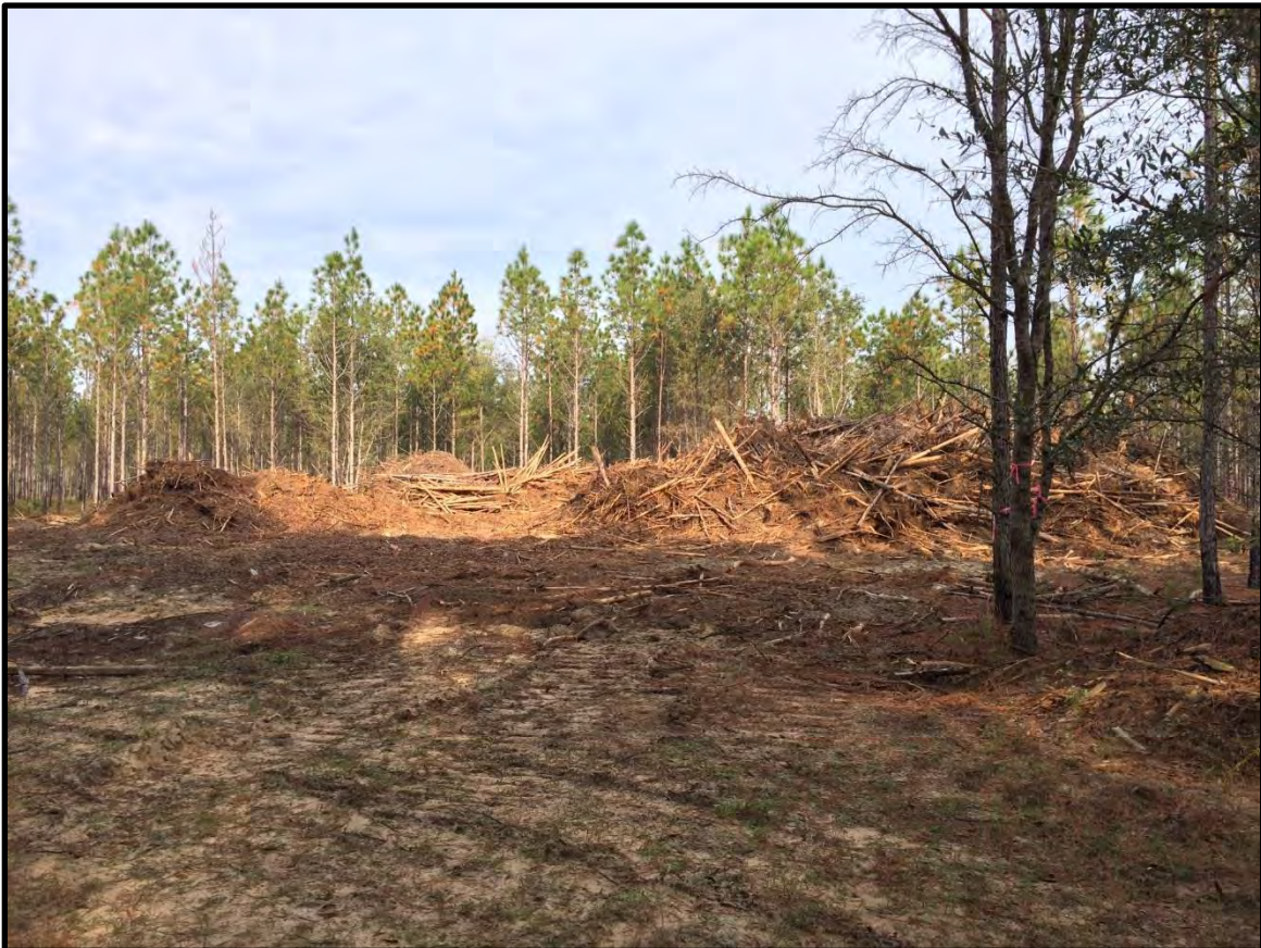
Photopoint 65. Timber loading area.