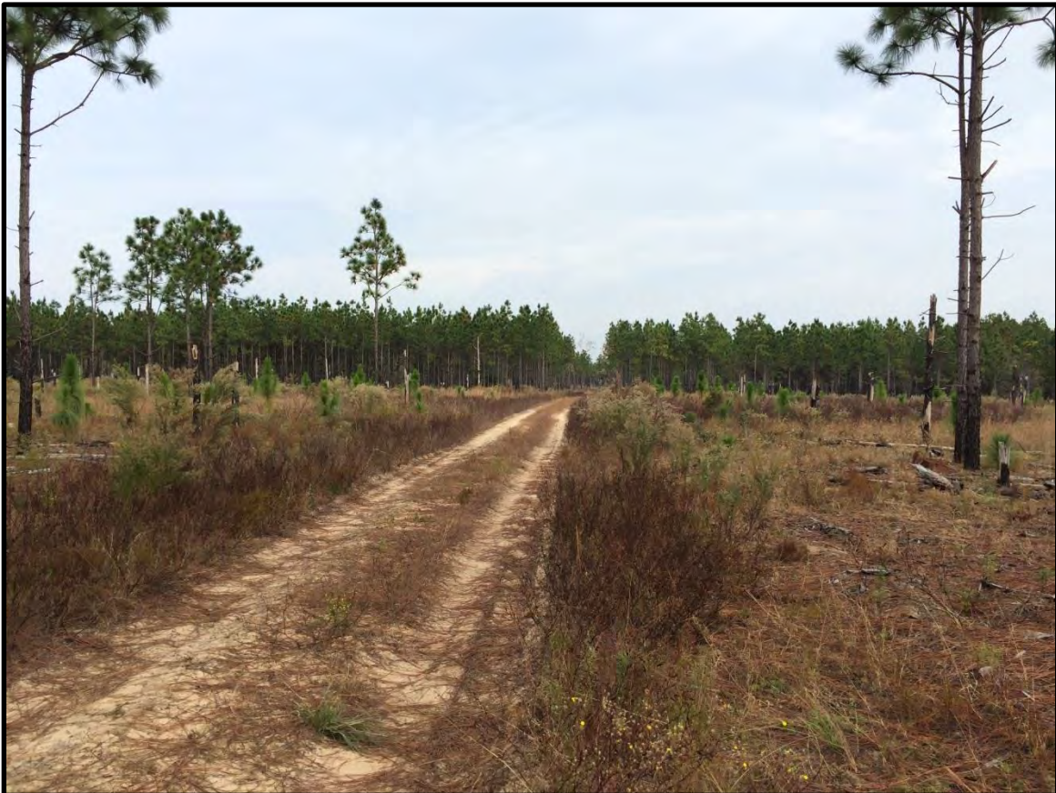
Photopoint 67. New vehicle trail traversing planted longleaf pine stand killed by fire and regenerating.