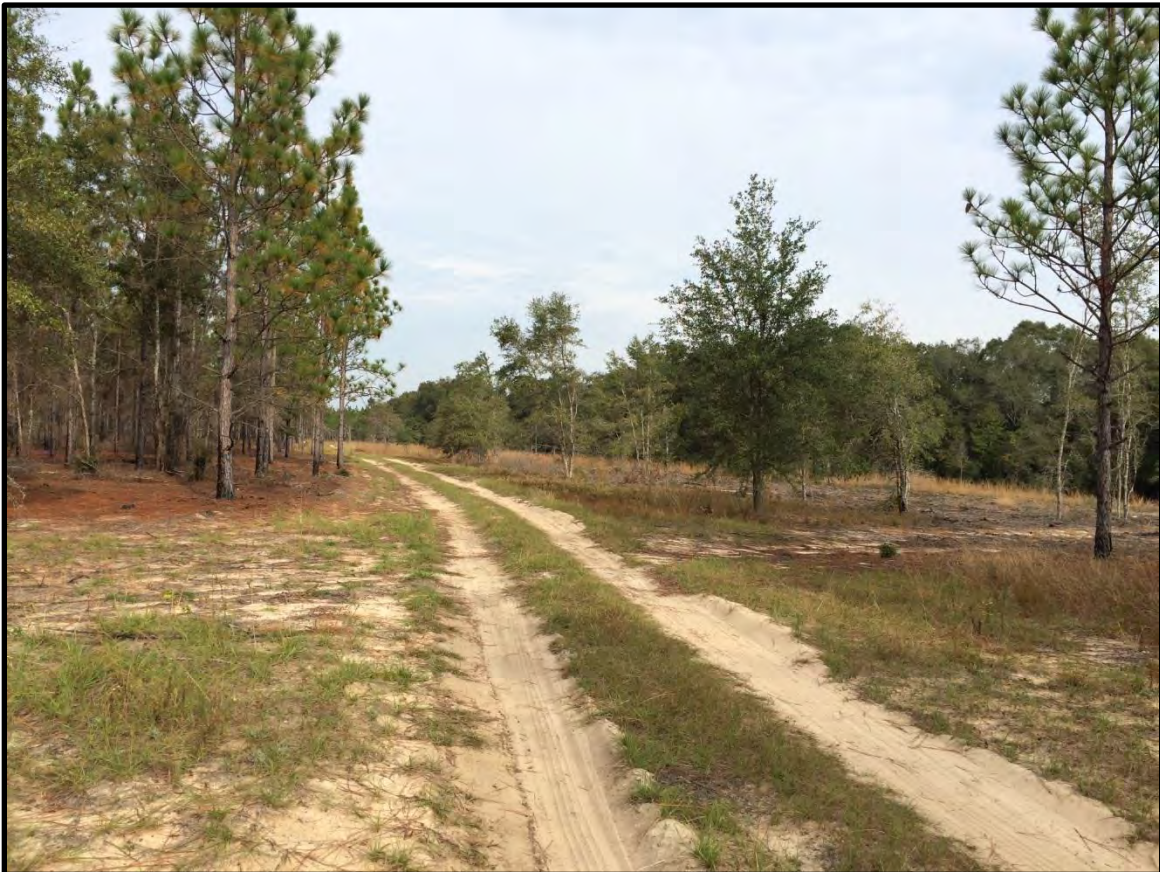
Photopoint 13. A typical access road – clearcut to east; recent burn.