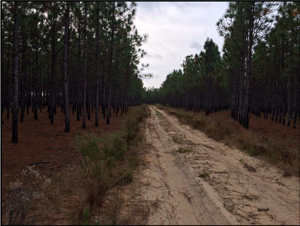
Photopoint 66. New vehicle trail leading to well house.