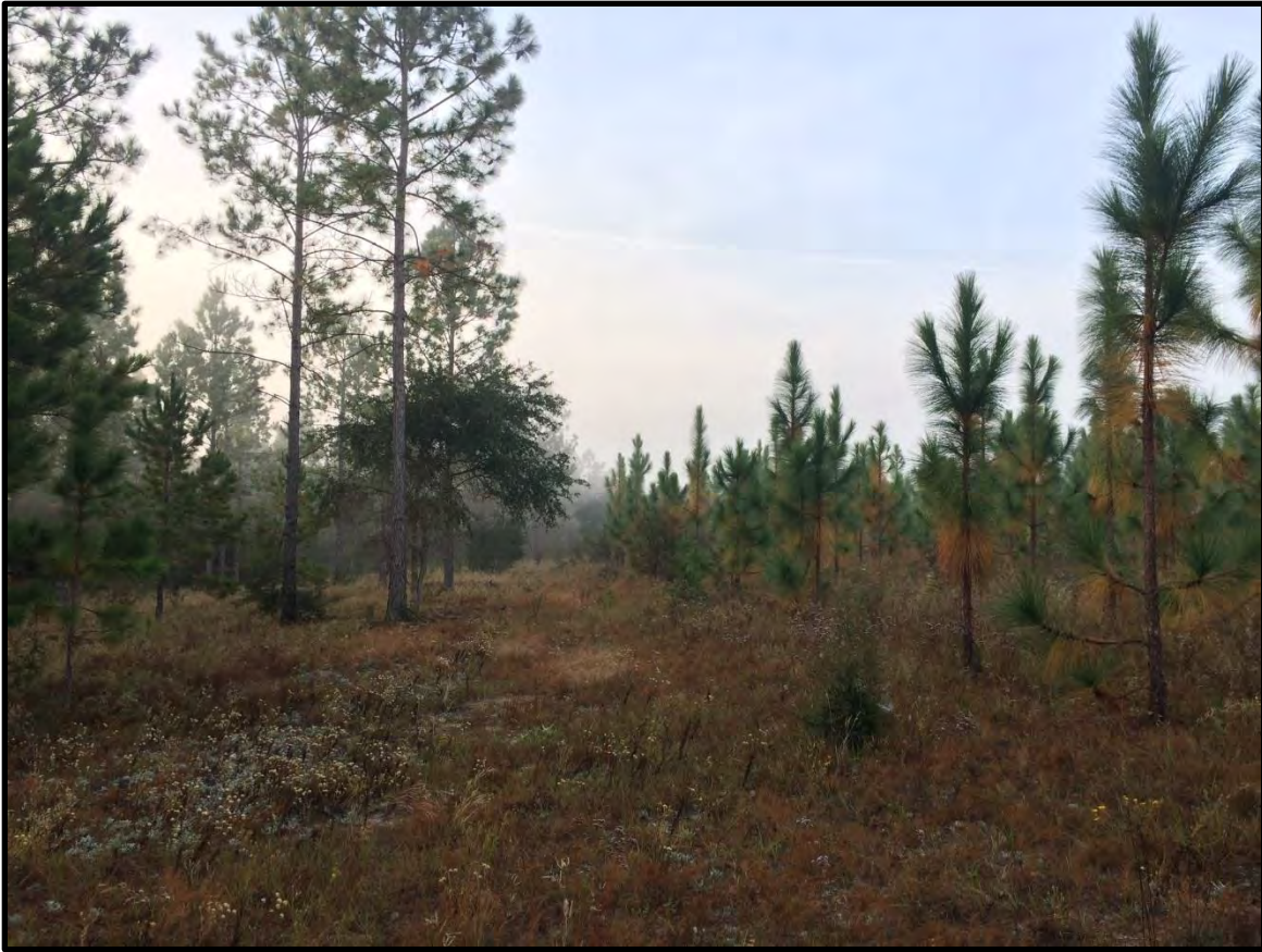
Photopoint 33. A typical access road; planted longleaf pines – longleaf pine growing.