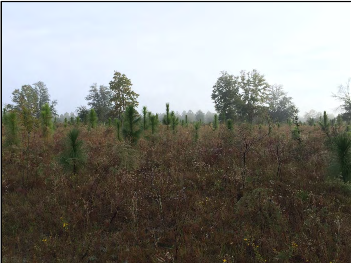
Photopoint 63. Clearcut/scalped area of former planted pines – longleaf pine growing, very small off-site pine seedlings abundant.