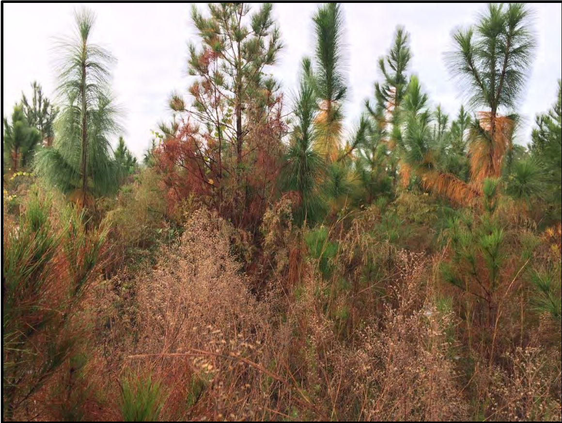
Photopoint 64. Clearcut of planted pines and recent burn; planted longleaf pines – longleaf pine and regenerating off-site pines growing.