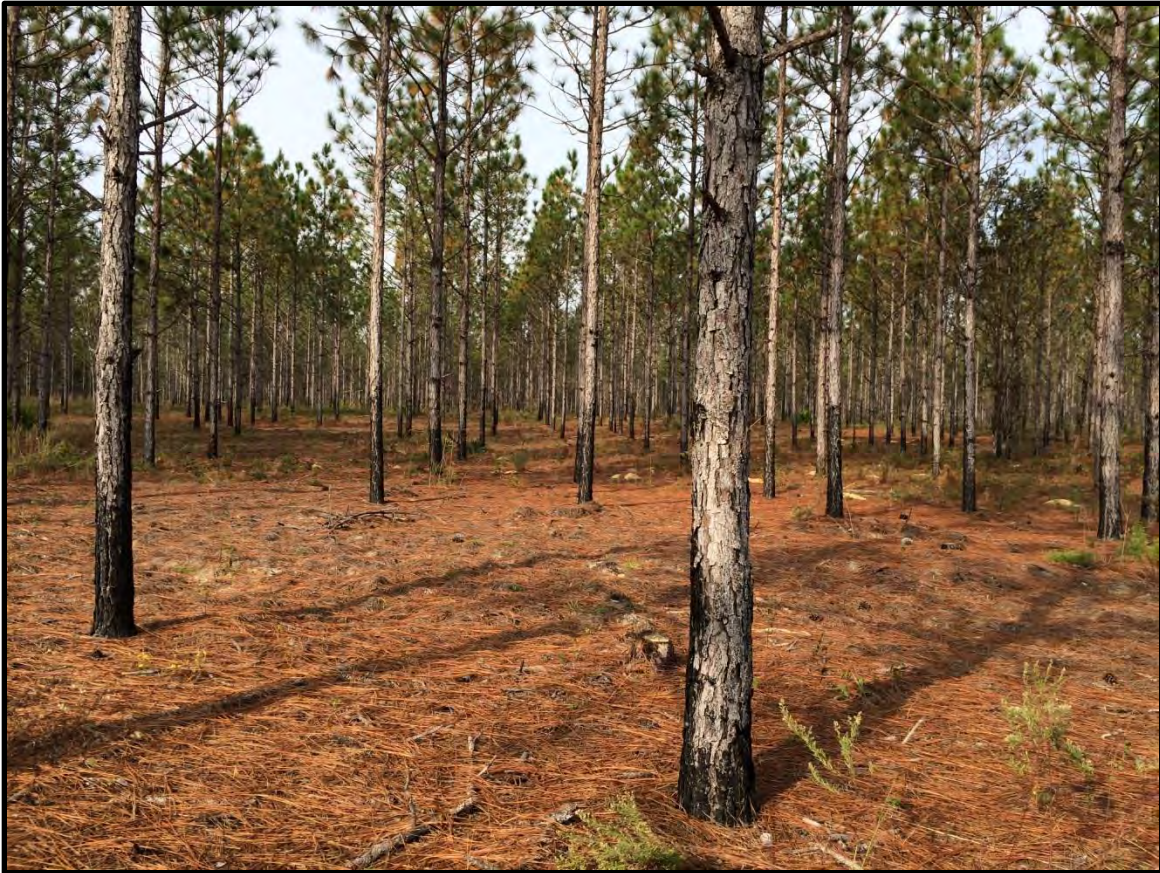
Photopoint 4. Planted longleaf pines – thinned.