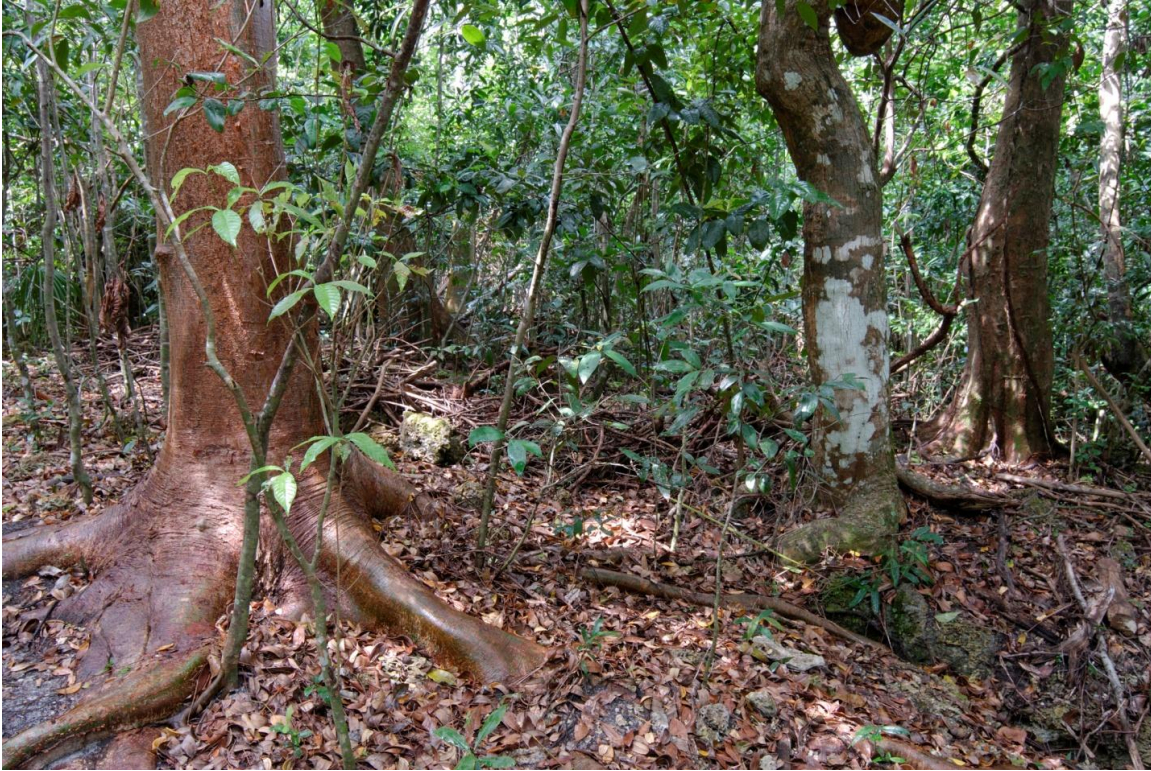
Matheson Hammock (Miami-Dade County)