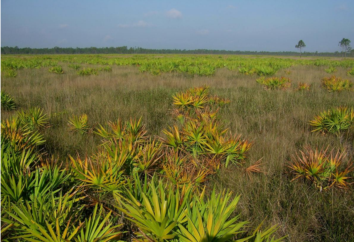
Babcock Ranch (Charlotte County)