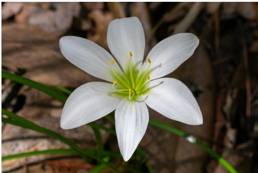
Forms solitary white flowers; linear leaves basal from a bulb. Photo taken at Joe Budd WMA.