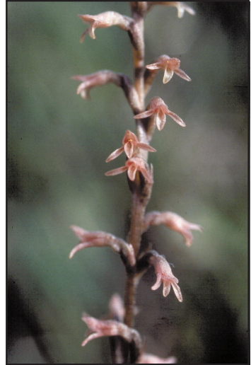
Paul Martin Brown

Field Description: Inconspicuous, perennial herb with 1 - 3 oval, short-stalked, satiny green, basal leaves , 1.2 - 2.4 inches long, that appear in the fall and wither away by spring. Flowers 10 - 40, loosely spiraled in a frail, slender spike up to 12 inches tall. Flowers tiny, greenish-brown to purple; sepals widely spreading; petals pointed, curved backwards at the tips; lip pointed, gray-green, fading to rose at the base. Fruit an oval, erect capsule.