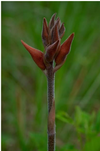
Plant leafless when flowering; entire plant covered in dense glandular hairs; flowers red. Photo taken at Salt Lake WMA by Kelly Anderson.

Field Description: The species is leafless at anthesis, has dorsal sepals 19 - 23 mm long, flowers most often red, but sometimes light green, typically flowering between April and June, and occupying open, sunny pine flatwoods and road shoulders throughout Florida.