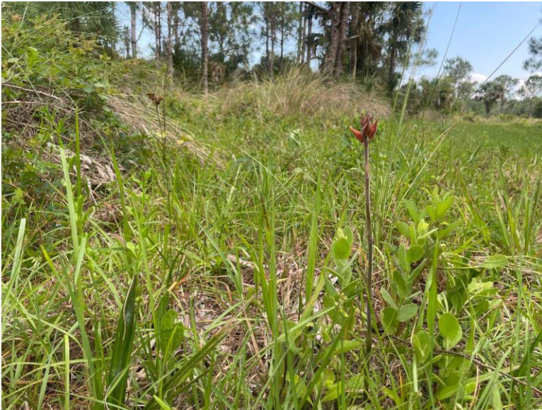
Often found growing in disturbed sites such as roadsides and pine flatwoods. Photo taken at Salt Lake WMA.