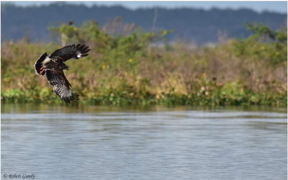
Male in flight.