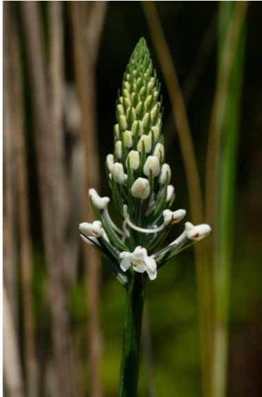
White flowers; lip margins entire neither fringed nor lobed.