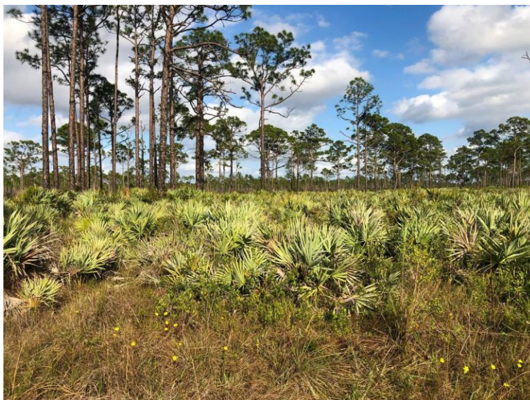
Growing in wet flatwoods at J.W. Corbett Wildlife Management Area.