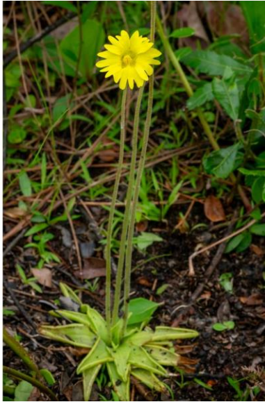
Solitary yellow flower; leaves are lime green with curled edges and digestive glands giving the leaves a slimy appearance. Wet flatwoods at Salt Lake Wildlife Management Area.

Field Description: Perennial, carnivorous herb with fleshy, yellow-green leaves , forming a basal rosette. Glandular hairs on the upper leaves , flower stalks , and calyx exude a sticky substance that traps small insects such as ants. Flowers bright yellow with a distinct spur.