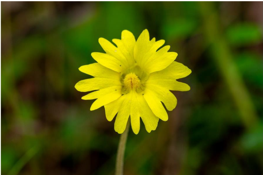
Solitary yellow flower with five notched petals and five sepals. Wet flatwoods at Salt Lake Wildlife Management Area.