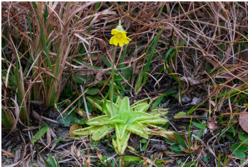
Carnivory via the slimy upper leaf surface. Edge of upland and forested wetland in a restoration natural community at L. Kirk Edwards Wildlife and Environmental Area.