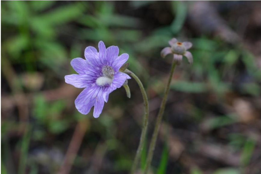
Flowers lilac with streaks of purple appearing 'veiny'. Expanded flowers over 1.8 cm across. Ecotone of basin swamp and restoration mesic flatwoods at Aucilla Wildlife Management Area.