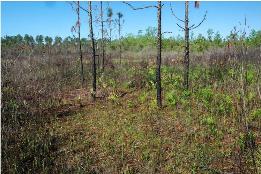
Growing in mesic flatwoods at Aucilla Wildlife Management Area.