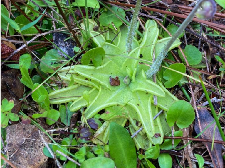
Carnivory via the slimy upper leaf surface. Ecotone of wet prairie and pond cypress depression at Lafayette Forest Wildlife and Environmental Area.