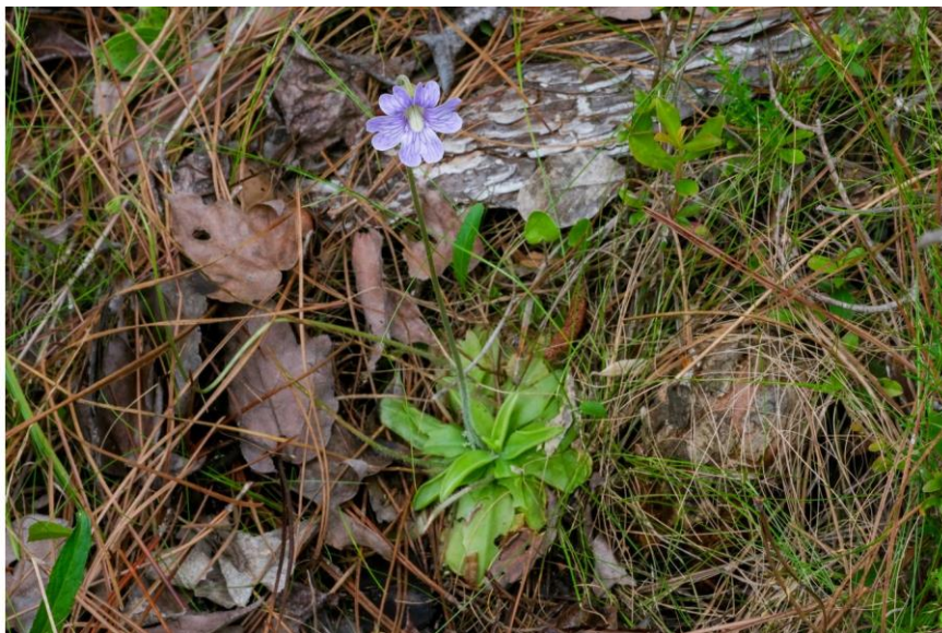
Leaves in a basal rosette, carnivory with slimy upper leaf surfaces. Wet flatwoods at Aucilla Wildlife Management Area.

Field Description: Perennial, carnivorous herb with fleshy, yellow-green leaves, rosettes usually 5 - 10 (-15) cm across. Glandular hairs on the upper leaves, flower stalks, and calyx exude a sticky substance that traps small insects, such as ants. Expanded corolla greater than 1.8 cm across; palate markedly exserted from the throat of the corolla; corolla violet, expanded portion of corolla markedly 'veiny' (darker along the veins); seeds (0.4-) 0.5 - 0.8 mm long.