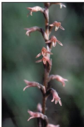
Paul Martin Brown

Field Description: Inconspicuous, perennial herb with 1 - 3 oval, short-stalked, satiny green, basal leaves , 2 - 11 cm long, that appear in the fall and wither away by spring. Flowers 10 - 40, loosely spiraled in a frail, slender spike up to 30 cm tall. Flowers tiny, greenish-brown to purple; sepals widely spreading; petals pointed, curved backwards at the tips; lip pointed, gray-green, fading to rose at the base. Fruit an oval, erect capsule.