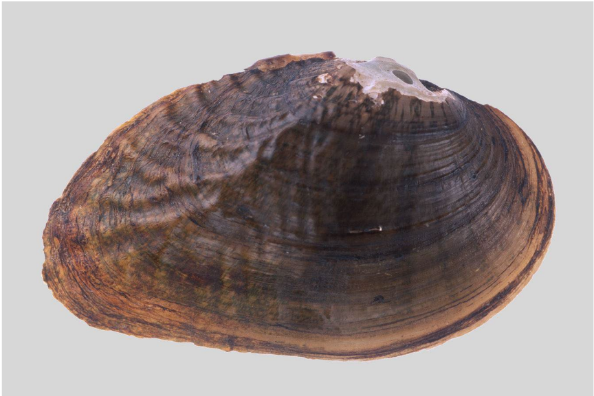
outer