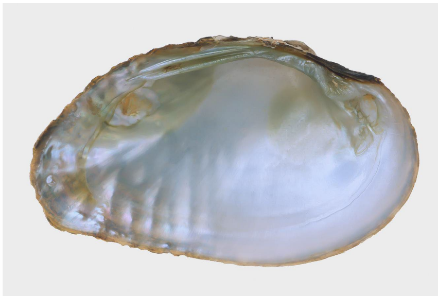
inner