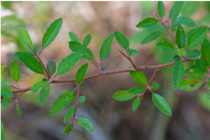
Leaves much longer than wide. Armed with sharp spur branches. Upland pine at L. Kirk Edwards Wildlife and Environmental Area.