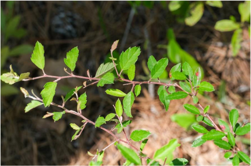
Leaved elliptic, often lobed on vigorous shoots. Upland pine at L. Kirk Edwards Wildlife and Environmental Area.