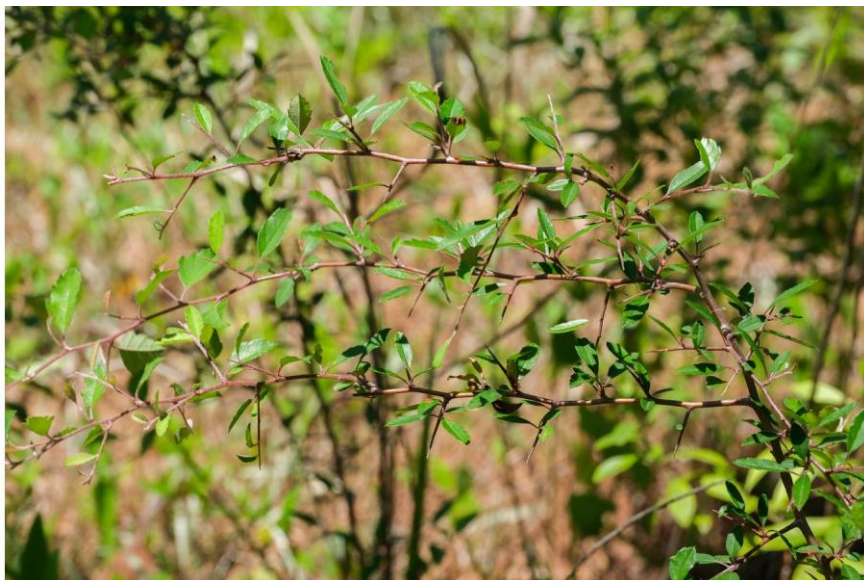
Armed with sharp spur branches. Upland pine at L. Kirk Edwards Wildlife and Environmental Area.

Field Description: A shrub to small tree (approximately 5 m tall) with branches and twigs thorny; leaves folded (conduplicate) in bud, glabrous or nearly so and often lobed on vigorous shoots; elliptic to elliptic-lanceolate, 2.5 - 8 cm long, 1 - 4 cm wide, mostly greater than 2 times as long as wide, subacute to obtuse at the tip; pedicels and hypanthium glabrous or with scattered long hairs; sepals persistent when in fruit; fruit 20 - 35 mm wide.