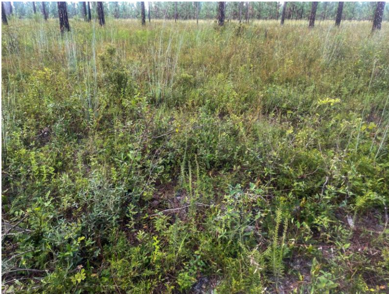
Growing in upland pine at L. Kirk Edwards Wildlife and Environmental Area.