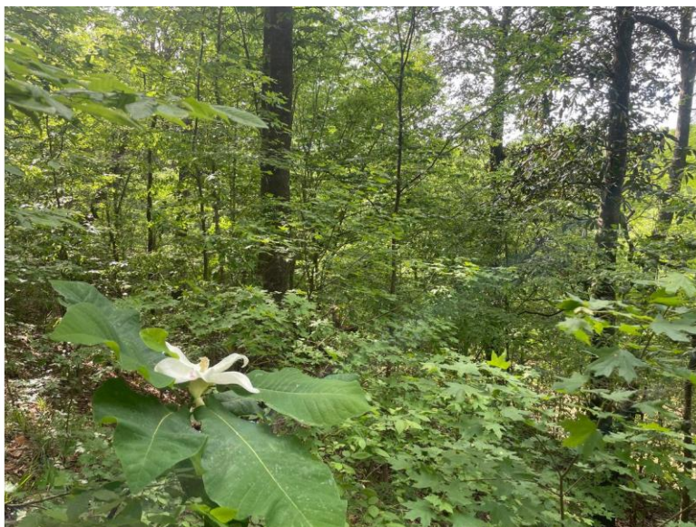
Growing on upper slope of upland hardwood forest. Photo taken at Joe Budd WMA by Kelly Anderson