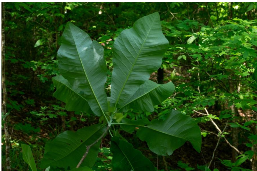
Large leaves up to 0.6 m long and glaucous beneath; leaf base auriculate to cordate with pubescent buds and twigs. Photo taken at Joe Budd WMA by Kelly Anderson.