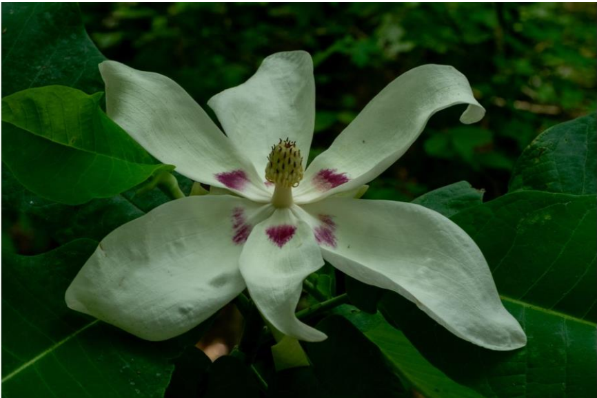
Flowers are large, fragrant, mostly white with a pink center.