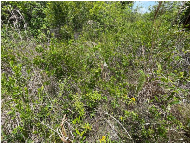
Growing in mesic flatwoods with remnant marl prairie at Okaloacoochee Slough Wildlife Management Area.