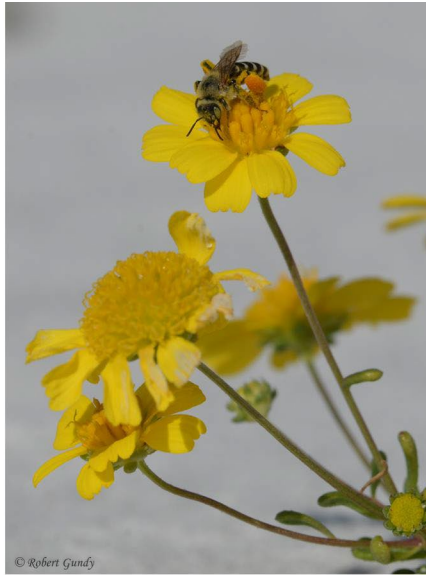
Female on Balduina angustifolia . © Robert Gundy