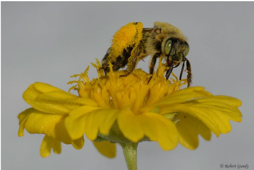
Female. Note green eyes.