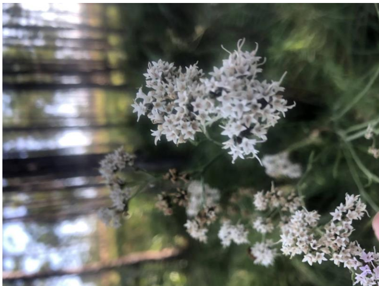
Florida hartwrightia flowers.

Field Description: Perennials, 60 - 120 cm (rhizomes thickened, fibrous-rooted). Stems erect, branched distally. Leaves basal and cauline; mostly alternate; petiolate or sessile; blades 1-nerved (or pinnately nerved), elliptic to linear [spatulate to oblanceolate], margins mostly entire, faces glabrous, gland-dotted. Heads discoid, in loose, corymbiform arrays. Involucres broadly obconic, 2 - 3 mm diam. Phyllaries persistent, 12 - 15 in 2 - 3 series, not notably nerved, oblong-elliptic to lanceolate, \pm equal (herbaceous). Receptacles convex, usually partially paleate (paleae peripheral). Florets 7 - 10; corollas white or pinkish to bluish, throats campanulate (lengths ca. 1.5 times diams.), lobes 5, \pm deltate; styles: bases not enlarged, glabrous, branches filiform to weakly clavate. Cypselae obpyramidal, 5-angled or -grooved, gland-dotted; pappi usually 0, rarely 1(-5+), fragile, flexuous, \pm glandular setae. x = 10 . (FNA 2023)