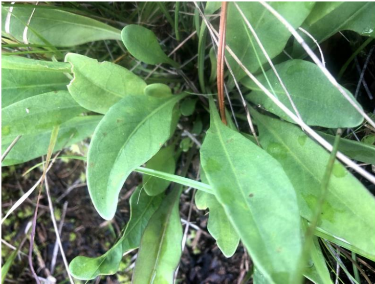
Basal leaves of Florida hartwrightia.