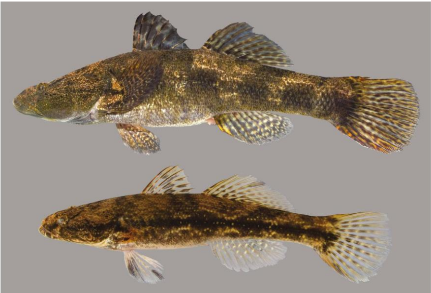
Two Bigmouth sleeper collected from southern Florida.

References: Gilmore 1992, Lee et al.1980, and Robins et al. 1986.