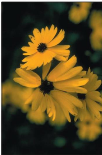
Bruce A. Sorrie

Field Description: Perennial herb , sometimes forming extensive colonies. Stems 40 - 71 cm tall, hairy, with few branches, each topped by a flower head. Leaves 2.5 - 7.6 cm long and 1.3 - 3.8 cm wide, opposite, elliptic to ovate, slightly hairy, with entire margins and hairy leaf stalks. Flower heads with two series of bracts underneath: outer bracts short, narrow, oblong; inner bracts much longer and broadly triangular. Ray flowers usually 8, yellow, with 3 deeply cut lobes at the tip; disk flowers purple. Fruits flattened, with scalloped wings.