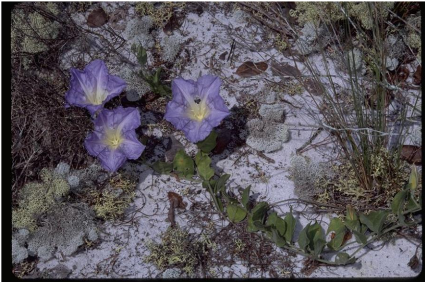
Fully open flowers.