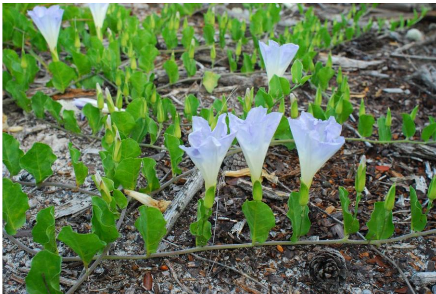
Sprawling vines with partially open flowers.

Field Description: Perennial trailing vine with stout stems up to 1 m long; leaves 2.5 - 5 cm long, grading into small bracts at the end of the stem; oval with pointed tips, entire margins, short, silky hairs, and very short leaf stalks. Flowers 15 - 28 mm long, solitary, with 5 lobes and 5 leathery, unequal sepals in two series. Flowers bright blue with a white throat in the morning but fading to pale blue by early afternoon when they close; somewhat resembles a common morning-glory.