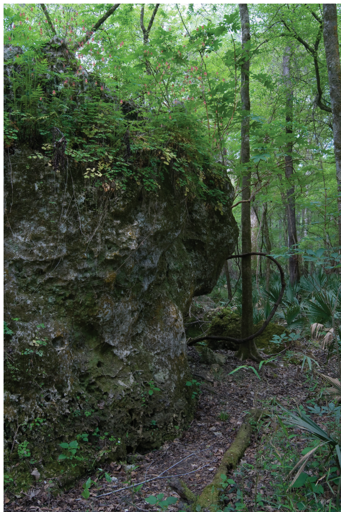
Florida Caverns State Park (Jackson County)

Rare plants that may occur on limestone outcrops include ferns that thrive in moist microclimates; these include spleenwort ( Asplenium pumilum ), modest spleenwort ( Asplenium verecundum ), brittle maidenhair fern ( Adiantum tenerum ), sinkhole fern ( Blechnum occidentale ), creeping maiden fern ( Thelypteris reptans ), southern lip fern ( Cheilanthes microphylla ), Peters' bristle fern ( Trichomanes petersii ), and Florida filmy fern ( Trichomanes punctatum ssp. floridanum ). Many rare fern species are restricted to limestone outcrops of extreme South Florida such as Hattie Bauer halberd fern ( Tectaria coriandrifolia ), wedgelet fern ( Odontosoria clavata ), holly vine fern ( Lomariopsis kunzeana ), and Kraus' bristle fern ( Trichomanes krausii ). Other interesting rare plant species of limestone outcrops include false rue-anemone ( Enemion biternatum ), Marianna columbine ( Aquilegia canadensis var. australis ; only present in the central Panhandle), Craighead's nodding-caps ( Triphora craigheadii ), Rickett's nodding-caps ( Triphora rickettii ), terrestrial peperomia ( Peperomia