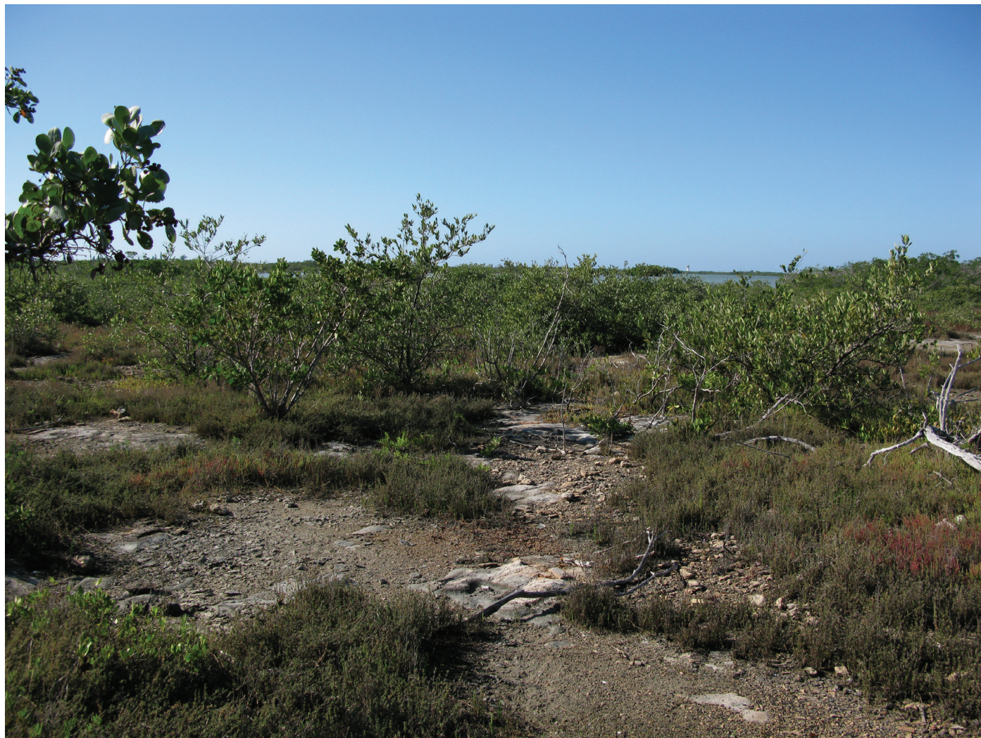
Naval Air Station Key West (Monroe County)

plant. It varies from stunted, sprawling, multi-stemmed shrubs to tree size. Other typical woody species are red mangrove ( Rhizophora mangle ), black mangrove ( Avicennia germinans ), white mangrove ( Laguncularia racemosa ), and christmasberry ( Lycium carolinianum ). At the transition to upland vegetation, buttonwood may be joined by a variety of shrubs and stunted trees of inland woody species, including saffron plum ( Sideroxylon celastrinum ), wild cotton ( Gossypium hirsutum ), Florida Keys blackbead ( Pithecellobium keyense ), bay cedar ( Suriana maritima ), white indigoberry ( Randia aculeata ), wild dilly ( Manilkara jaimiqui ), poisonwood ( Metopium toxiferum ), joewood ( Jacquinia keyensis ), Florida mayten ( Maytenus phyllanthoides ), and barbed-wire cactus ( Acanthocereus tetragonus ).