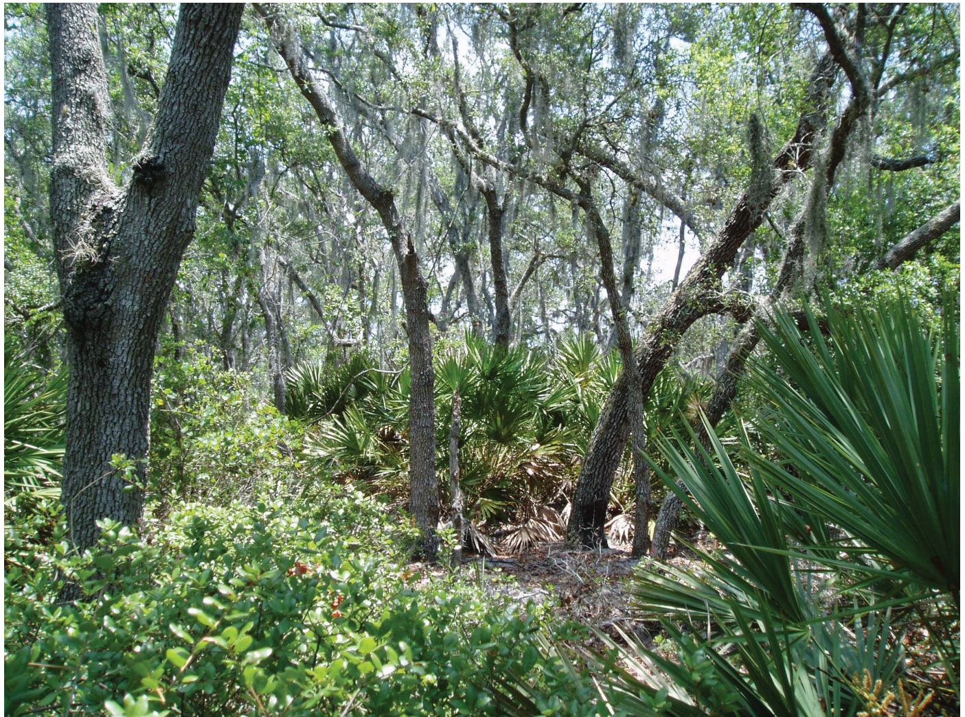
Lake Wales Ridge State Forest (Polk County)

tifolia ), rusty staggerbush ( Lyonia ferruginea ), fetterbush ( L. lucida ), sparkleberry ( Vaccinium arboreum ), deerberry ( V. stamineum ), black cherry ( Prunus serotina ), American beautyberry ( Callicarpa americana ), common persimmon ( Diospyros virginiana ), scrub palmetto ( Sabal etonia ), Hercules' club ( Zanthoxylum clava-herculis ), wild olive ( Osmanthus americanus ) or scrub wild olive ( O. megacarpus ), garberia ( Garberia heterophylla ), Florida rosemary ( Ceratiola ericoides ), and yaupon ( Ilex vomitoria ). The herb layer is generally very sparse or absent, but may contain some scattered wiregrass ( Aristida stricta var. beyrichiana ), sandyfield beaksedge ( Rhynchospora megalocarpa ), witchgrass ( Dichanthelium spp.), or forbs such as sweet goldenrod ( Solidago odora ). Muscadine ( Vitis rotundifolia ) and earleaf greenbrier ( Smilax auriculata ) are common vines. The epiphytes Spanish moss ( Tillandsia usneoides ) and ballmoss ( T. recurvata ) are often abundant.