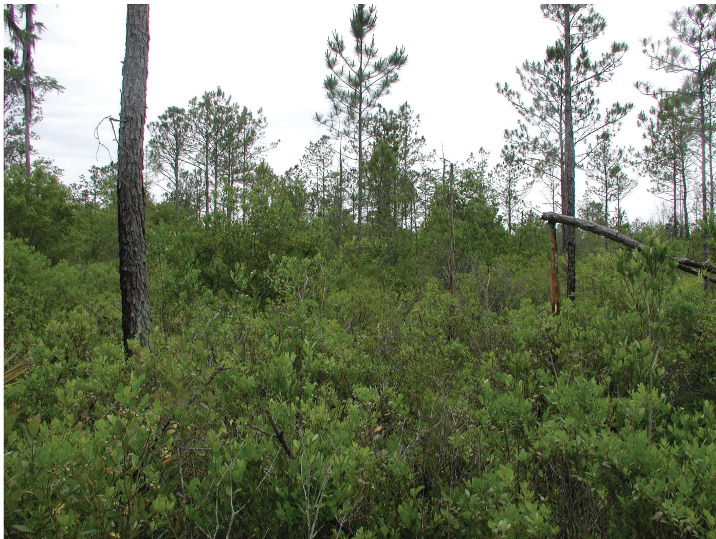
Aucilla Wildlife Management Area (Jefferson County)

Shrub bog is found on the border of swamps, in stream-head drainages, and in flat, poorly drained areas between rivers. It often forms the border between the mesic or wet flatwoods communities and dome swamp, basin swamp, or hydric hammock communities. Shrub bog may cover large portions of low-lying areas in the coastal plain known as “bays” (e.g., San Pedro Bay in Madison and Tay-