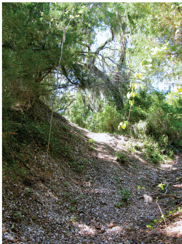
Lower Suwannee National Wildlife Refuge (Levy County)