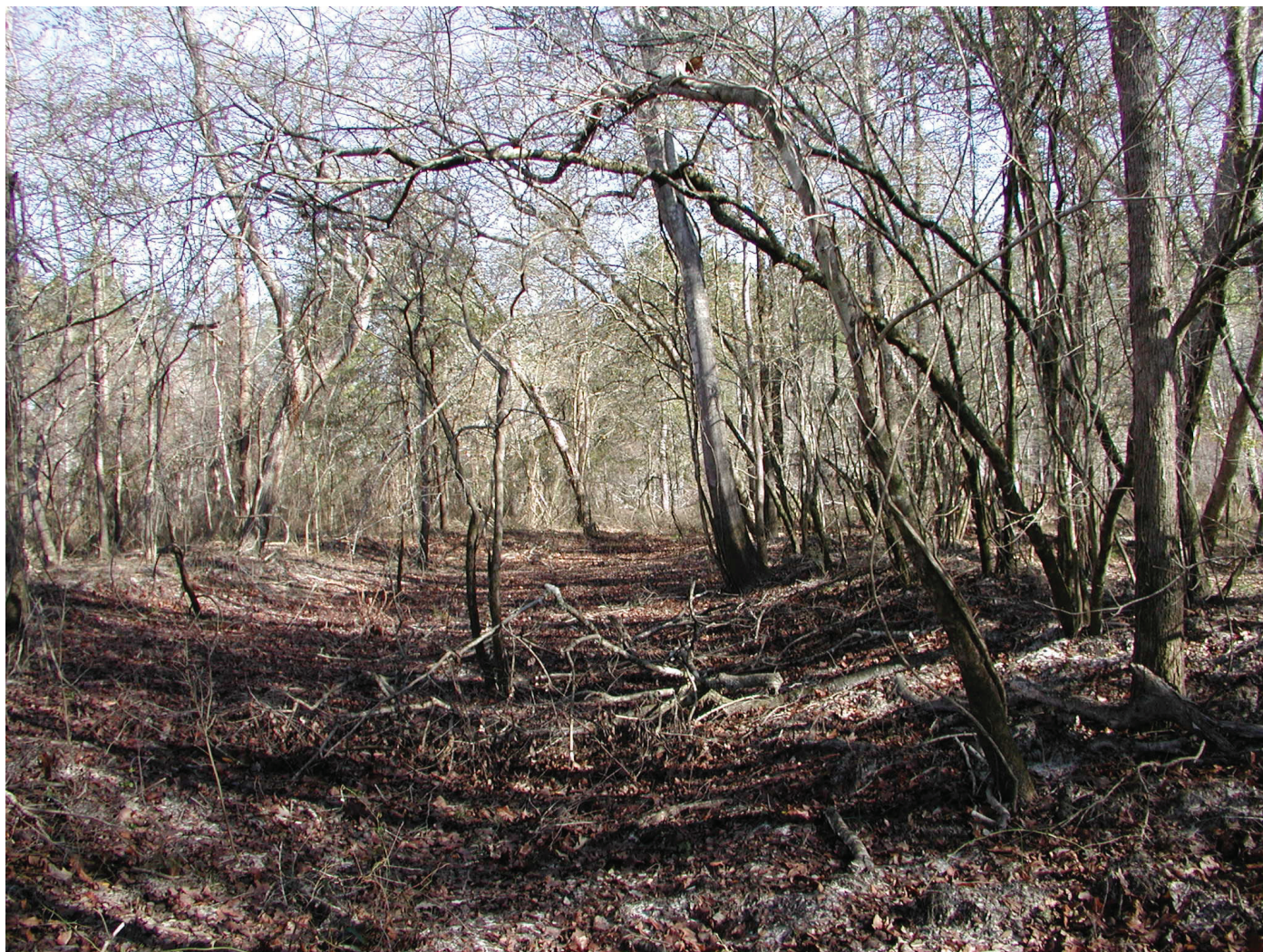
Typical "ridge and swale" topography resulting from an aggrading point bar on the Ochlockonee River, Lake Talquin State Forest (Leon County)