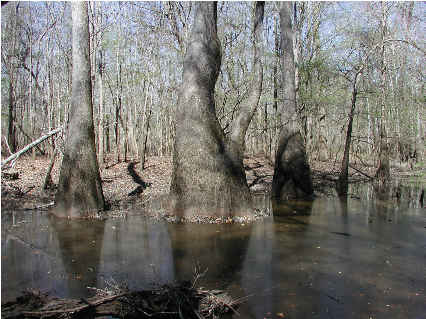
Near the Florida River, Apalachicola Water Management Area (Liberty County)

Escambia River, Apalachicola River, Choctawhatchee River, Suwannee River, Holmes Creek, Oklawaha River, Withlacoochee River, and most other rivers and streams in Florida