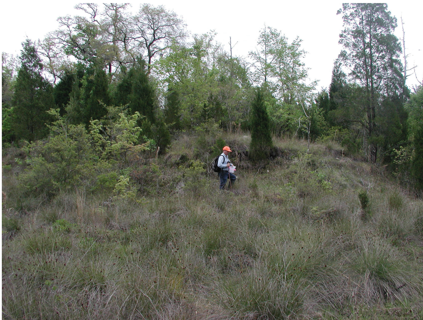
E.B. glade (Gadsden County) with black bogrush in foreground

Upland glade was first mapped in the course of a survey of the Apalachicola ravines in Gadsden County. 237 More glades have recently been mapped in Jackson County.