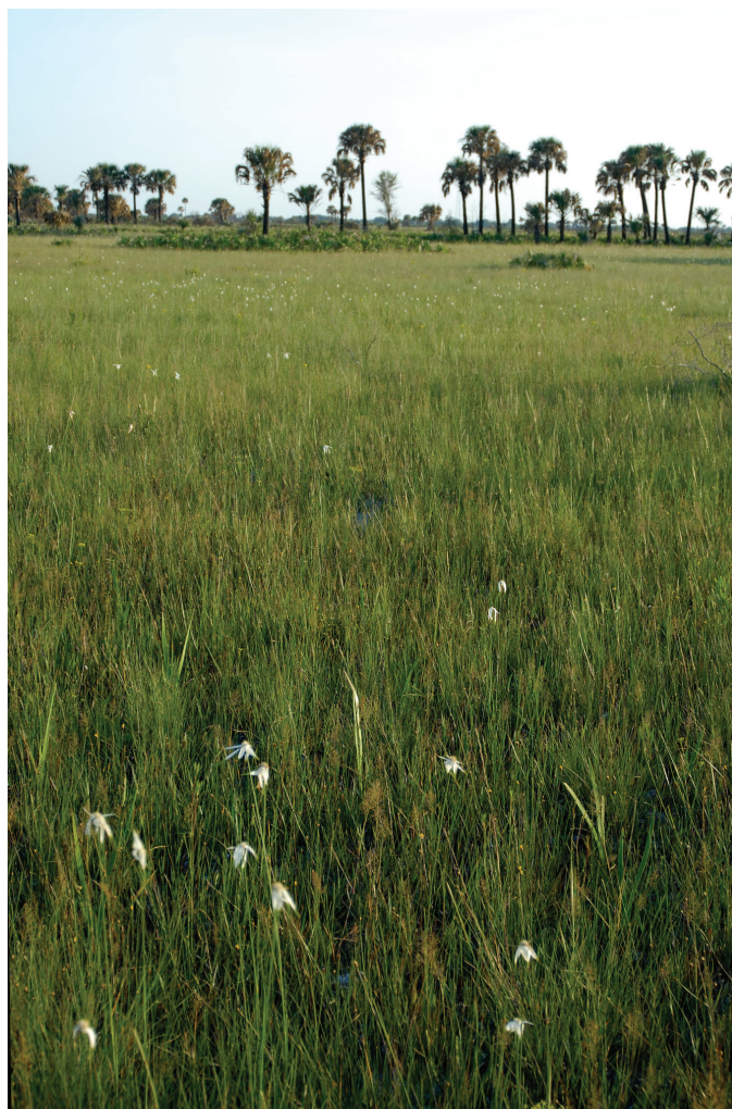
Kissimmee Prairie Preserve State Park (Okeechobee County)

Wet prairie is noted for its many showy flowering herbs including false foxgloves ( Agalinis spp.), grass pinks ( Calopogon spp.), pipeworts ( Eriocaulon spp.), rein orchids ( Platanthera spp.), milkworts ( Polygala spp.), meadowbeauties ( Rhexia spp.), rosegentians ( Sabatia spp.), yellow-eyed-grasses ( Xyris spp.), white-top sedge ( Rhynchospora latifolia ), and composites in the genera Balduina , Carphephorus , Coreopsis , Eupatorium , Eurybia , Helenium , Helianthus , Rudbeckia , Solidago , and Symphotrichum . Re-sprouting short shrubs that grow intermixed with the grasses, include two species of St. John's wort ( Hypericum brachyphyllum , H. myrtifolium ), evergreen bayberry ( Myrica caroliniensis ) and, in Panhandle Florida, bog tupelo ( Nyssa ursina ). A few stunted trees of slash pine ( Pinus elliotii ), pond cypress