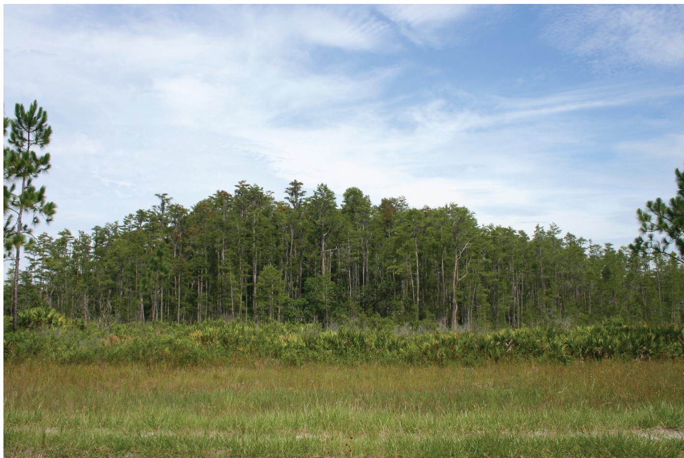
Three Lakes Wildlife Management Area (Osceola County)

( Cephalanthus occidentalis ), coastalplain willow ( Salix caroliniana ), wax myrtle ( Myrica cerifera ), titi ( Cyrilla racemiflora ), and St. John's wort ( Hypericum spp.). Herbaceous species can be dense or absent and include a wide variety of ferns, graminoids, and herbs including Virginia chain fern ( Woodwardia virginica ), royal fern ( Osmunda regalis var. spectabilis ), cinnamon fern ( Osmunda cinnamomea ), toothed midsorus fern ( Blechnum serrulatum ), maidencane ( Panicum hemitomon ), sawgrass ( Cladium jamaicense ), various species of beaksedge ( Rhynchospora spp.), lizard's tail ( Saururus cernuus ), Carolina redroot ( Lachnanthes caroliniana ), taperleaf waterhorehound ( Lycopus rubellus ), false nettle ( Boehmeria cylindrica ), and knotweeds ( Polygonum spp.). Sphagnum moss ( Sphagnum spp.) often occurs in patches where the soil is saturated but not flooded. 280 Vines such as eastern poison ivy ( Toxicodendron radicans ), white twinevine ( Sarcostemma clausum ), laurel greenbrier ( Smilax laurifolia ), epiphytes such as Spanish moss ( Tillandsia usneoides ), several species of wild pine ( Tillandsia spp.), and orchids can be common in dome swamps. The center of the dome swamp contains the largest cypress trees and the understory can be open with deeper water