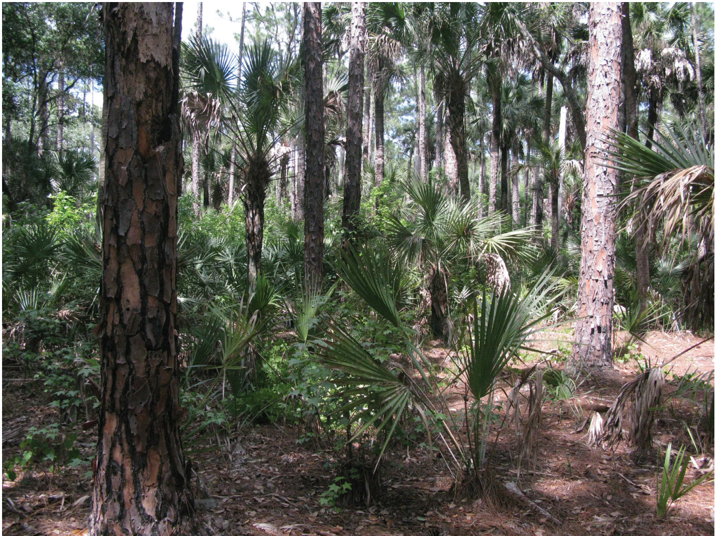
Cabbage Palm Variant – Tosohatchee Wildlife Management Area (Orange County)