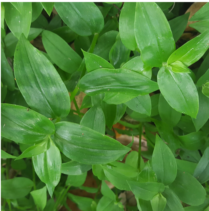
Michelle M. Smith

Description: White-flowered wandering jew is a perennial herb that can easily form a mat as the ground cover. It has alternate leaves, has parallel veins, and is green. The leaves are 5 cm long and 2 cm wide. The flowers are white in color and form at the tip of the stem.