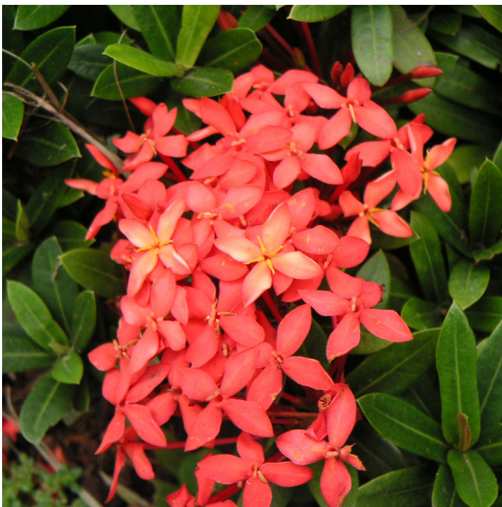
Ixora coccinea , Rubiaceae, by Louise Wolff http://commons.wikimedia.org/wiki/Ixora_coccinea Used under Creative Commons 3.0 license

Description: A dense, multi-branched evergreen shrub, commonly 1.2-2 m in height, but capable of reaching up to 3.6 m high. Ixora has a rounded form, with a spread that may exceed its height. The glossy, leathery, oblong leaves are about 10 cm long, with entire margins, and are opposite or whorled on the stems. Small tubular, scarlet flowers in dense rounded clusters 5-13 cm across are produced almost all year long. There are numerous named cultivars differing in flower color (yellow, pink, orange) and plant size. Several popular cultivars are dwarfs, usually staying under 3 ft in height.