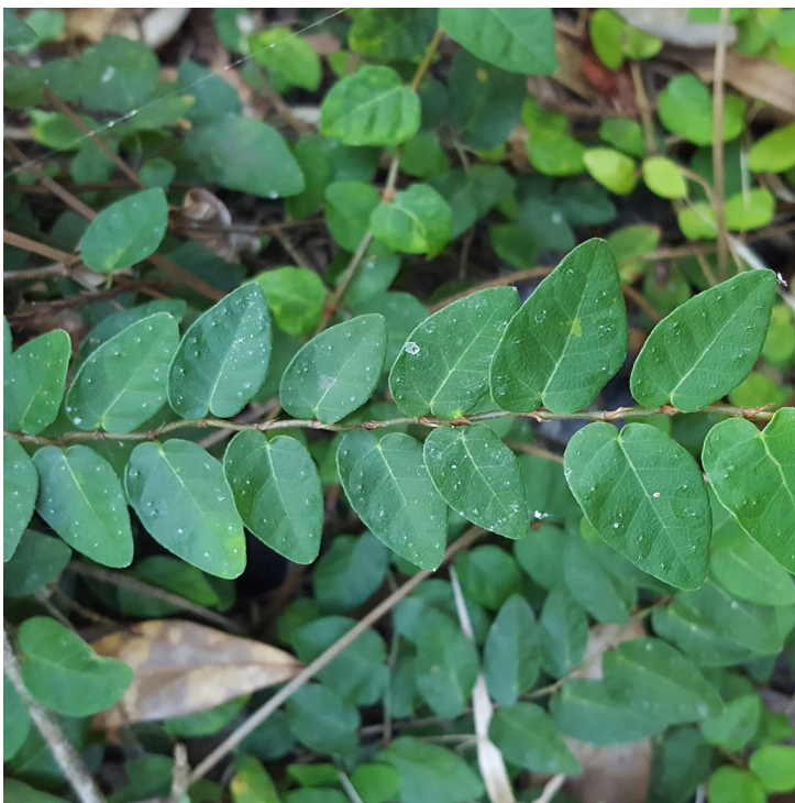
Michelle M. Smith

Description: Ficus pumila is a spreading, mat forming vine with simple, alternate leaves.