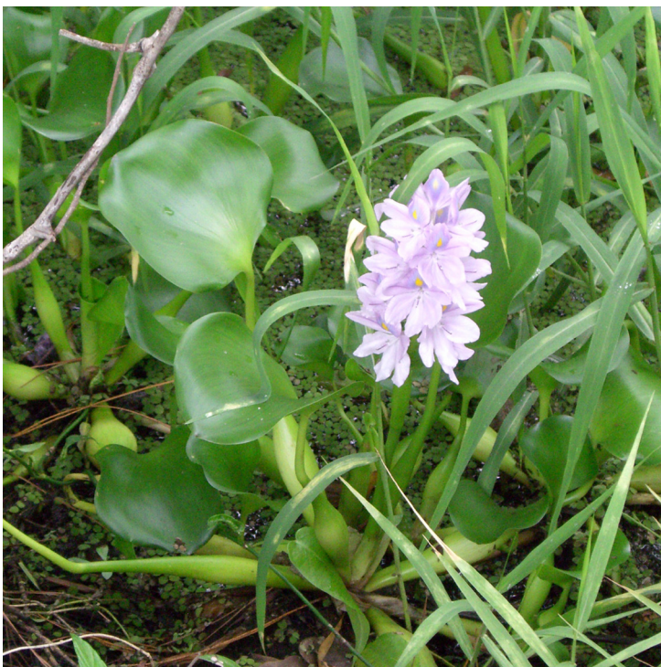
Pete Diamond in Glades Co. FL

Description: Water hyacinth is a floating aquatic herb. The plant forms dense mats and has stolons that sprout young plants. The submerged fibrous roots are a purple/blue/black color. The floating glossy green leaves form rosettes. The flower is showy and ornamental, born from a spike at the center of the rosette. Flowers are a lilac/blue color with a yellow marking.