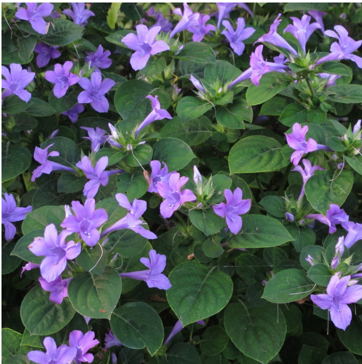
Barleria cristata

Description: Shrub to 1 meter tall. The leaves are dark green on the upper surface and pale green on the lower surface, elliptic to narrowly ovate. Flowers about 5 cm long, funnel-shaped, violet, pink, or white color. Fruits about 1.5 cm long, ellipsoid capsules.