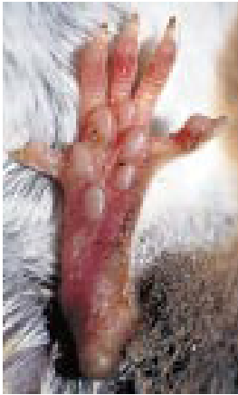
Peromyscus gossypinus foot