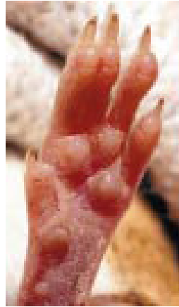
Podomys sp. foot