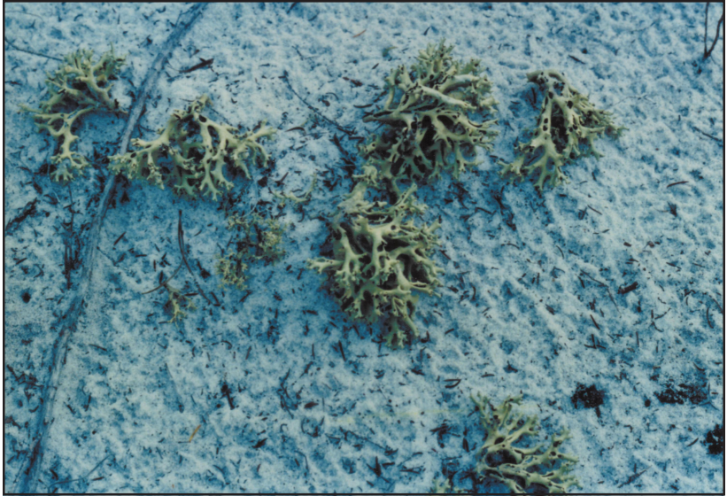
Ann F. Johnson

Field Description: Terrestrial lichen in tufts 0.8 - 2.5 inches tall, consisting of densely forking branches. Branches up to 0.24 inch wide, hollow, smooth, glossy, pale yellowish-gray, and intricately forked with large, conspicuous holes below each branching point.