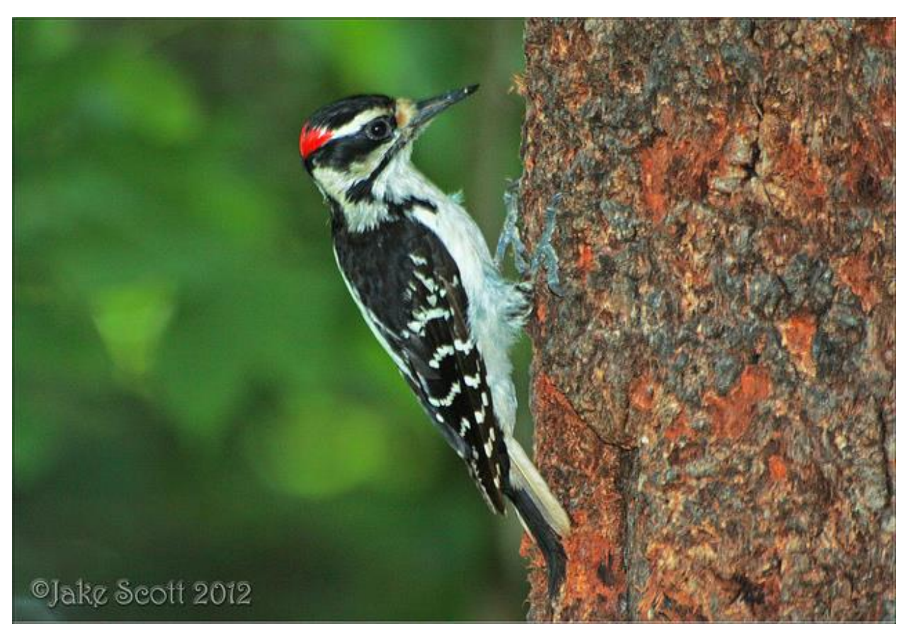
Figure 10. Hairy woodpecker ( Picoides villosus ) photographed on 1 July 2012 by Jake Scott. Not photographed at study site.

Management Recommendations: Maintain high quality forest structure in large tracts. Do not remove dead snags.