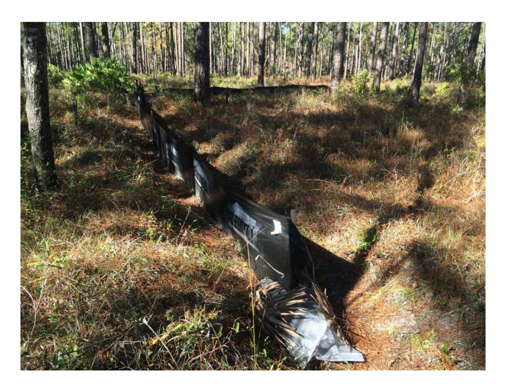
Figure 2. Drift fence array 7 at Lake Talquin State Forest.