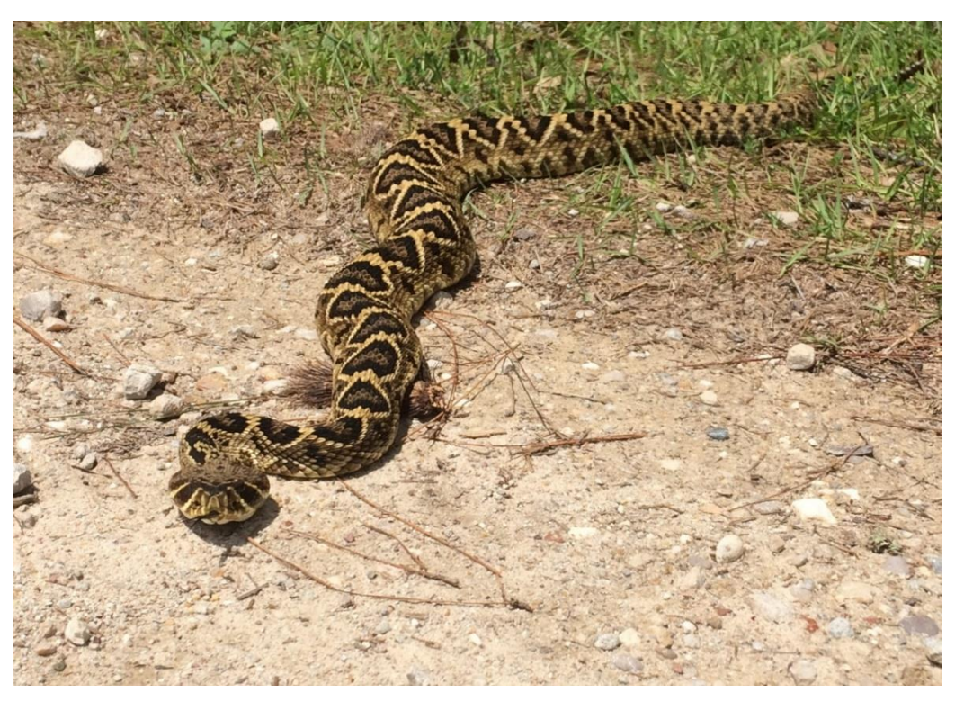
Figure 4. Eastern diamond-backed rattlesnake ( Crotalus adamanteus ) photographed in situ on 18 May 2018 by Robert Gundy

Management Recommendations: Preserve large tracts of appropriate, unfragmented habitat rangewide. Avoid construction of roads within occupied habitats, and close unnecessary ones. Species is compatible with ecologically-sensitive forestry practices. Educate landowners, managers, and outdoorsmen to ecological value of species.