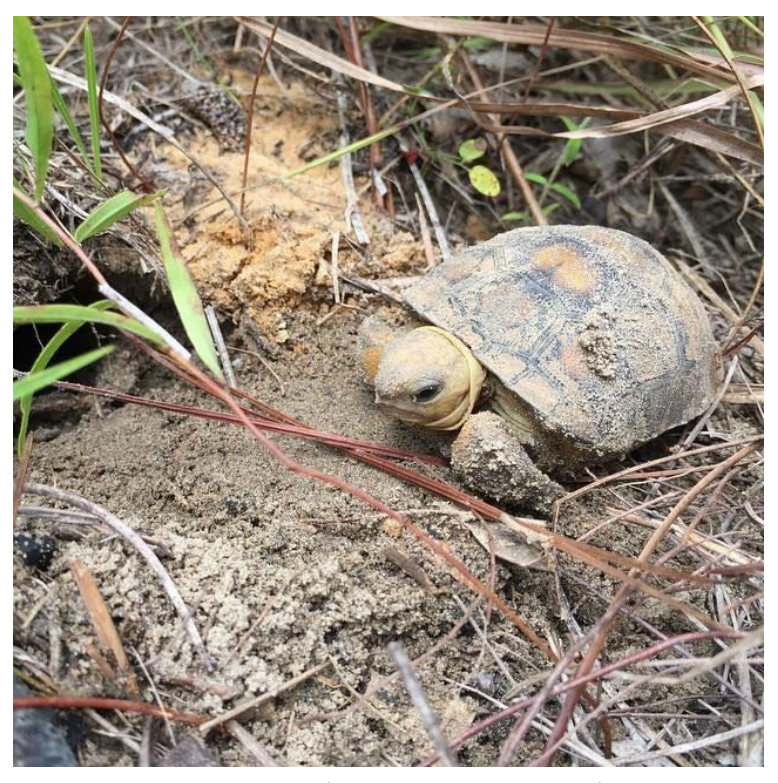
Figure 6. Gopher tortoise ( Gopherus polyphemus ) photographed on Willow Oak Plantation on 12 September 2013 by Rebecca Zeroth

Management Recommendations: Large undivided tracts of upland habitat need to be managed with a goal of maintaining native vegetative conditions. Because of the risk of introducing tortoises infected with respiratory disease to uncontaminated populations, tortoises should only be relocated under strictly controlled programs. Avoid damage to gopher tortoise burrows during forestry activities.