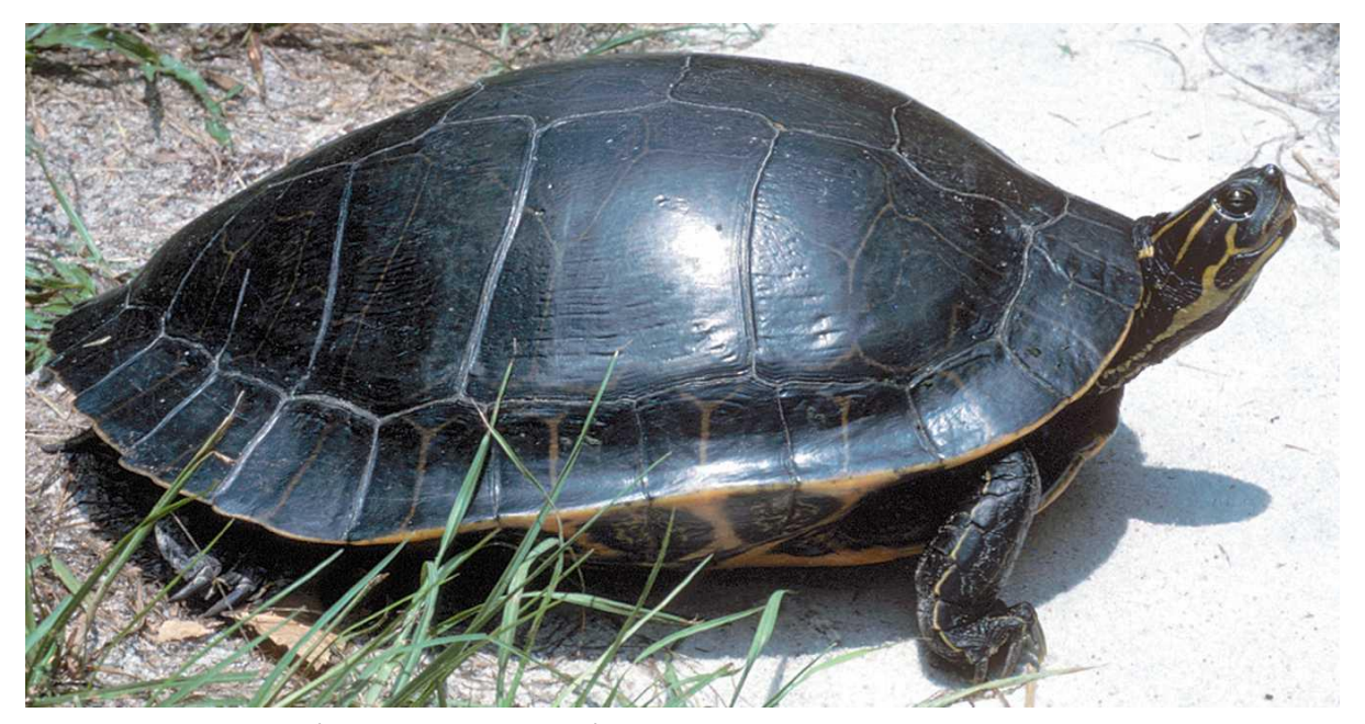
Figure 9. River cooter ( Pseudemys concinna ) photographed on 23 September 2002 by Dale Jackson. Not photographed at study site.

Management Recommendations: Protect river water quality, including surrounding uplands.