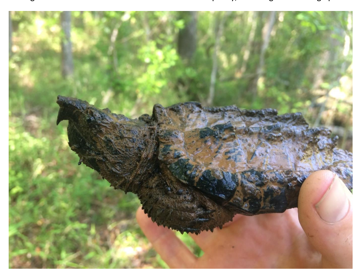
Figure 8. Alligator snapping turtle ( Macrochelys temminckii ) photographed on 11 April 2018 by Robert Gundy

Management Recommendations: Protect river water quality, including surrounding uplands.