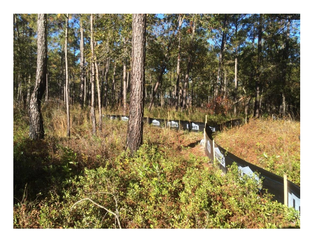
Figure 3. Drift fence array 13 at Lake Talquin State Forest. Photographed on 27 November 2017 by Robert Gundy.