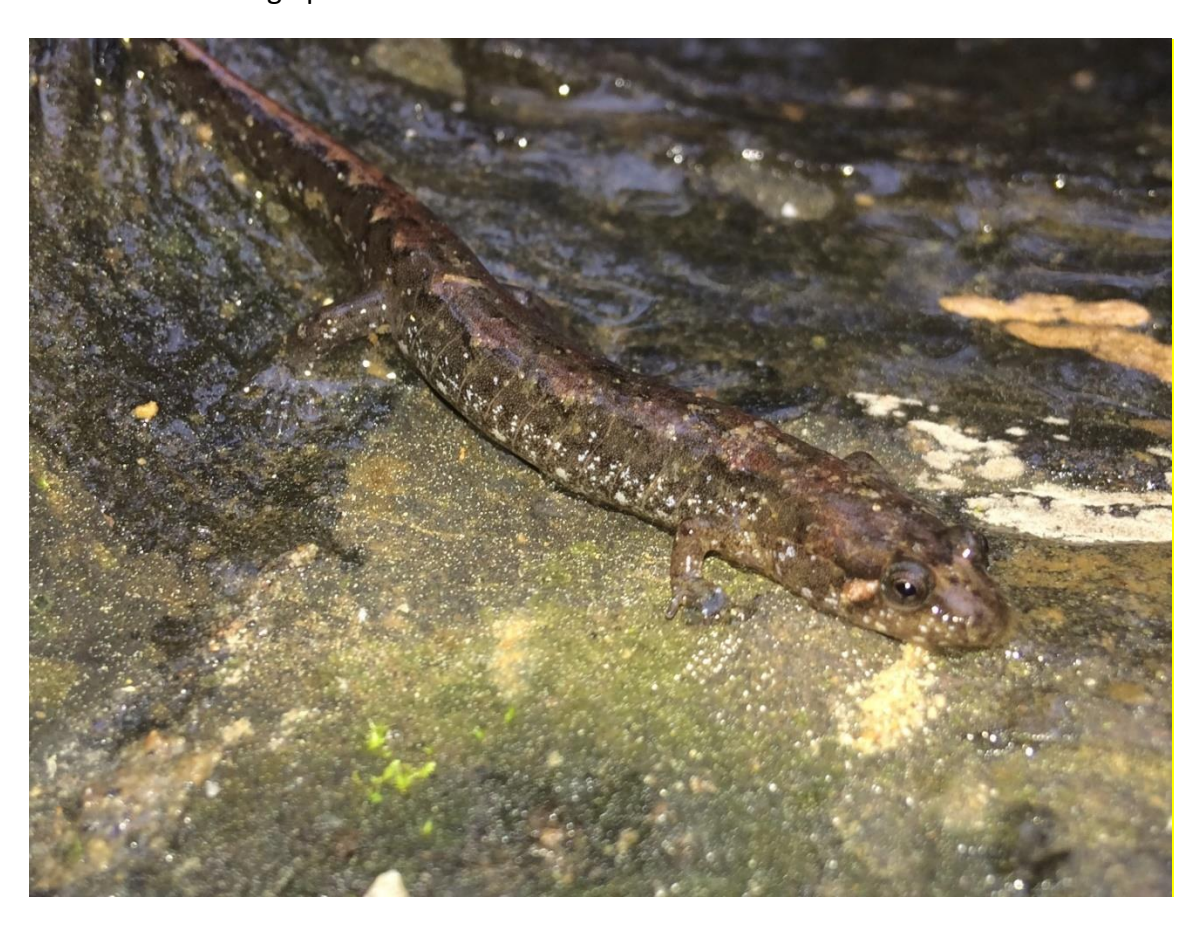
Figure 5. Apalachicola dusky salamander ( Desmognathus apalachicolae ) photographed on 19 February 2018 by Robert Gundy

Management Recommendations: Preserve seepage and spring-run streams. Avoid damage and pollution to surrounding uplands.