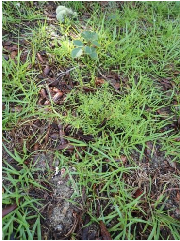
with cogon grass and centipedegrass