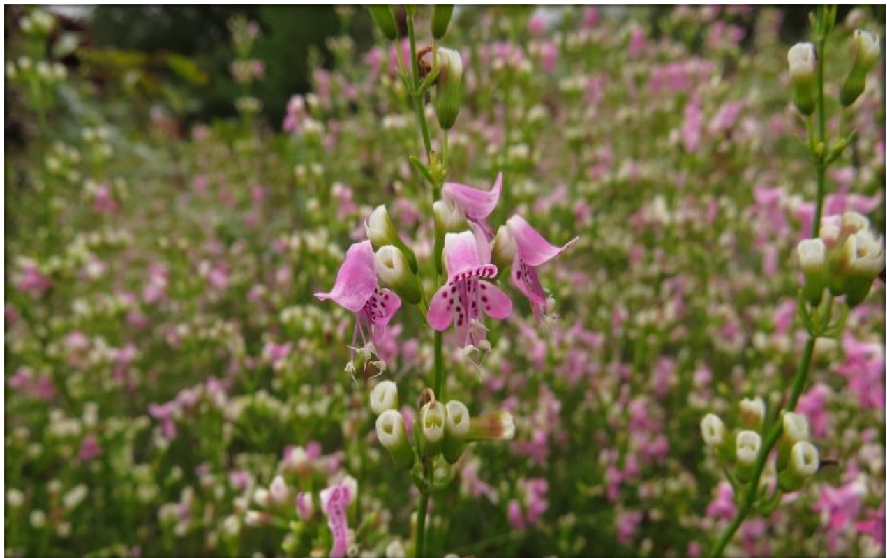
Figure 2. Longspurred mint ( Dicerandra cornutissima ) in bloom.