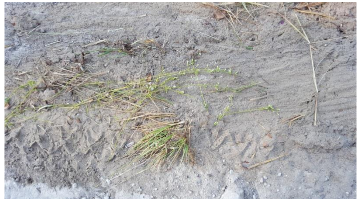
Figure 4. Disturbances (I-75, trash, invasive and non-native plants, neighborhood roadside, and construction equipment) to longspurred mint ( Dicerandra cornutissima ).