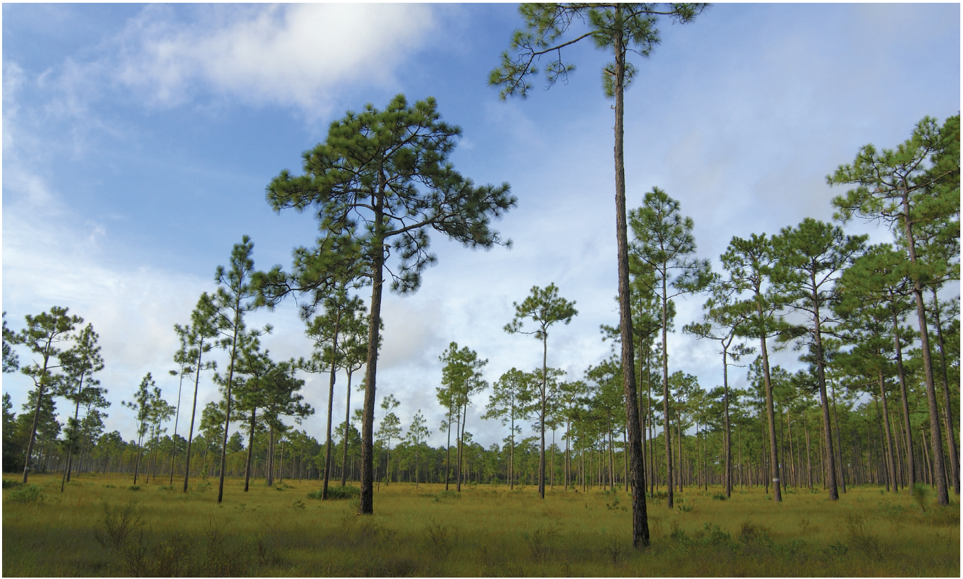
Grass-dominated wet flatwoods, Apalachicola National Forest (Liberty County)