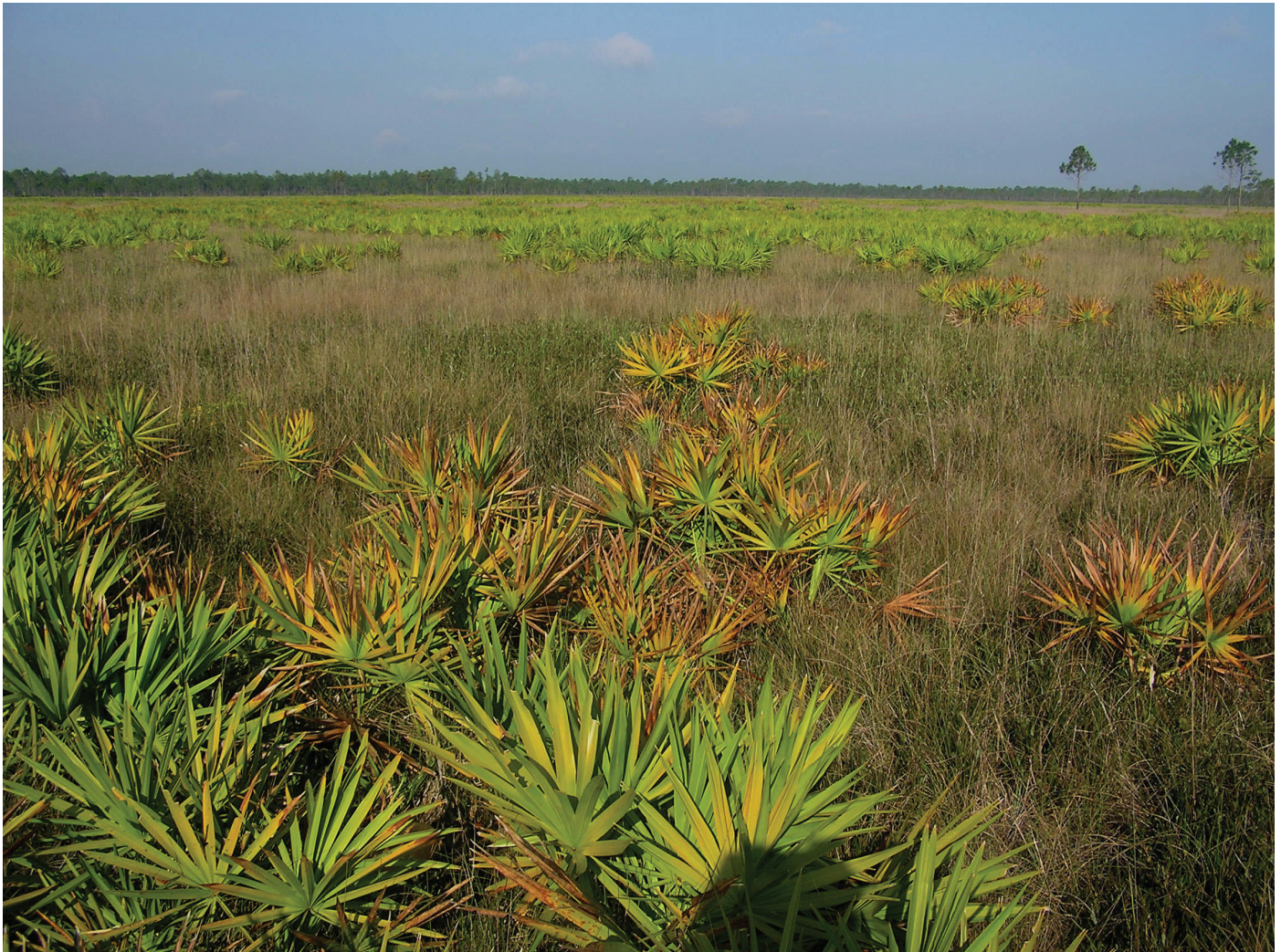
Babcock Ranch (Charlotte County)

Wiregrass, lopsided indiagrass, dwarf live oak, shiny blueberry, stunted saw palmetto