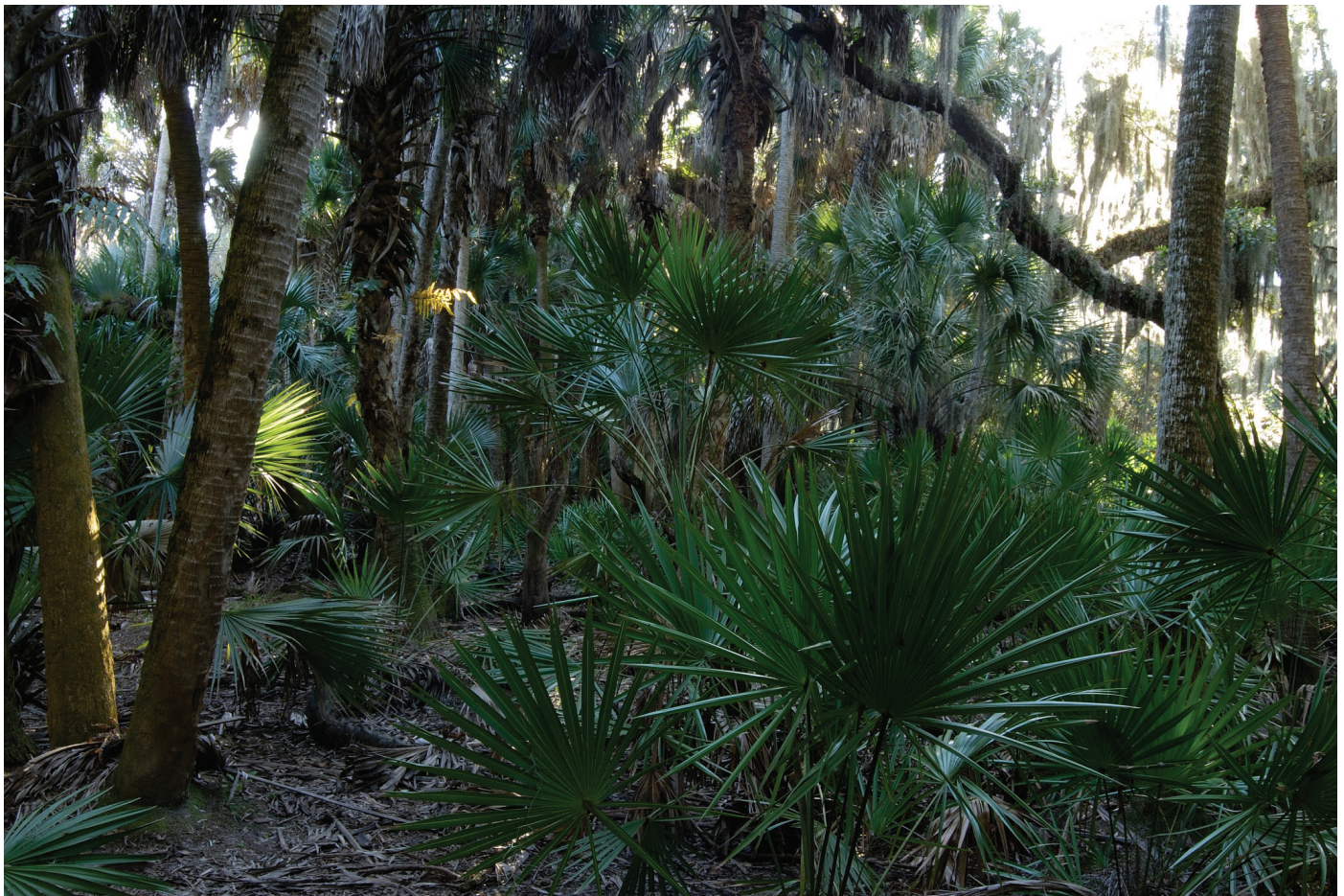
Myakka River State Park (Manatee &amp; Sarasota Counties)

caroliniana ) is often frequent, and various other woody species may be present including swamp dogwood ( Cornus foemina ), small-leaf viburnum ( Viburnum obovatum ), common persimmon ( Diospyros virginiana ), swamp bay ( Persea palustris ), wax myrtle ( Myrica cerifera ), dwarf palmetto ( Sabal minor ), American beautyberry ( Callicarpa americana ), and needle palm ( Rhapidophyllum hystrix ). Vines may be frequent and diverse; common species are eastern poison ivy ( Toxicodendron radicans ), peppervine ( Ampelopsis arborea ), rattan vine ( Berchemia scandens ), trumpet creeper ( Campsis radicans ), climbing hydrangea ( Decumaria barbara ), yellow jessamine ( Gelsemium sempervirens ), greenbriers ( Smilax spp.), summer grape ( Vitis aestivalis ), and muscadine ( Vitis rotundifolia ). Herb cover, when present includes mostly graminoids and ferns with the following species commonly encountered: sedges ( Carex spp.), woodoats ( Chasmanthium spp.), smooth elephantsfoot ( Elephantopus nudatus ), Carolina scalystem ( Elytraria caroliniensis ), woodsgrass ( Oplismenus hirtellus ), maiden ferns ( Thelypteris spp.), cinnamon fern ( Osmunda cinnamomea ), royal fern ( Osmunda regalis var. spectabilis ), toothed midsorus fern ( Blechnum serrulatum ),