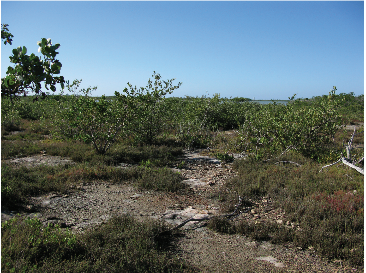
Naval Air Station Key West (Monroe County)

plant. It varies from stunted, sprawling, multi-stemmed shrubs to tree size. Other typical woody species are red mangrove ( Rhizophora mangle ), black mangrove ( Avicennia germinans ), white mangrove ( Laguncularia racemosa ), and christmasberry ( Lycium carolinianum ). At the transition to upland vegetation, buttonwood may be joined by a variety of shrubs and stunted trees of inland woody species, including saffron plum ( Sideroxylon celastrinum ), wild cotton ( Gossypium hirsutum ), Florida Keys blackbead ( Pithecellobium keyense ), bay cedar ( Suriana maritima ), white indigo berry ( Randia aculeata ), wild dilly ( Manilkara jaimiqui ), poisonwood ( Metopium toxiferum ), joewood ( Jacquinia keyensis ), Florida mayten ( Maytenus phyllanthoides ), and barbed-wire cactus ( Acanthocereus tetragonus ).