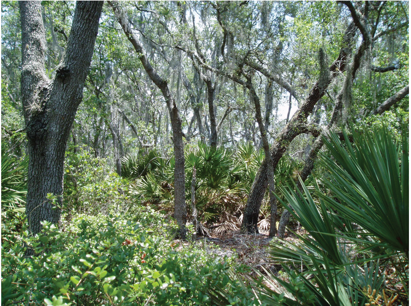
Lake Wales Ridge State Forest (Polk County)

tifolia ), rusty staggerbush ( Lyonia ferruginea ), fetterbush ( L. lucida ), sparkleberry ( Vaccinium arboreum ), deerberry ( V. stamineum ), black cherry ( Prunus serotina ), American beautyberry ( Callicarpa americana ), common persimmon ( Diospyros virginiana ), scrub palmetto ( Sabal etonia ), Hercules' club ( Zanthoxylum clava-herculis ), wild olive ( Osmanthus americanus ) or scrub wild olive ( O. megacarpus ), garberia ( Garberia heterophylla ), Florida rosemary ( Ceratiola ericoides ), and yaupon ( Ilex vomitoria ). The herb layer is generally very sparse or absent, but may contain some scattered wiregrass ( Aristida stricta var. beyrichiana ), sandyfield beaksedge ( Rhynchospora megalocarpa ), witchgrass ( Dichanthelium spp.), or forbs such as sweet goldenrod ( Solidago odora ). Muscadine ( Vitis rotundifolia ) and earleaf greenbrier ( Smilax auriculata ) are common vines. The epiphytes Spanish moss ( Tillandsia usneoides ) and ballmoss ( T. recurvata ) are often abundant.