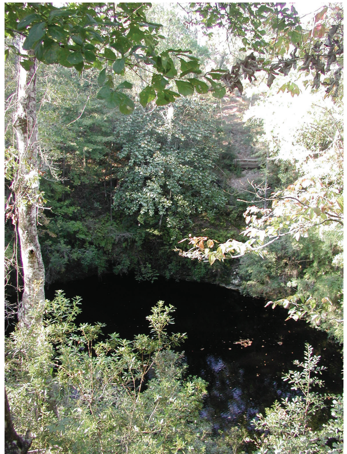
Big Dismal Sink (with sinkhole lake; Leon County)

Sinkholes occur throughout Florida 110,368,439 but are most common in North and Central Florida ranging from Leon and Wakulla counties in the Panhandle, south to the east coast in Flagler County, and southwest into parts of Polk and Highlands counties. Elsewhere in the Panhandle,