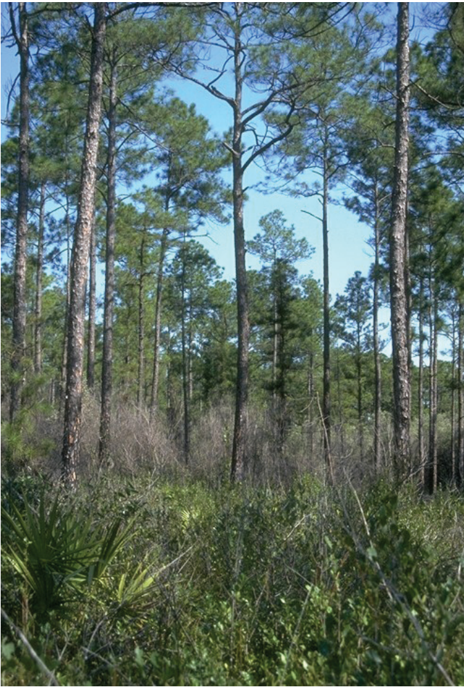
Shrub-dominated wet flatwoods, Tate's Hell State Forest (Franklin County)