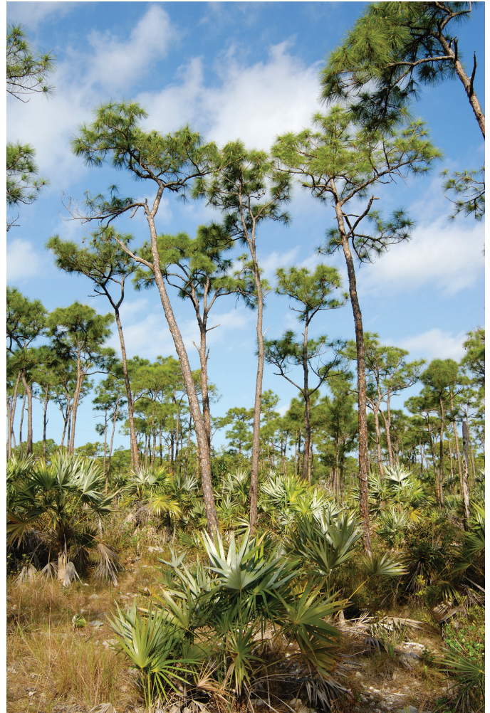
National Key Deer Refuge (Monroe County)