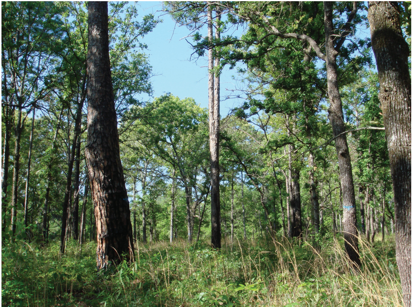
Apalachee Wildlife Management Area (Jackson County)

Upland mixed woodland occurs on loamy soils on drier sites than upland hardwood forest and is often found in the ecotone between upland hardwood forest and frequently burned sandhill or upland pine where fires burn into the hardwood forest edge. Its dominant hardwood species are more resistant to fire than are those in the upland hardwood forest and less resistant than those of the sandhills. 157