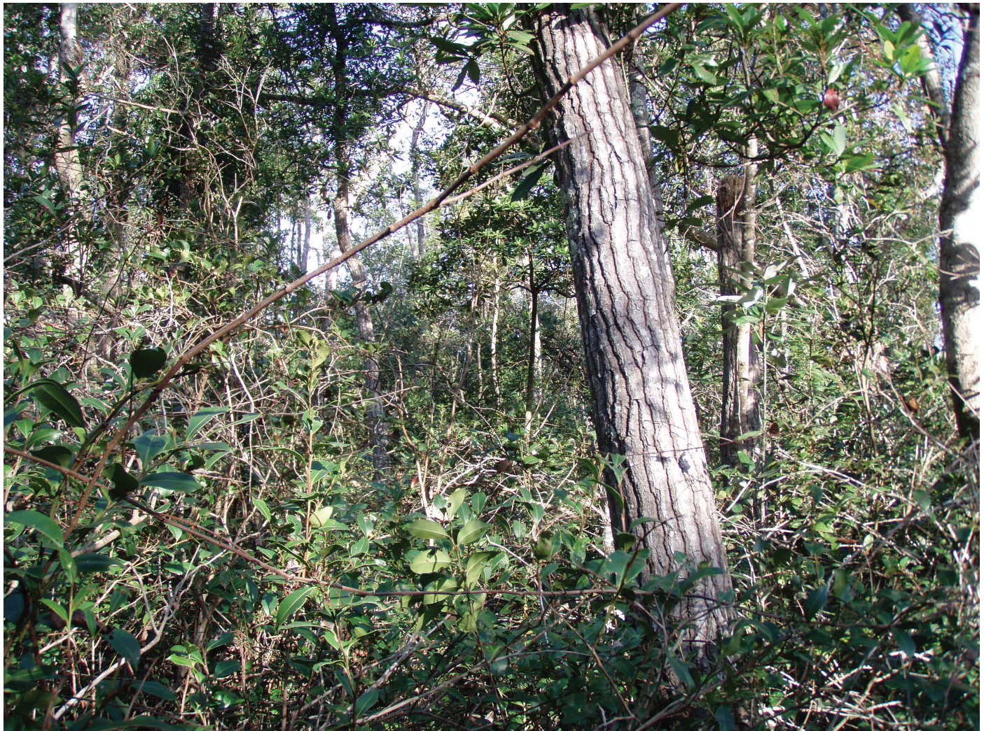
Little Big Econ State Forest (Seminole County)

of baygall in the Florida Panhandle, but uncommon in other areas. Loblolly pine ( Pinus taeda ), slash pine ( P. elliotii ), and/or pond pine ( P. serotina ) are often found in the canopy, as well as sweetgum ( Liquidambar styraciflua ), and in the Panhandle, Atlantic white cedar ( Chamaecyparis thuyoides ). Wetter baygalls may also contain swamp tupelo ( Nyssa sylvatica var. biflora ) and/or pond cypress ( Taxodium ascendens ). The canopy and understory do not generally form distinct strata but may appear as a dense, tall thicket. 57 Vines, especially laurel greenbrier ( Smilax laurifolia ), coral greenbrier ( S. walteri ), and muscadine ( Vitis rotundifolia ), may be abundant and contribute to the often impenetrable nature of the understory. Herbs are absent or few, and typically consist of ferns such as cinnamon fern ( Osmunda cinnamomea ), netted chain fern ( Woodwardia areolata ), and Virginia chain fern ( W. virginica ). Sphagnum mosses ( Sphagnum spp.) are common.