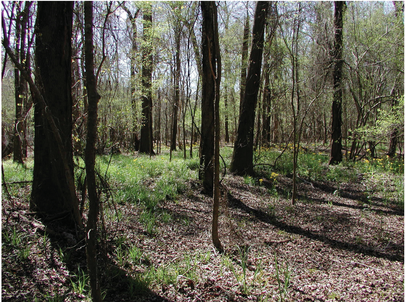
Apalachicola River Water Management Area (Liberty County)

Alluvial forest occurs in river floodplains and occupies low levees along channels, expansive flats located behind