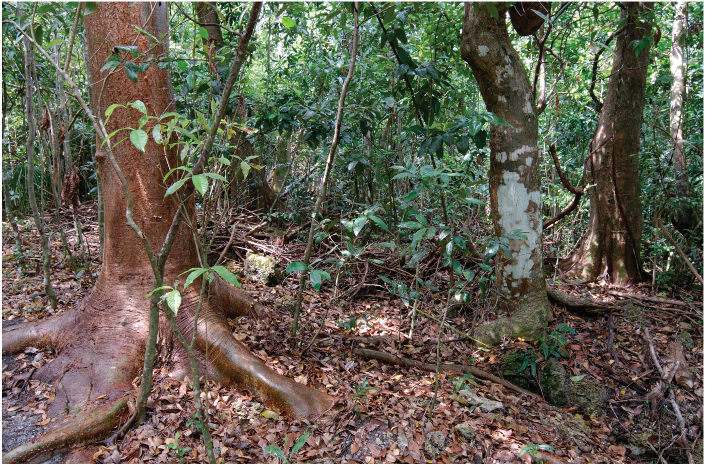
Matheson Hammock (Miami-Dade County)

glauca ), willow bastic ( Sideroxylon salicifolium ), black ironwood ( Krugiodendron ferreum ), inkwood ( Exothea paniculata ), live oak ( Quercus virginiana ), poisonwood ( Metopium toxiferum ), and West Indies mahogany ( Swietenia mahagoni ). Mature hammocks can be open beneath a tall well-defined canopy and subcanopy. More commonly, in less mature or disturbed hammocks, dense woody vegetation of varying heights from canopy to short shrubs is often present. Species that generally make up the shrub layers within rockland hammock include several species of stoppers ( Eugenia spp.), thatch palms ( Thrinax morrisii and T. radiata ), sea torchwood ( Amyris elemifera ), marlberry ( Ardisia escallonioides ), wild coffee ( Psychotria nervosa ), satinleaf ( Chrysophyllum oliviforme ), cabbage palm ( Sabal palmetto ), lignum-vitae ( Guaiaecum sanctum ), hog plum ( Ximenia americana ), soldierwood ( Colubrina elliptica ), two species of blackbead ( Pithecellobium unguis-cati and Pithecellobium keyense ), seagrape ( Coccoloba uvifera ), and greenheart ( Colubrina arborescens ). Vines can be common and include eastern poison ivy ( Toxicodendron radicans ), earleaf greenbrier ( Smilax auriculata ), Everglades greenbrier ( Smilax havanensis ), Virginia creeper ( Parthenocissus