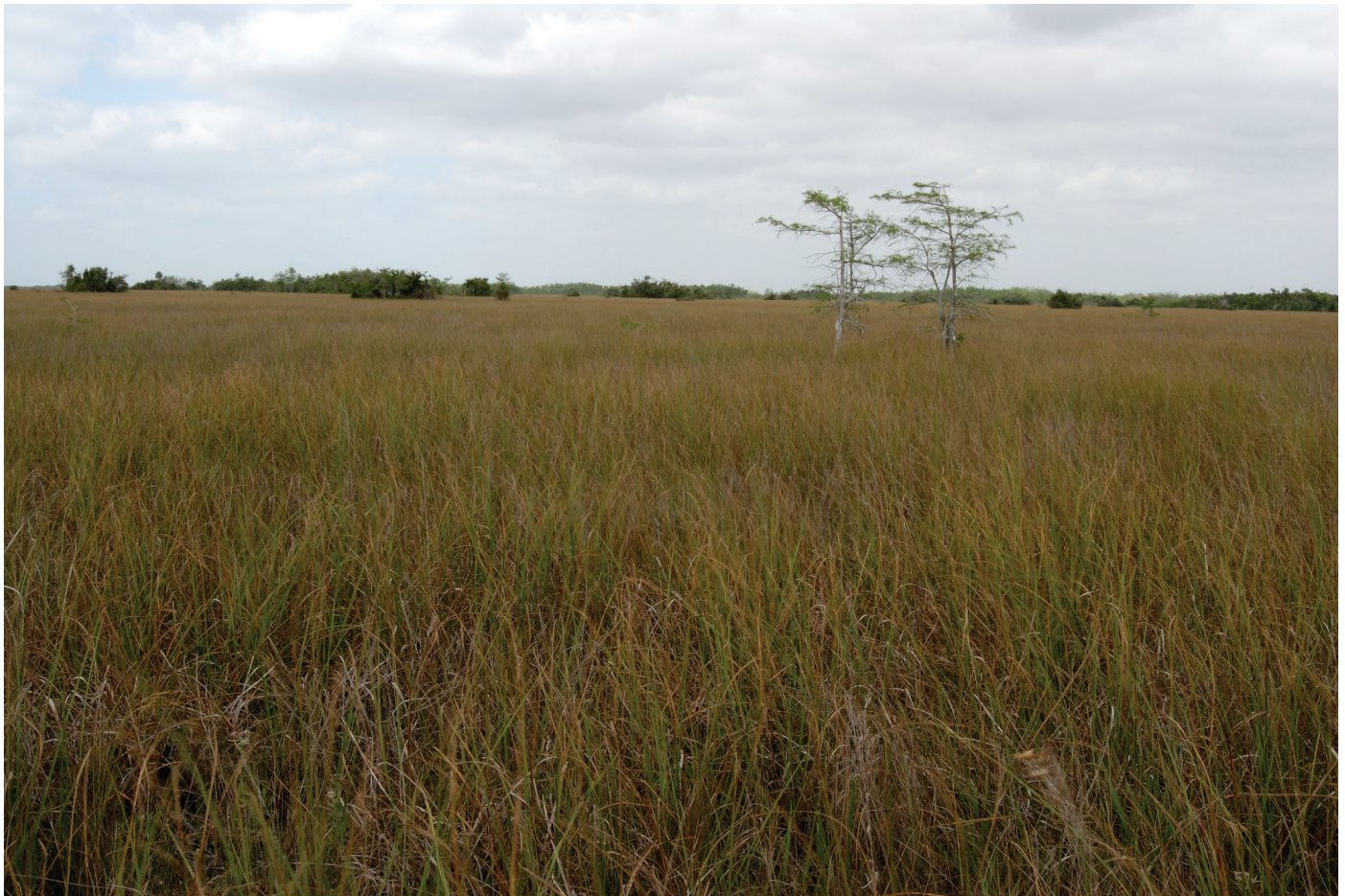
Everglades National Park (Miami-Dade County)

ily gain importance, such as southern amaranth ( Amaranthus australis ), dogfennel ( Eupatorium capillifolium ), sugarcane plumegrass ( Saccharum giganteum ), broomsedges ( Andropogon spp.), giant bristlegrass ( Setaria magna ), camphorweeds ( Pluchea spp.), thistles ( Cirsium spp.), asters ( Symphotrichum spp.), and knotweeds ( Polygonum spp.). Saltmarsh morning glory ( Ipomoea sagittata ), and white twinevine ( Sarcostemma clausum ) may be found climbing sawgrass blades. 249 Woody vegetation is sparse, and generally only found around so-called "gator holes" or near the edges of the many tree islands that dot the landscape of the Everglades. Coastalplain willow ( Salix caroliniana ), coco plum ( Chrysobalanus icaco ), and common buttonbush ( Cephalanthus occidentalis ) are typical of these locations. Cattails ( Typha spp.) are increasingly abundant in areas of the Everglades where water quality is degraded by agricultural run-off or where water is impounded by roads and canals. In glades marsh with relatively sparse vegetation, mats of algae called periphyton are commonly attached to plants in the water column. This periphyton is often considered calcareous due to the dominance of certain filamentous blue-green algae species. 41