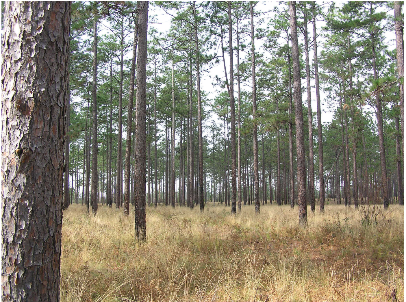
Blue Springs Tract of Twin Rivers State Forest (Hamilton County)

layers) in areas that have experienced a lack of fire for many years. Shrub cover can vary from sparse to dense, and includes low-growing species such as dwarf huckleberry ( Gaylussacia dumosa ), running oak ( Q. elliotii ), gallberry ( Ilex glabra ), and Darrow's blueberry ( Vaccinium darrowii ). Herbaceous cover varies, from sparse to abundant, dependent upon the density and shading effects of the shrubs. Wiregrass ( Aristida stricta var. beyrichiana ) is often dominant, but a high diversity of grasses and forbs may be present; as many as 40-50 species m-2.214 In addition to wiregrass, other common grasses are little bluestem ( Schizachyrium scoparium ), broomsedge bluestem ( Andropogon virginicus ), hairawn muhly ( Muhlenbergia capillaris ), and indiagrass ( Sorghastrum spp.). Typical forbs include oblongleaf twinflower ( Dyschoriste oblongifolia ), narrowleaf silkgrass ( Pityopsis graminifolia ), pineland silkgrass ( Pityopsis aspera ), scaleleaf aster ( Symphotrichum adnatum ), bracken fern ( Pteridium aquilinum ), goldenrod