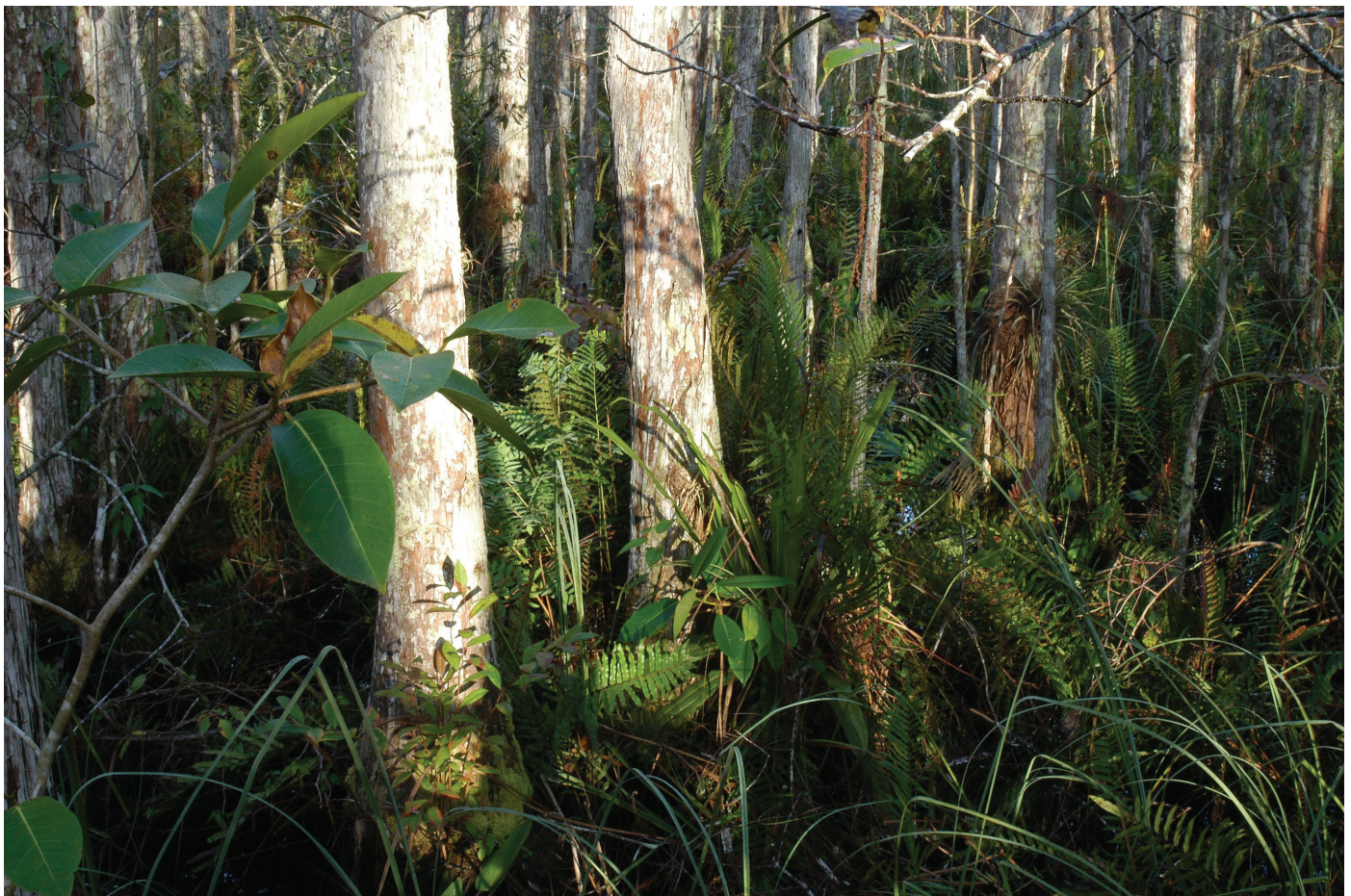
Corkscrew Swamp (Collier County)

Strand swamp soils are peat and sand over limestone. Swamps with larger cypress and a more diverse understory are on deep peat that acts as a wick to draw moisture from groundwater up into the root zone during droughts. 97 Swamp edges, however, often have little organic matter over deep sand. The normal hydroperiod ranges from 100-300 days. 96 Water levels rise with increas-