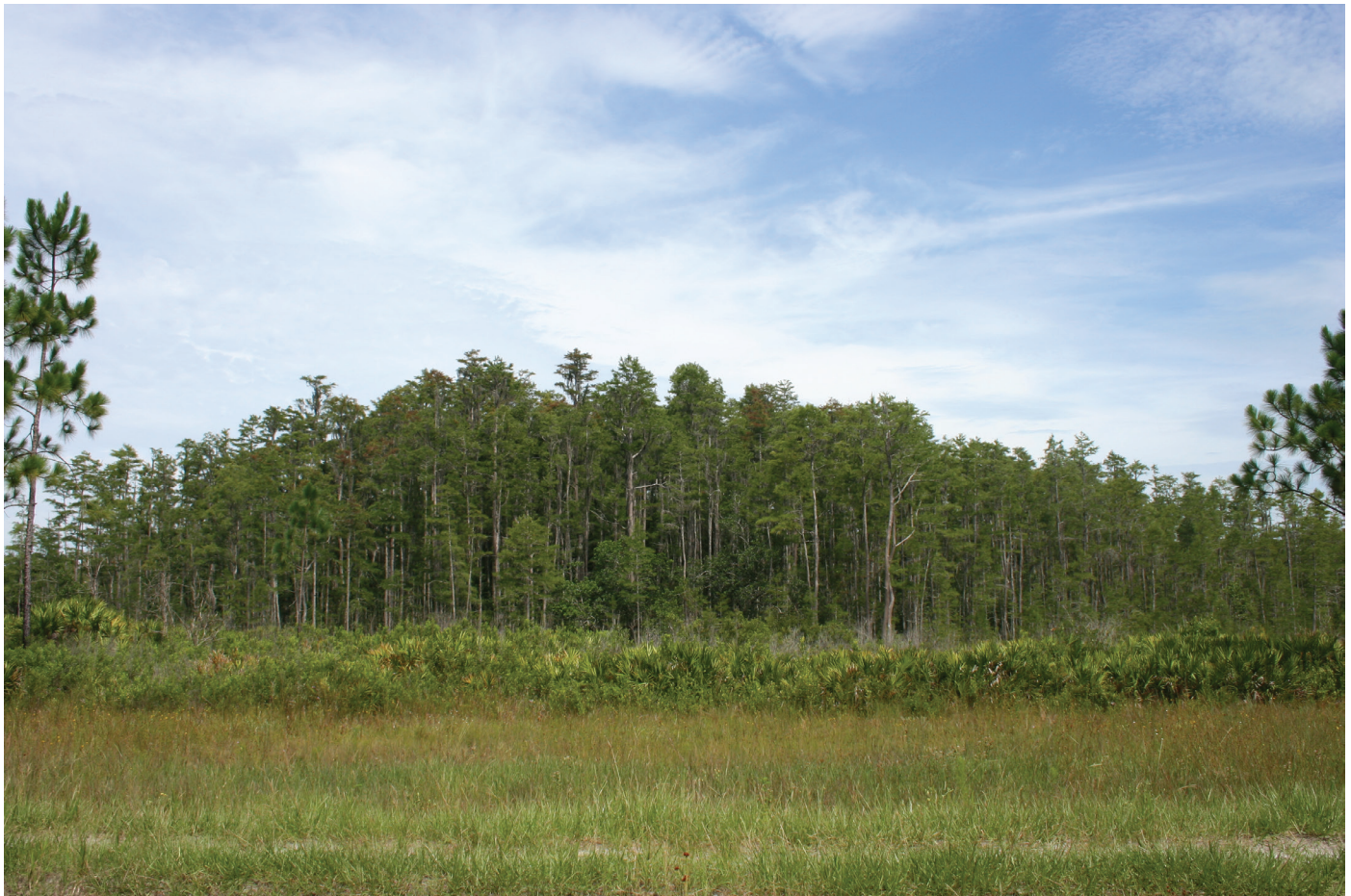
Three Lakes Wildlife Management Area (Osceola County)

( Cephalanthus occidentalis ), coastalplain willow ( Salix caroliniana ), wax myrtle ( Myrica cerifera ), titi ( Cyrilla racemiflora ), and St. John's wort ( Hypericum spp.). Herbaceous species can be dense or absent and include a wide variety of ferns, graminoids, and herbs including Virginia chain fern ( Woodwardia virginica ), royal fern ( Osmunda regalis var. spectabilis ), cinnamon fern ( Osmunda cinnamomea ), toothed midsorus fern ( Blechnum serrulatum ), maidencane ( Panicum hemitomon ), sawgrass ( Cladium jamaicense ), various species of beaksedge ( Rhynchospora spp.), lizard's tail ( Saururus cernuus ), Carolina redroot ( Lachnanthes caroliniana ), taperleaf waterhorehound ( Lycopus rubellus ), false nettle ( Boehmeria cylindrica ), and knotweeds ( Polygonum spp.). Sphagnum moss ( Sphagnum spp.) often occurs in patches where the soil is saturated but not flooded. 280 Vines such as eastern poison ivy ( Toxicodendron radicans ), white twinevine ( Sarcostemma clausum ), laurel greenbrier ( Smilax laurifolia ), epiphytes such as Spanish moss ( Tillandsia usneoides ), several species of wild pine ( Tillandsia spp.), and orchids can be common in dome swamps. The center of the dome swamp contains the largest cypress trees and the understory can be open with deeper water