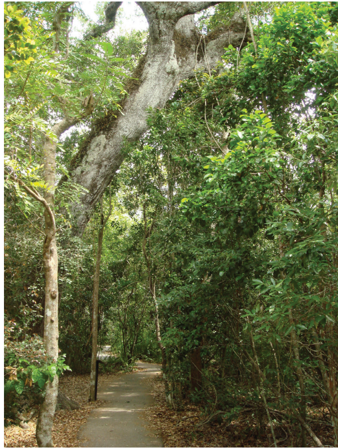
Everglades National Park (Miami-Dade County)

Other synonyms: Low, medium, and high productivity rockland hammock 345 ; evergreen seasonal forest 20