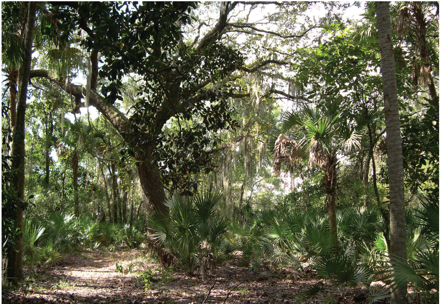
Salt Lake Wildlife Management Area (Brevard County)

The shrubby understory may be dense or open, tall or short, and is typically composed of a mix of saw palmetto ( Serenoa repens ), American beautyberry ( Callicarpa americana ), American holly ( Ilex opaca ), gallberry ( I. glabra ), sparkleberry ( Vaccinium arboreum ), hog plum ( Ximenia americana ), common persimmon ( Diospyros virginiana ), highbush blueberry ( Vaccinium corymbosum ), Carolina laurelcherry ( Prunus caroliniana ), yaupon ( I. vomitoria ), wild olive ( Osmanthus americanus ), and/or wax myrtle ( Myrica cerifera ). Tropical shrubs such as Simpson's stopper ( Myrcianthes fragrans ), myrsine ( Rapanea punctata ), and wild coffee ( Psychotria nervosa ) are common in more southern mesic hammock. The herb layer is often sparse or patchy and consists of various graminoids, including low panic grasses ( Panicum spp.), witchgrasses ( Dichanthelium spp.), woodsgrass ( Oplismenus hirtellus ), longleaf woodoats ( Chasmanthium laxum var. sessiliflorum ), sedg-