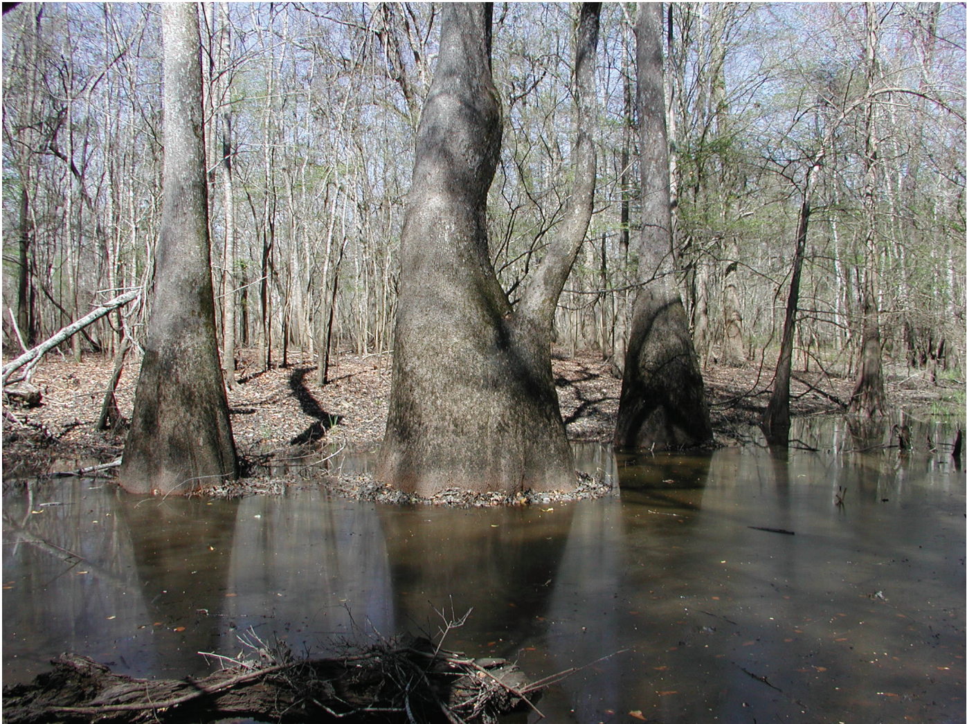
Near the Florida River, Apalachicola Water Management Area (Liberty County)

Escambia River, Apalachicola River, Choctawhatchee River, Suwannee River, Holmes Creek, Oklawaha River, Withlacoochee River, and most other rivers and streams in Florida