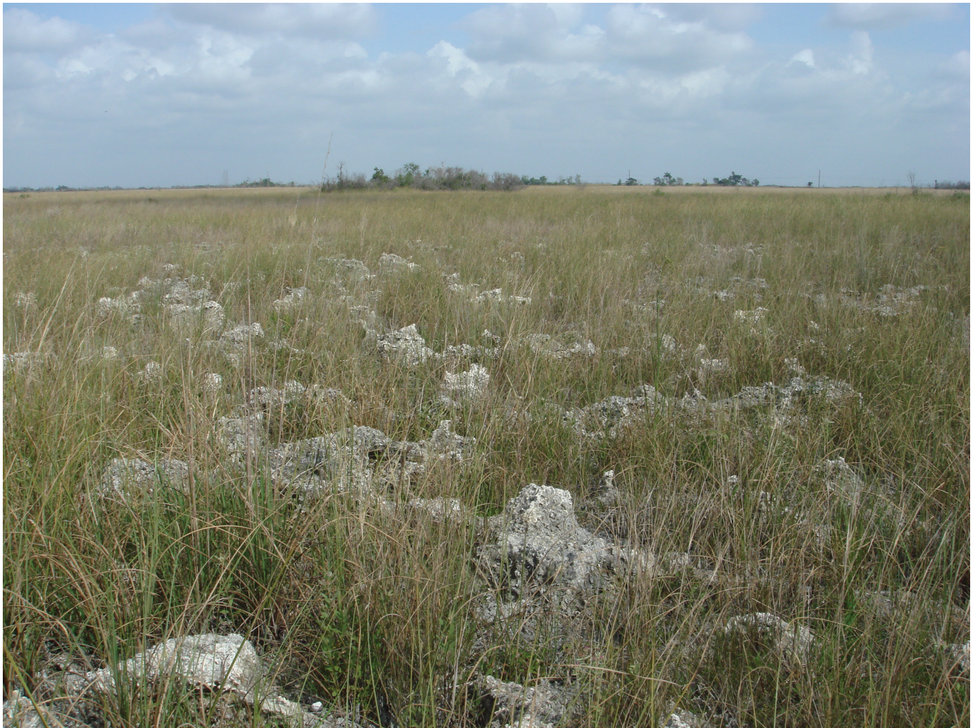
Everglades National Park (Miami-Dade County)

In the Big Cypress region, widely scattered, stunted pond cypress ( Taxodium ascendens ) is often present in the marl prairie. These trees, sometimes called dwarf, scrub, or hat