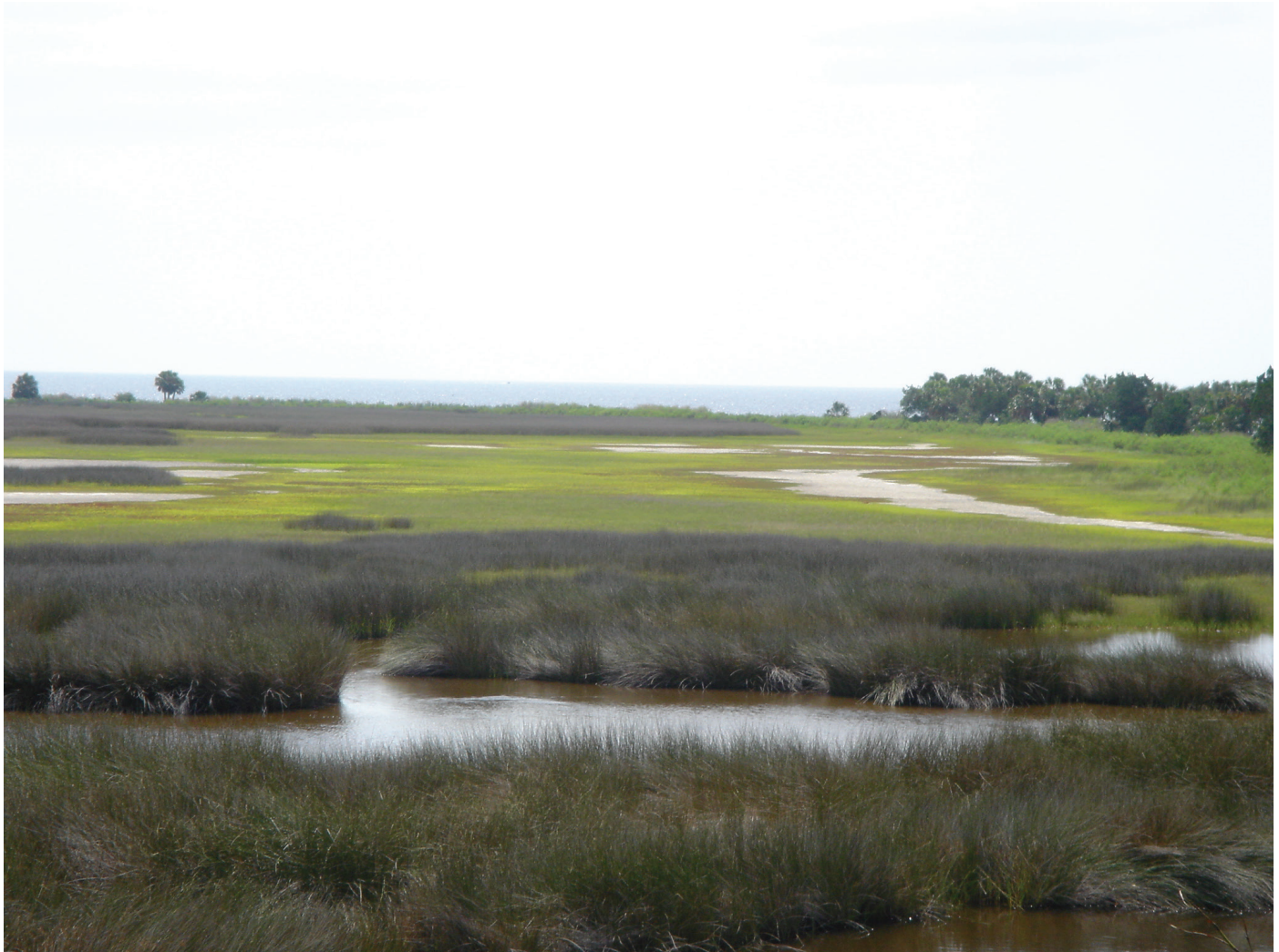
St. Marks National Wildlife Refuge (Wakulla County)

Salt marsh soils range from deep mucks with high clay and organic content in the deeper portions to silts and fine sands in higher areas. The organic soils have a high salinity, neutral reaction, and high sulfur content; soil