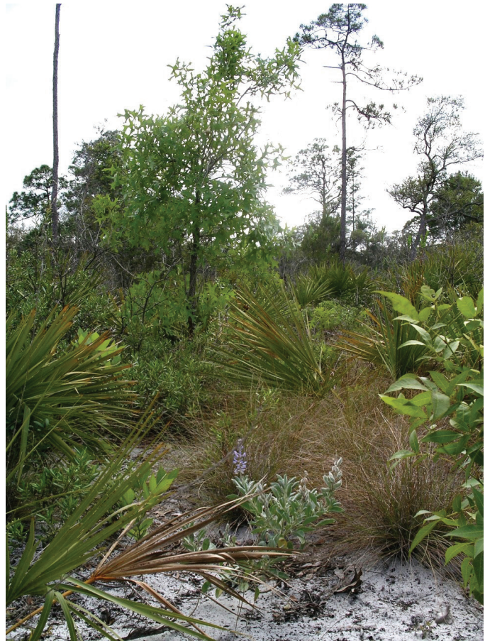
Archbold Biological Station (Highlands County)