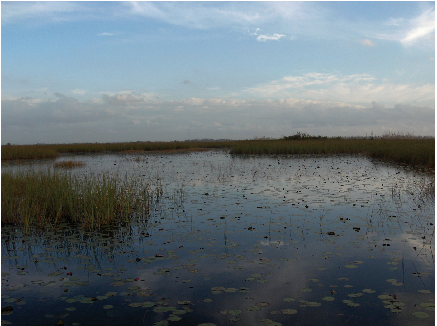
Everglades Wildlife and Environmental Area (Broward County)

woody species include cypress ( Taxodium spp.) and common buttonbush ( Cephalanthus occidentalis ). Where emergent herbs are present, alligatorflag ( Thalia geniculata ), bandana-of-the-Everglades ( Canna flaccida ), pickerelweed ( Pontederia cordata ), bulltongue arrowhead ( Sagittaria lancifolia ), giant cutgrass ( Zizaniopsis miliacea ), and lizard's tail ( Saururus cernuus ) are common. Deeper sloughs may contain floating and submerged aquatic plants such as American white waterlily ( Nymphaea odorata ), big floatingheart ( Nymphoides aquatica ), yellow pondlily ( Nuphar advena ), frog's bit ( Limnobium spongia ), duckweeds ( Lemna spp.), and bladderworts ( Utricularia spp.). In south Florida, submerged plants and algae (including cyanobacteria, known as periphyton, found in more alkaline waters) can form mats in sloughs that contribute food and oxygen. 148 South Florida pond apple sloughs are ideal, moist, warm habitats for rare and endangered tropical epiphytes. Pond apple branches are often densely covered with such epi-