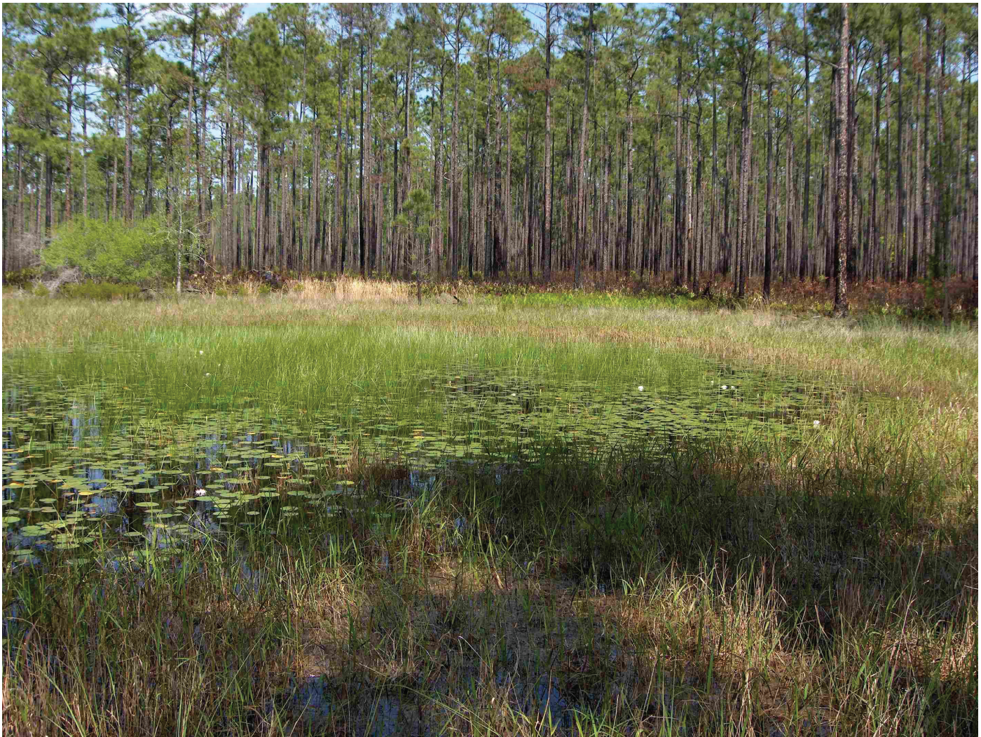
Goethe State Forest (Levy County)