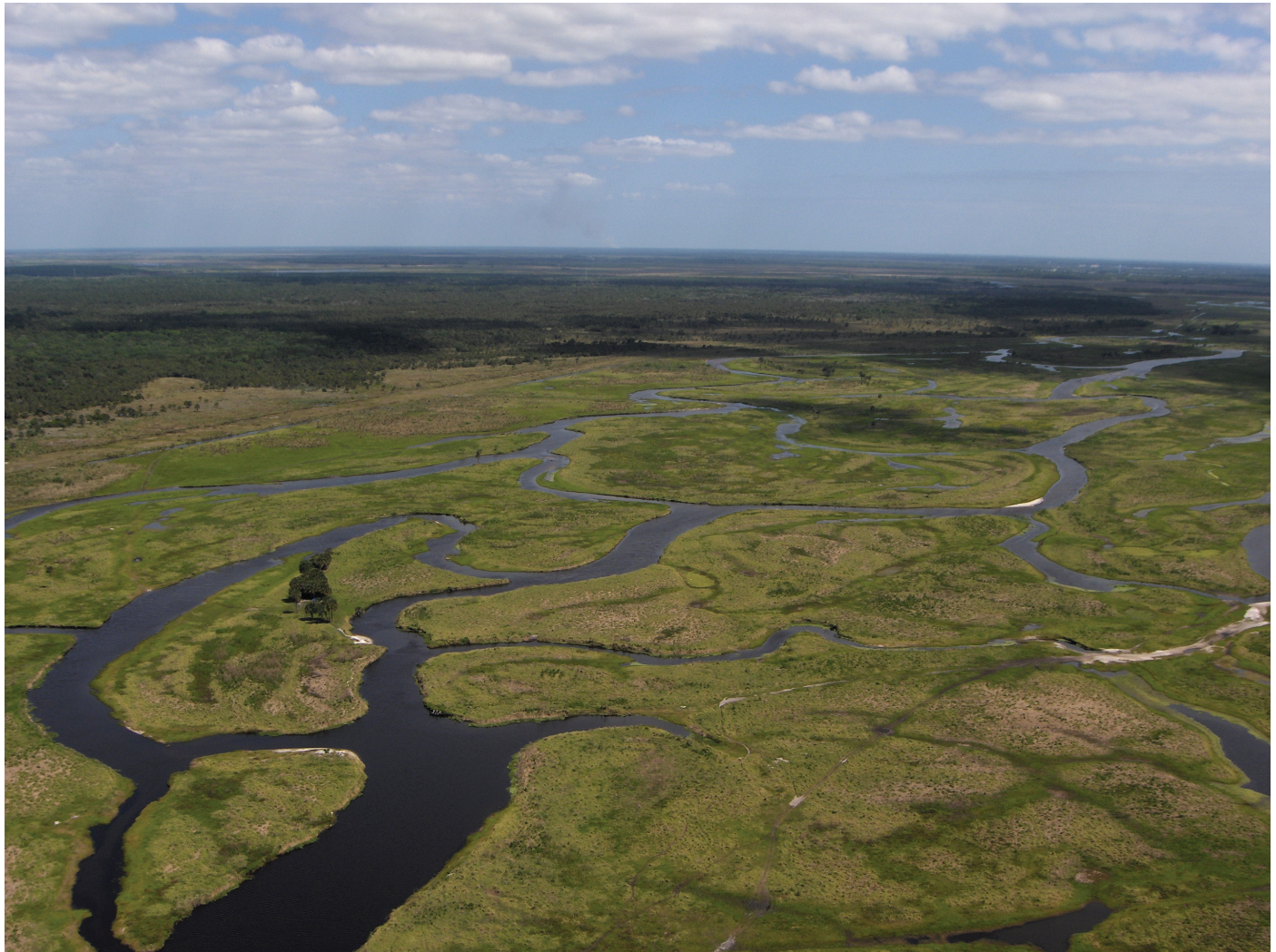
St. Johns River at Tosohatchee Wildlife Management Area (Orange County)

graminoids and forbs. While the progression from high to low marsh occurs generally from the upland edge to the river edge, these vegetation patches may also be scattered throughout the marsh, which provides a diversity of habitats beneficial to wildlife. Additional herbs can include dotted smartweed ( Polygonum punctatum ), bulrushes ( Scirpus spp.), common reed ( Phragmites australis ), tickseeds ( Coreopsis spp.), primrosewillows ( Ludwigia spp.), fimbries ( Fimbristylis spp.), spikerushes ( Eleocharis spp.), flatsedges ( Cyperus spp.), manyflower marshpennywort ( Hydrocotyle umbellata ), soft rush ( Juncus effusus ssp. solutus ), grassleaf rush ( Juncus marginatus ), beaksedges ( Rhynchospora spp.), rosy camphorweed ( Pluchea rosea ), lemon bacopa ( Bacopa caroliniana ), spadeleaf ( Centella asiatica ), swamp rosemallow ( Hibiscus grandiflorus ), saltmarsh morning glory ( Ipomoea sagittata ), cattails ( Typha spp.), southern cutgrass ( Leersia hexandra ), and climbing hempvine ( Mikania scandens ). 233,435 Other than occasional thickets, woody vegeta-