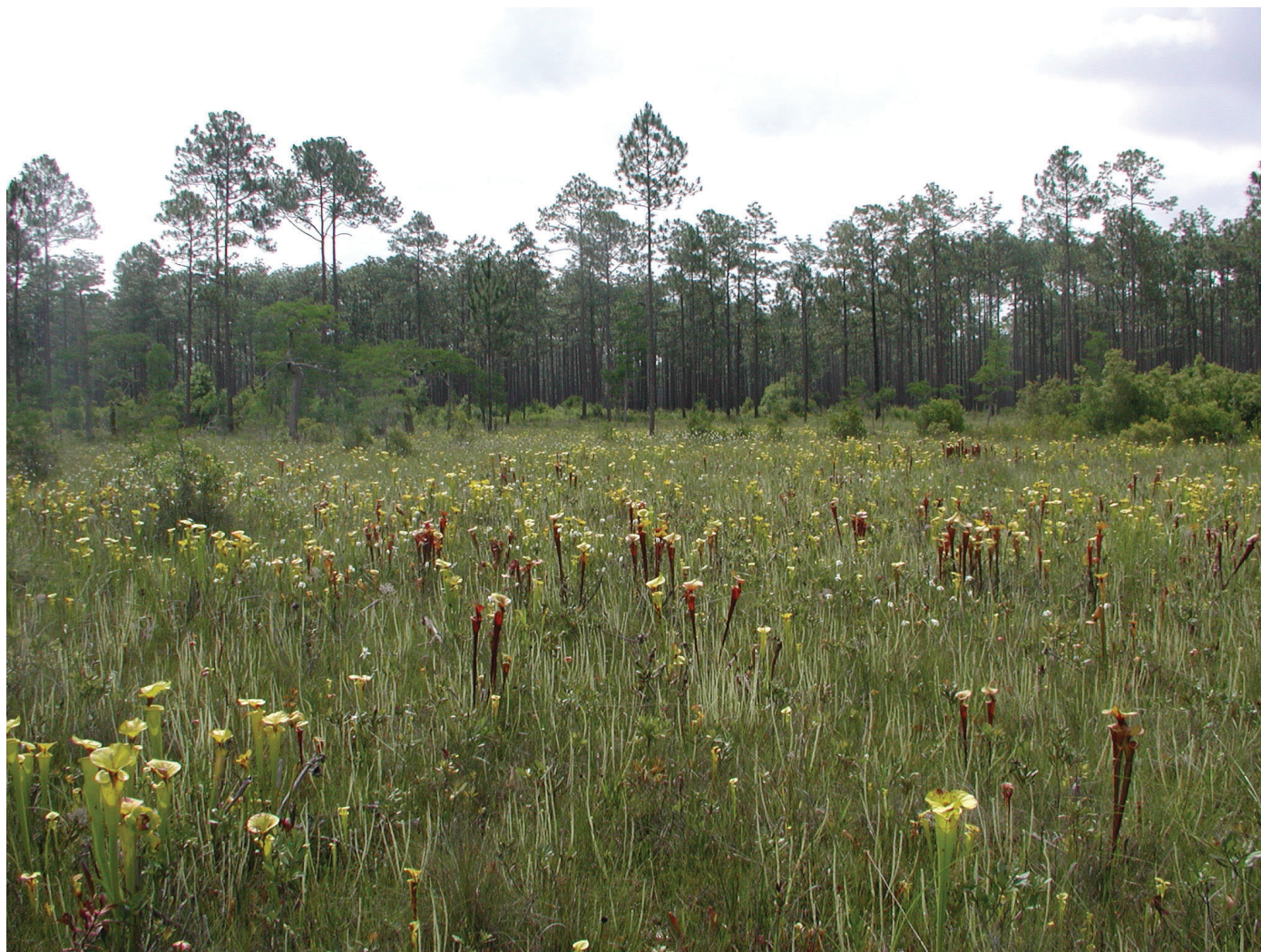
Apalachicola National Forest (Liberty County) – Pitcherplant Prairie variant