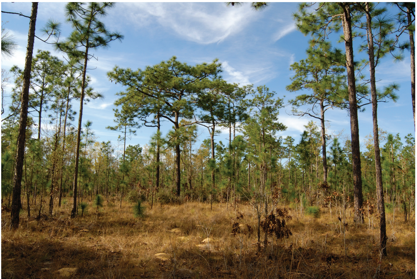
Gold Head Branch State Park (Clay County)

Sandhill occurs on crests and slopes of rolling hills and ridges with steep or gentle topography. Soils are deep,