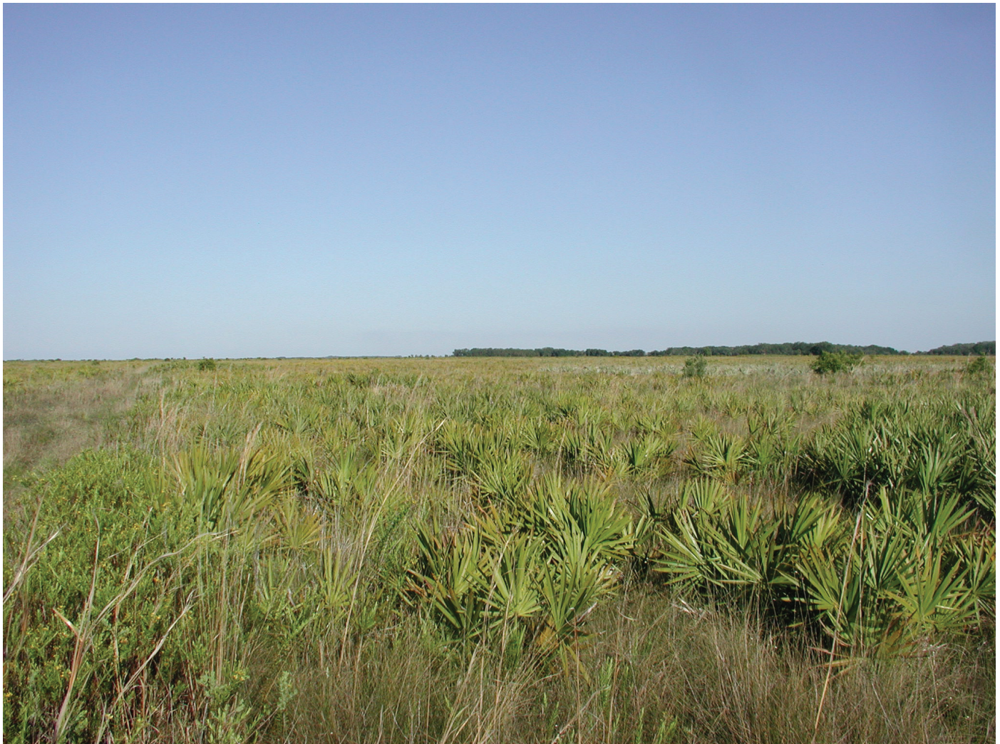
Three Lakes Wildlife Management Area (Osceola County)