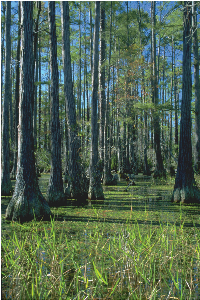
Eglin Air Force Base (Okaloosa County)