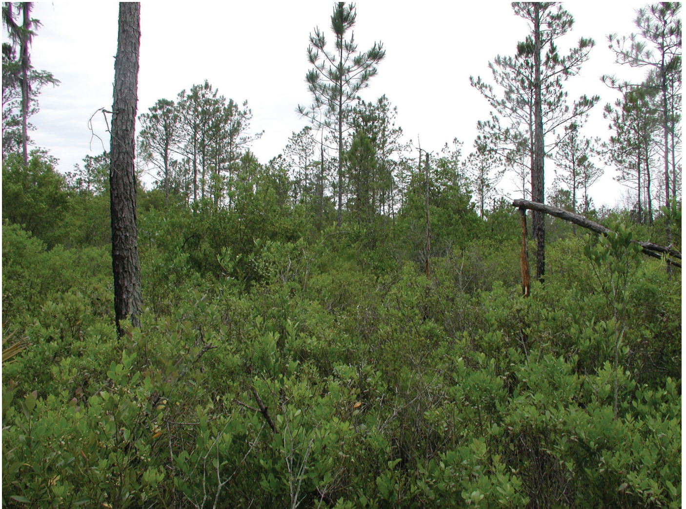
Aucilla Wildlife Management Area (Jefferson County)

Shrub bog is found on the border of swamps, in stream-head drainages, and in flat, poorly drained areas between rivers. It often forms the border between the mesic or wet flatwoods communities and dome swamp, basin swamp, or hydric hammock communities. Shrub bog may cover large portions of low-lying areas in the coastal plain known as “bays” (e.g., San Pedro Bay in Madison and Tay-