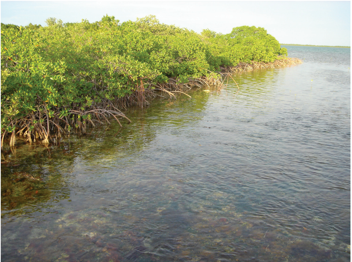
Florida Keys Wildlife and Environmental Area (Monroe County)

The density and height of mangroves and the diversity of associated herbaceous species can vary considerably within a mangrove swamp. Mangroves typically occur in dense stands but may be sparse, particularly in upper tidal reaches where salt marsh species predominate. Mangroves may range from trees more than 80 feet (25 m) tall to dwarf shrubs growing on solid limestone rock, but most commonly exist at intermediate heights of 10 to 20 feet tall (3 to 7 m). Mangrove swamps often exist with no understory, although shrubs such as seaside ox-eye ( Borrchia arborescens , B. frutescens ) and vines including gray nicker ( Caesalpinia bonduc ), coinvine ( Dalbergia ecastaphyllum ), and rubbervine ( Rhabdadenia biflora ), and herbaceous species such as saltwort ( Batis maritima ), shoregrass ( Monanthochloe littoralis ), perennial glasswort ( Sarcocornia perennis ), and giant leather fern ( Acrostichum danaeifolium ), where present, occur most commonly in openings and along swamp edges.