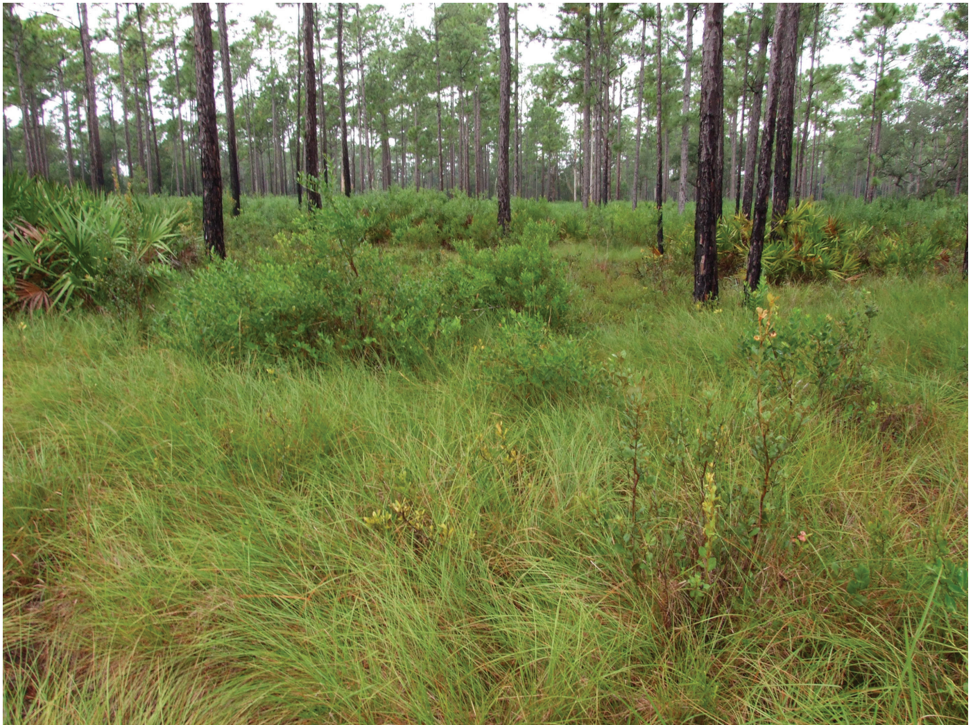
Avon Park Air Force Range (Polk County) with cutthroat grass ( Panicum abscissum ) understory

Wet flatwoods often occur in the ecotones between mesic flatwoods and shrub bogs, wet prairies, dome swamps, or strand swamps. Wet flatwoods also occur in broad, low flatlands, often in a mosaic with these communities.