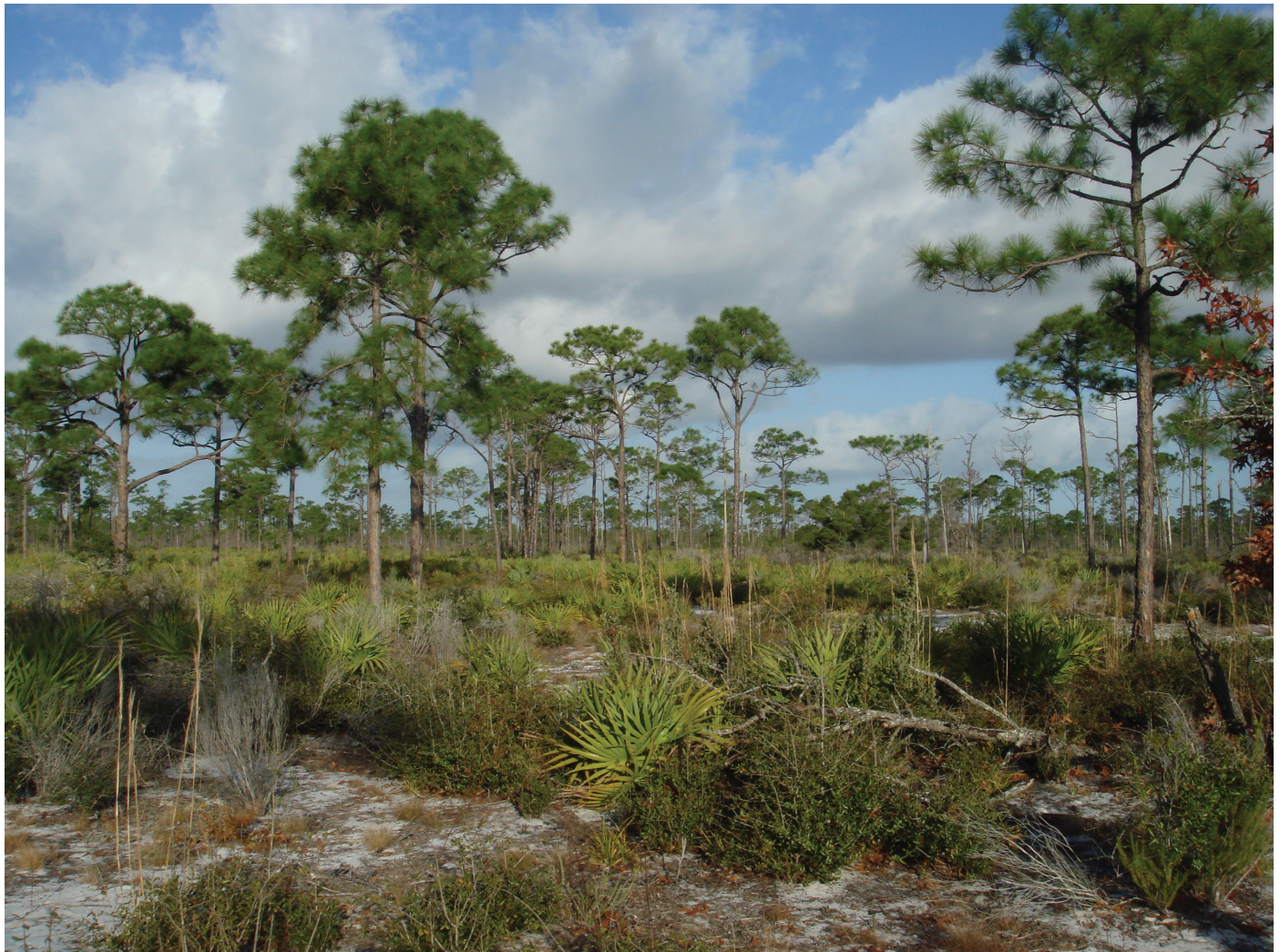
Jonathan Dickinson State Park (Martin County)

Scrubby flatwoods occur on slight rises within mesic flatwoods and in transitional areas between scrub and mesic flatwoods. Soils of scrubby flatwoods are