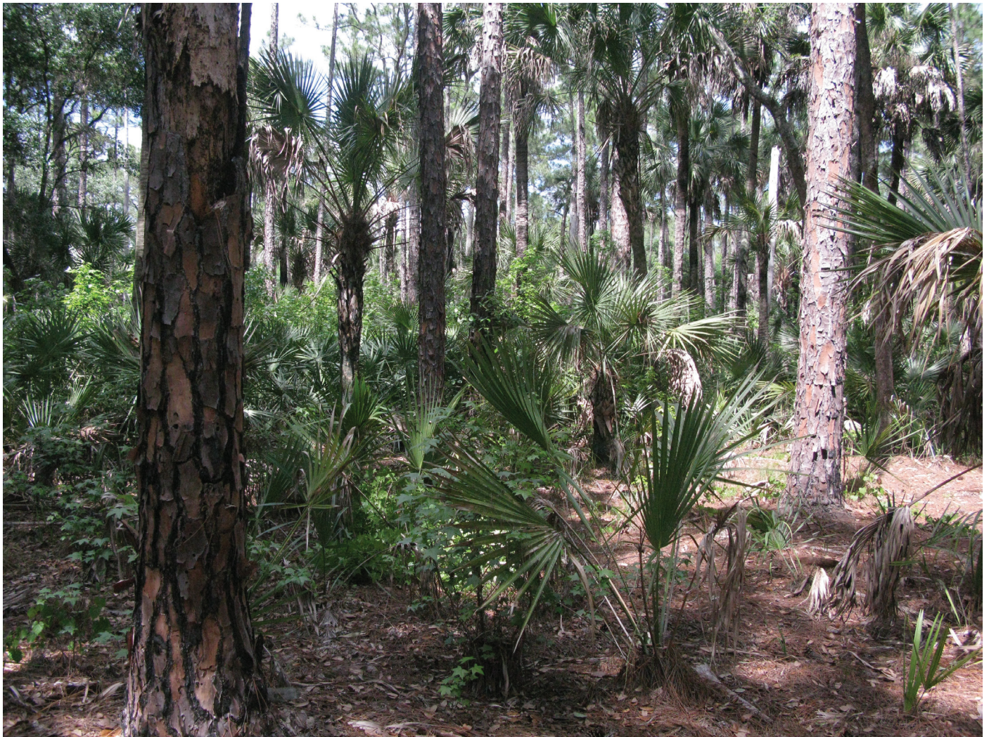
Cabbage Palm Variant – Tosohatchee Wildlife Management Area (Orange County)