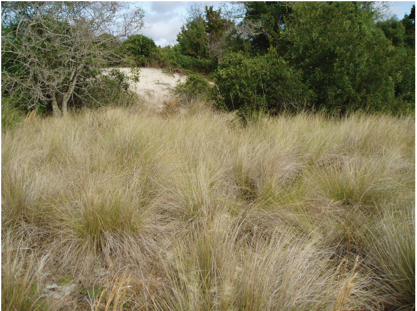
Timucuan Ecological and Historic Preserve (Duval County)

the low flats in the more stable portions of the barrier islands. Moist grasslands may be dominated by hairawn muhly ( Muhlenbergia capillaris ), lovegrass ( Eragrostis spp.), sand cordgrass ( Spartina bakeri ) or saltmeadow cordgrass ( Spartina patens ). Damp sand flats have a sparse cover of such herbs as yellow hatpins ( Syngonanthus flavidulus ), Le Conte's flatsedge ( Cyperus lecontei ), and Engler's bogbutton ( Lachnocaulon engleri ). Nearer the shore, where swales are exposed to occasional salt water intrusion, they may be dominated by halophytic species such as seashore paspalum ( Paspalum vaginatum ) and marsh fimbry ( Fimbristylis spadicea ). Hurricanes and tropical storms can flood swales with salt water, after which they are colonized for a time by more salt-tolerant species such as needle rush, Gulf Coast spikerush ( Eleocharis cellulosa ), and yellow spikerush ( Eleocharis flavescens ). Loose, blowing sand prevalent after storms favors the spread of saltmeadow cordgrass which tolerates burial better than the other grass species. 196