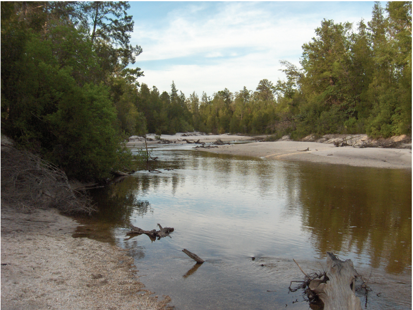
Atlantic white cedar dominated bottomland forest along river, Blackwater River State Forest (Santa Rosa County)