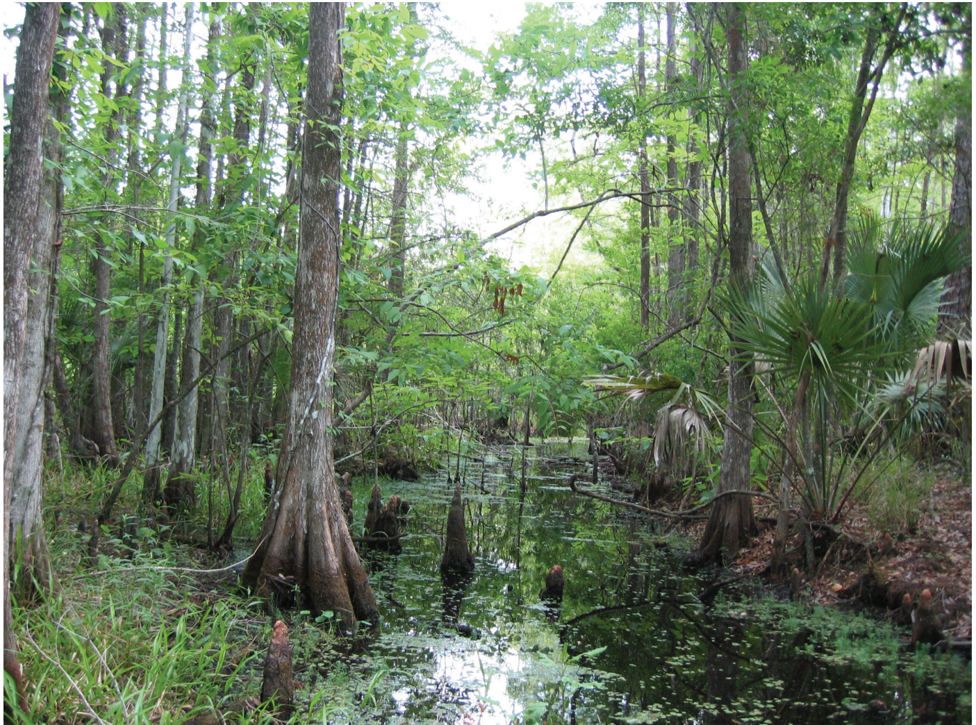
Cross Florida Greenway (Putnam County)

Other synonyms: river swamp, bottomland hardwoods, seasonally flooded basins or flats, oak-gum-cypress, cypress-tupelo, NWTC Zones II-III, tidewater swamp, river mouth swamp, sweetbay-swamp, tupelo-redbay; slough, backswamp, and oxbow features of floodplains treated in Wharton 437 and others