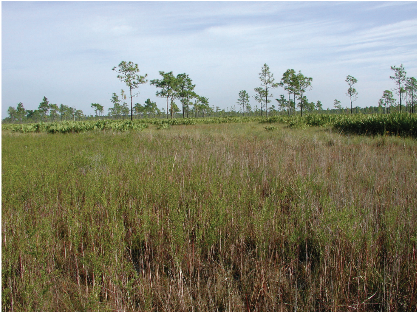
Triple N Ranch Wildlife Management Area (Osceola County)

dense zone of peelbark St. John's wort ( Hypericum fasciculatum ), water toothleaf ( Stillingia aquatica ) and scattered herbs, such as fringed yellow-eyed grass ( Xyris fimbriata ), pipeworts ( Eriocaulon compressum and E. decangulare ), narrowfruit horned beaksedge ( Rhynchospora inundata ), and Baldwin's spikerush ( Eleocharis baldwinii ). The innermost, deepest zone is occupied by maidencane ( Panicum hemitomon ), pickerelweed ( Pontederia cordata ), bulltongue arrowhead ( Sagittaria lancifolia ), or sawgrass ( Cladium jamaicense ). Floating-leaved plants, such as white waterlily ( Nymphaea odorata ), may be found in open water portions of the marsh. Depending on depth and configuration, depression marshes can have varying combinations of these zones and species within each zone. Depression marshes within xeric communities such as sandhill or scrub may have outer borders dominated by bluestem grasses, such as Andropogon brachystachyus , A. glomeratus , or A. virginicus var. glauca , or tall herbs such as falsefennel ( Eupa-