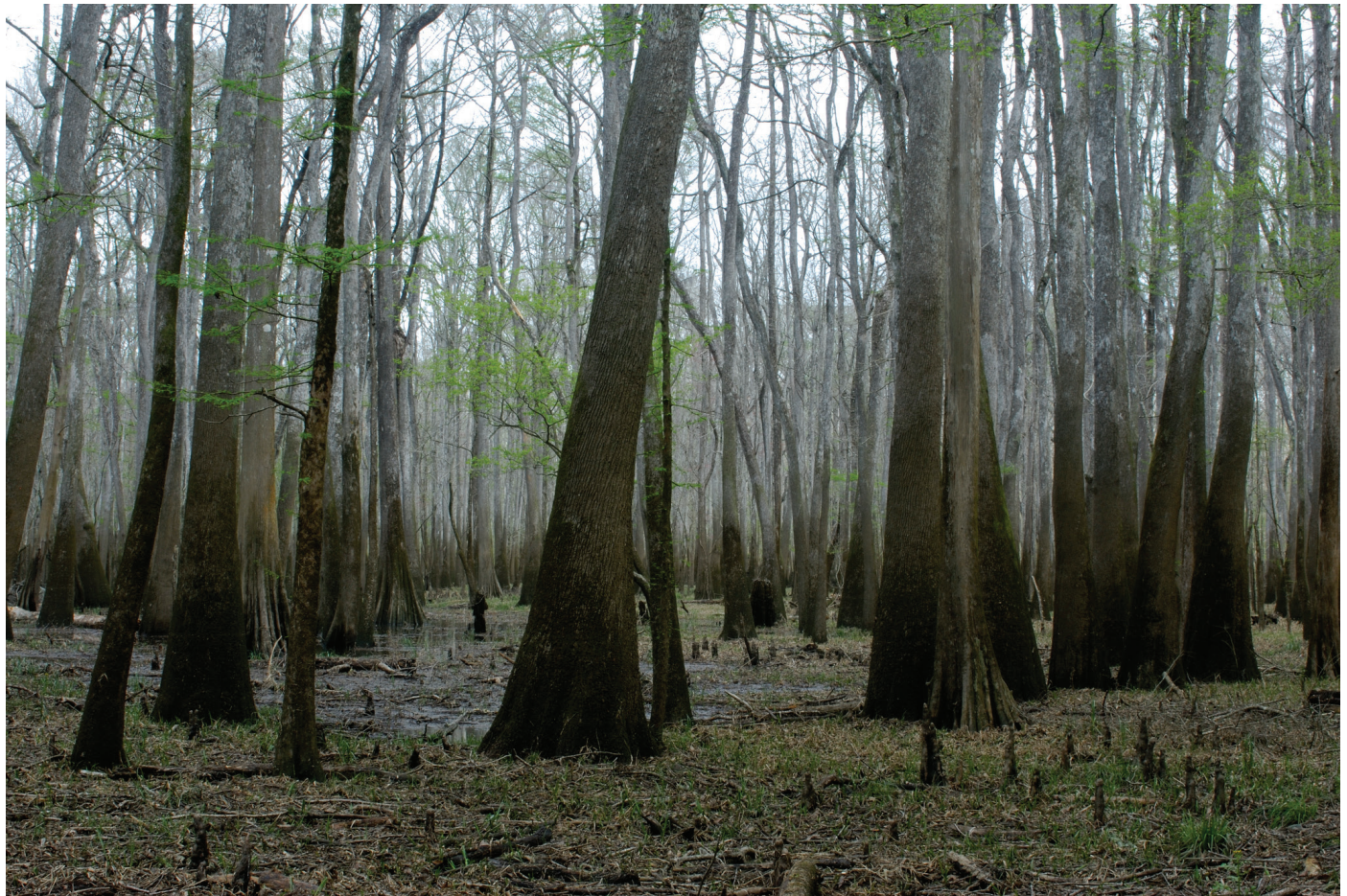
Torreya State Park (Liberty County)

depressions of the more hydrologically isolated areas of the floodplain. Floodplain swamp can often occur within a complex mixture of communities including alluvial forest, bottomland forest, and baygall. This produces a variable assemblage of canopy and subcanopy species, with less flood tolerant trees and shrubs found on small hummocks and ridges within the swamp. Shrubs and smaller trees such as Carolina ash ( Fraxinus caroliniana ), planer tree ( Planera aquatica ), black willow ( Salix nigra ), titi ( Cyrtilla racemiflora ), Virginia willow ( Itea virginica ), common buttonbush ( Cephalanthus occidentalis ), cabbage palm ( Sabal palmetto ), and dahoon ( Ilex cassine ) may be present. A groundcover of flood tolerant ferns and herbs are found in some floodplain swamps, including lizard’s tail ( Saururus cernuus ), false nettle ( Boehmeria cylindrica ), creeping primrosewillow ( Ludwigia repens ), savannah panicum ( Phanopyrum gymnocarpon ), royal fern ( Osmunda regalis var. spectabilis ), dotted smartweed ( Polygonum punctatum ), climbing aster ( Symphotrichum carolinianum ), and string lily ( Crinum americanum ). Swamps with stagnant water typically have a mixture of floating aquatics such as duck-