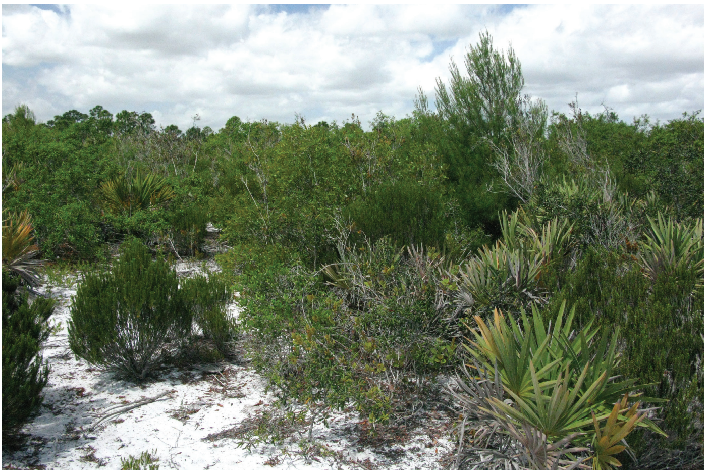
Malabar Sanctuary (Brevard County)

Scrubs dominated by a canopy of sand pine are usually found on the highest sandy ridgelines. The pine canopy may range from widely scattered trees with a short,