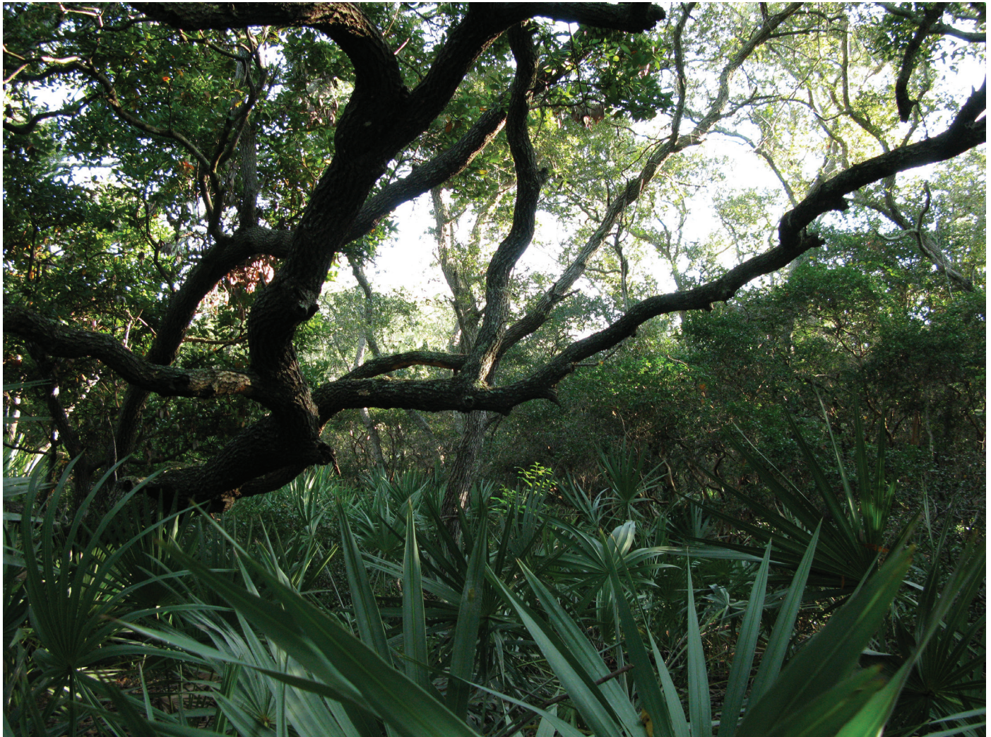
Cape Canaveral Air Force Station (Brevard County)

The same species are found on the Gulf coast of the peninsula of Florida with temperate canopy species with