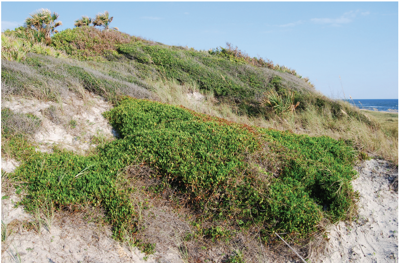
Guana Tolomato Matanzas National Estuarine Research Reserve (St. Johns County)

Along the southwest coast, where prevailing easterlies do not blow across the water, coastal strand generally does not exhibit the low, even, spray-pruned profile and the expanses of saw palmetto seen on the Atlantic coast. Many of the same tropical species found on the east coast occur here; joewood ( Jacquinia keyensis ) is found only on the west coast and saffron plum ( Sideroxylon celastrinum ), of limited occurrence on the east coast, is common here. 201