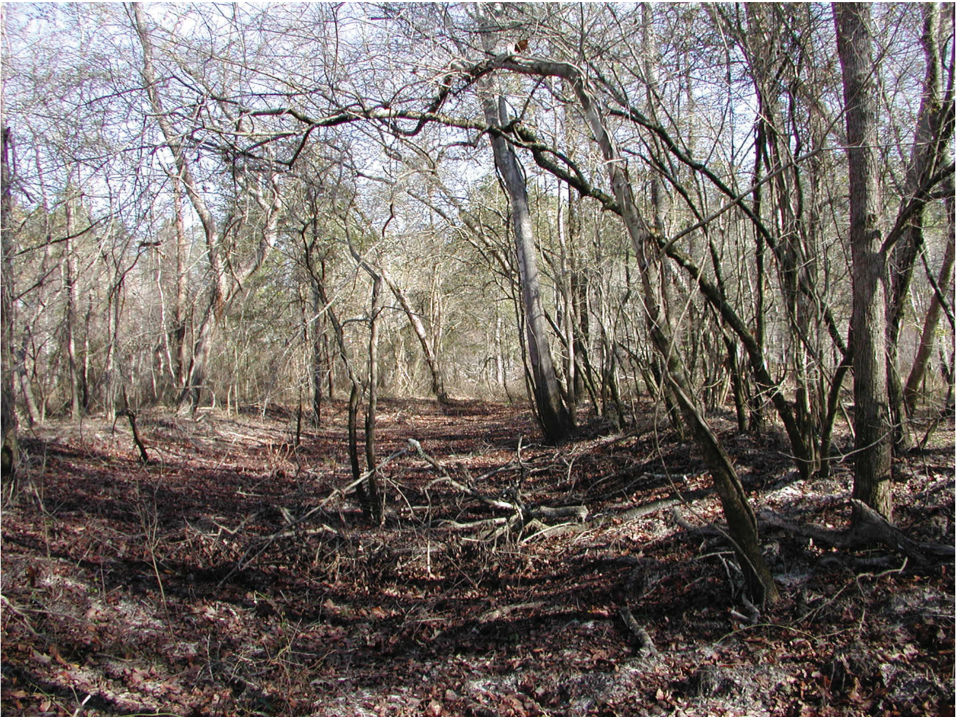
Typical "ridge and swale" topography resulting from an aggrading point bar on the Ochlockonee River, Lake Talquin State Forest (Leon County)