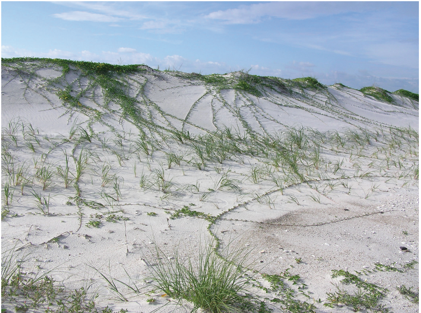
Bald Point State Park (Franklin County)

Rare plant species found in the beach dune community include Godfrey's goldenaster ( Chrysopsis godfreyi ), Gulf Coast lupine ( Lupinus westianus - in dune blowouts), late