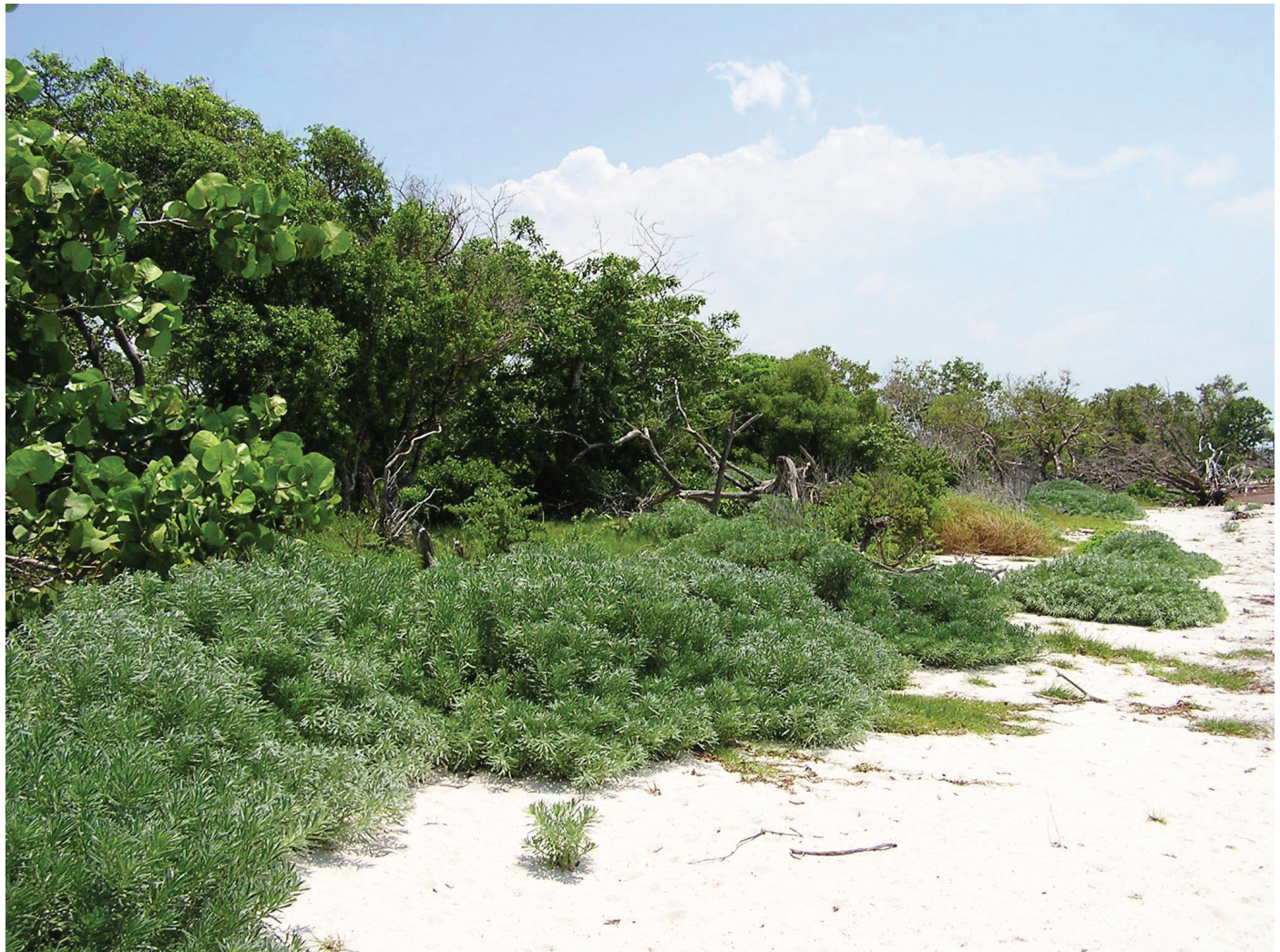
Florida Keys Wildlife and Environmental Area (Monroe County)

clusiifolia ), and poisonwood ( Metopium toxiferum ). Characteristic tall shrub and short tree species include Spanish stopper ( Eugenia foetida ), hog plum ( Ximenia americana ), white indigoberry ( Randia aculeata ), Florida Keys blackbead ( Pithecellobium keyense ), and saffron plum ( Sideroxylon celastrinum ). Short shrubs and herbs include perfumed spiderlily ( Hymenocallis latifolia ), bayleaf capertree ( Capparis flexuosa ), buttonsage ( Lantana involucrata ), and rougeplant ( Rivina humilis ). 217,345 More seaward berms or those more recently affected by storm deposition may support a suite of plants similar to beaches, including shoreline seapurslane ( Sesuvium portulacastrum ), saltgrass ( Distichlis spicata ), and seashore dropseed ( Sporobolus virginicus ), or scattered to dense shrub thickets with buttonwood ( Conocarpus erectus ), stunted black, red, and white mangroves ( Avicennia germinans , Rhizophora mangle , and Laguncularia racemosa ), bay cedar ( Suriana maritima ), wild dilly ( Manilkara jaimiqui ), joewood ( Jacquinia keyensis ), and bushy seaside oxeeye ( Borrchia frutescens ). 119