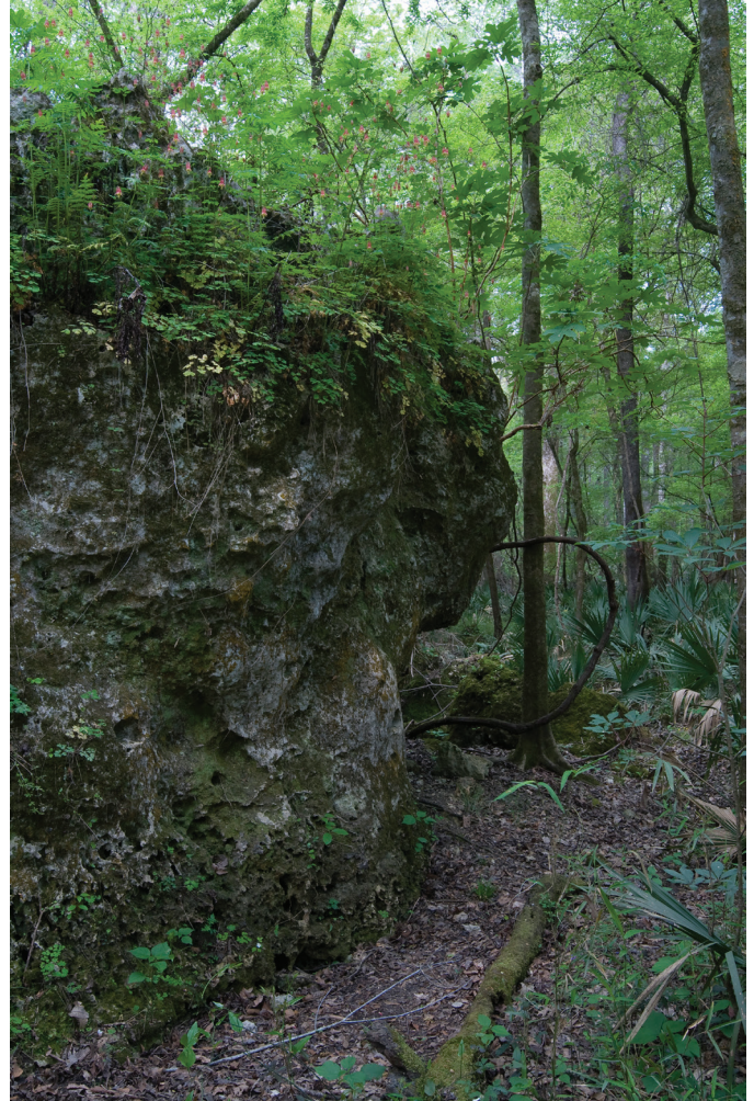
Florida Caverns State Park (Jackson County)

Rare plants that may occur on limestone outcrops include ferns that thrive in moist microclimates; these include spleenwort ( Asplenium pumilum ), modest spleenwort ( Asplenium vercundum ), brittle maidenhair fern ( Adiantum tenerum ), sinkhole fern ( Blechnum occidentale ), creeping maiden fern ( Thelypteris reptans ), southern lip fern ( Cheilanthes microphylla ), Peters' bristle fern ( Trichomanes petersii ), and Florida filmy fern ( Trichomanes punctatum ssp. floridanum ). Many rare fern species are restricted to limestone outcrops of extreme South Florida such as Hattie Bauer halberd fern ( Tectaria coriandrifolia ), wedgelet fern ( Odontosoria clavata ), holly vine fern ( Lomariopsis kunzeana ), and Kraus' bristle fern ( Trichomanes krausii ). Other interesting rare plant species of limestone outcrops include false rue-anemone ( Enemion biternatum ), Marianna columbine ( Aquilegia canadensis var. australis ; only present in the central Panhandle), Craighead's nodding-caps ( Triphora craigheadii ), Rickett's nodding-caps ( Triphora rickettii ), terrestrial peperomia ( Peperomia