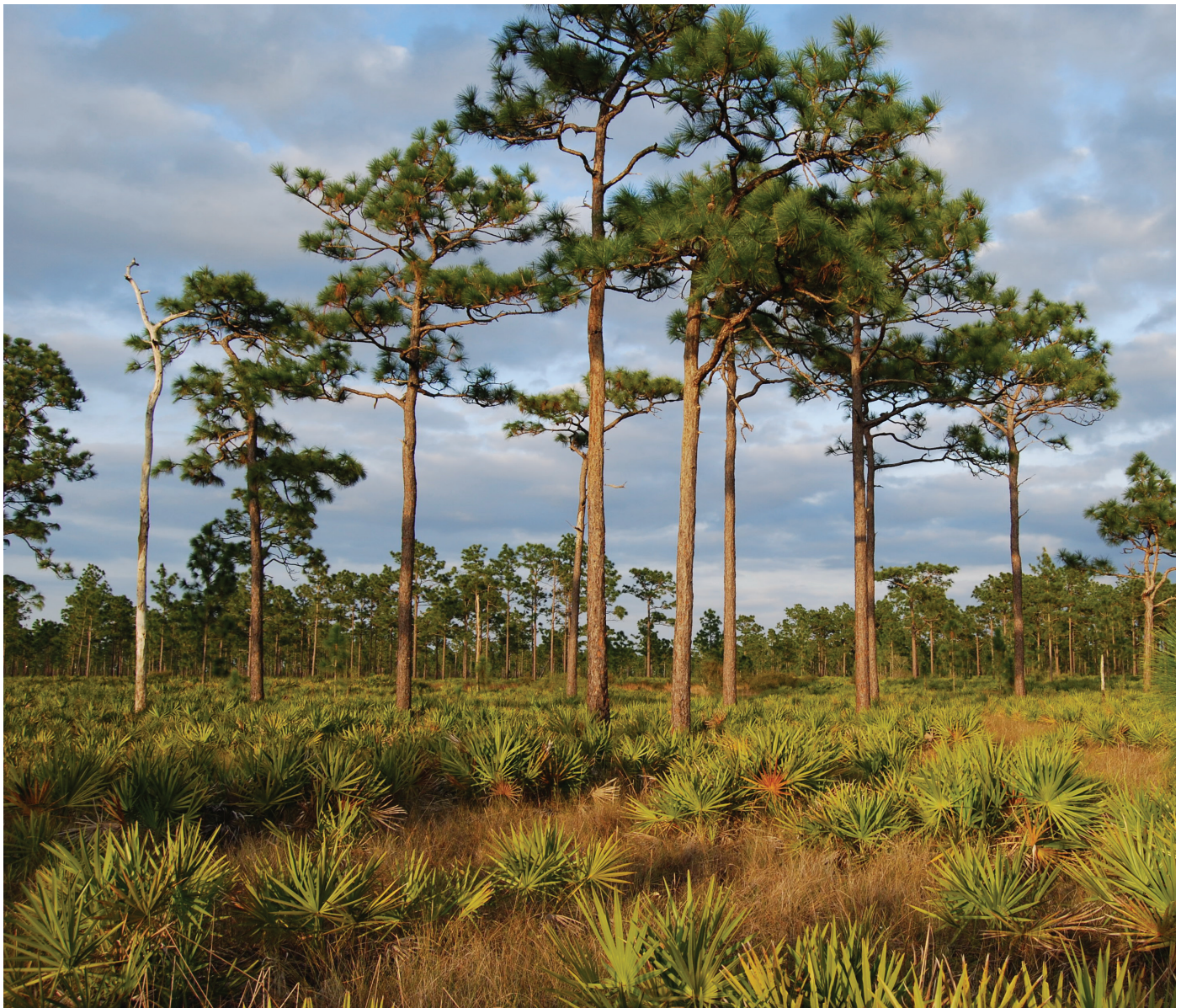
Babcock Ranch (Charlotte County)

Early accounts mention slash pine only in wet flatwoods sites. 57 Characteristic shrubs include saw palmetto ( Serenoa repens ), gallberry ( Ilex glabra ), coastalplain staggerbush ( Lyonia fruticosa ), and fetterbush ( Lyonia lucida ). Rhizomatous dwarf shrubs, usually less than two feet tall, are common and include dwarf live oak ( Quercus minima ), runner oak ( Q. elliottii ), shiny blueberry ( Vaccinium myrsinites ), Darrow's blueberry ( V. darrowii ), and dwarf huckleberry ( Gaylussacia dumosa ). The herbaceous layer is predominantly grasses, including wiregrass ( Aristida stricta var. beyrichiana ), dropseeds ( Sporobolus curtissii , S. floridanus ), panicgrasses ( Dichanthelium spp.), and broomsedges ( Andropogon spp.), plus a large number of showy forbs.