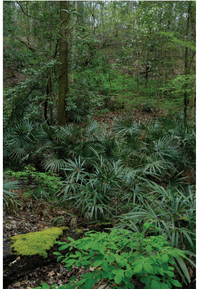
Torreya State Park (Liberty County)

The combination of densely shaded slopes and cool, moist microclimates produces conditions that are conducive for the growth of many plant species that are more typical of the Piedmont and Southern Appalachian Mountains. 361 These include mountain laurel, black walnut ( Juglans nigra ), wild hydrangea ( Hydrangea arborescens ), sweet-shrub ( Calycanthus floridus ), burningbush ( Euonymus atropurpureus ), heartleaf ( Hexastylis arifolia ), common maidenhair