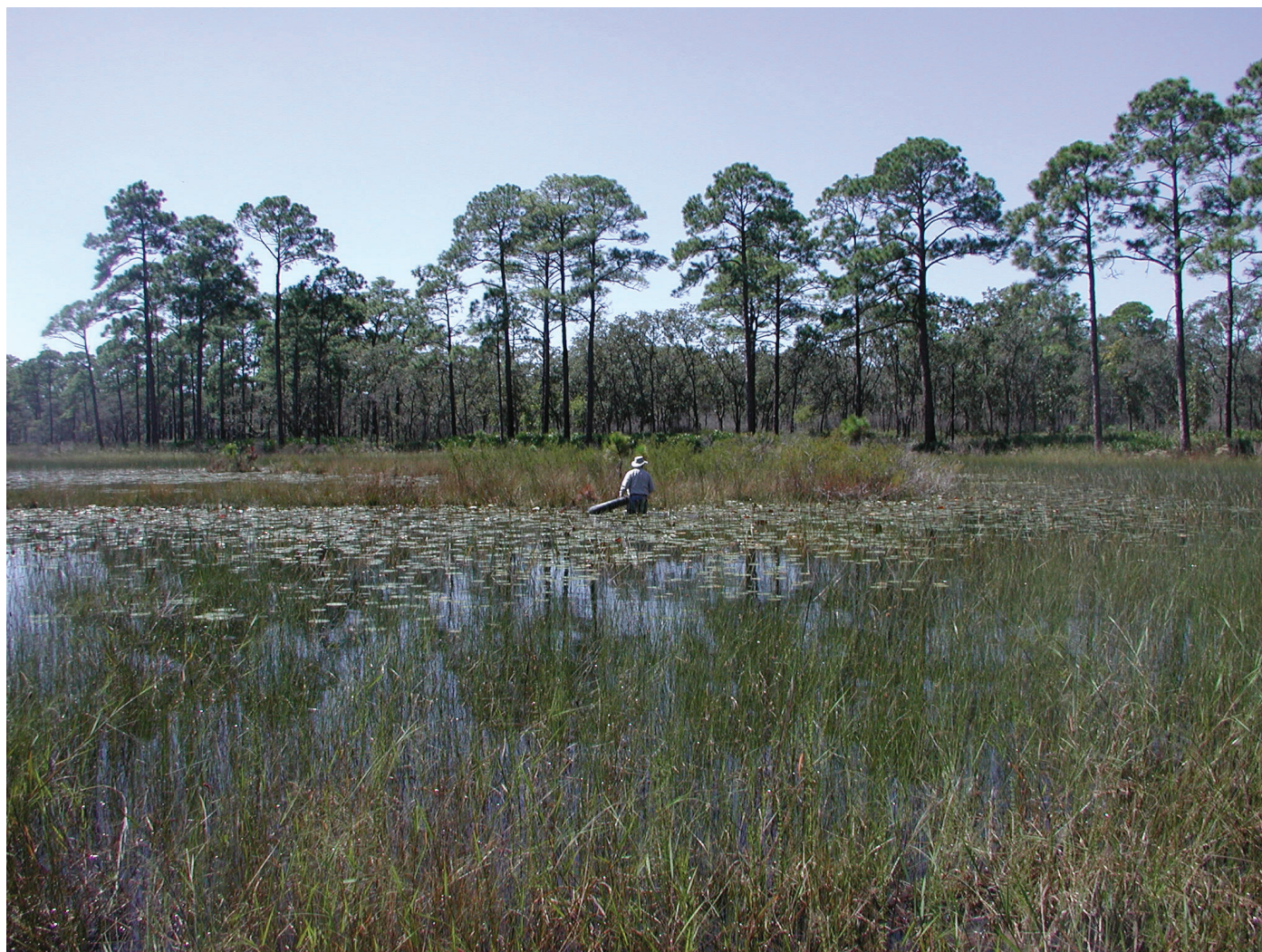
St. Marks National Wildlife Refuge (Panacea Unit; Wakulla County)