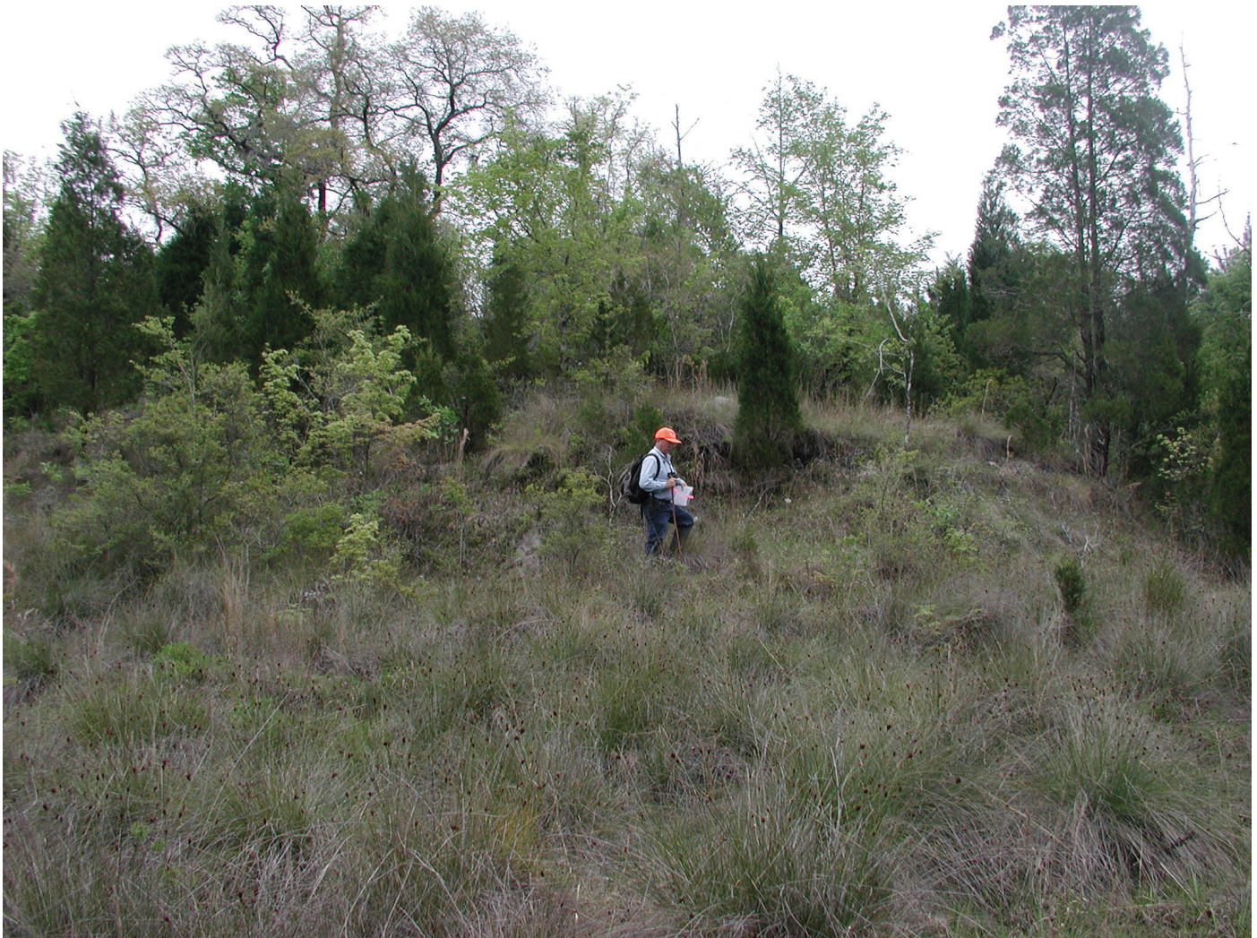
E.B. glade (Gadsden County) with black bogrush in foreground

Upland glade was first mapped in the course of a survey of the Apalachicola ravines in Gadsden County. 237 More glades have recently been mapped in Jackson County.