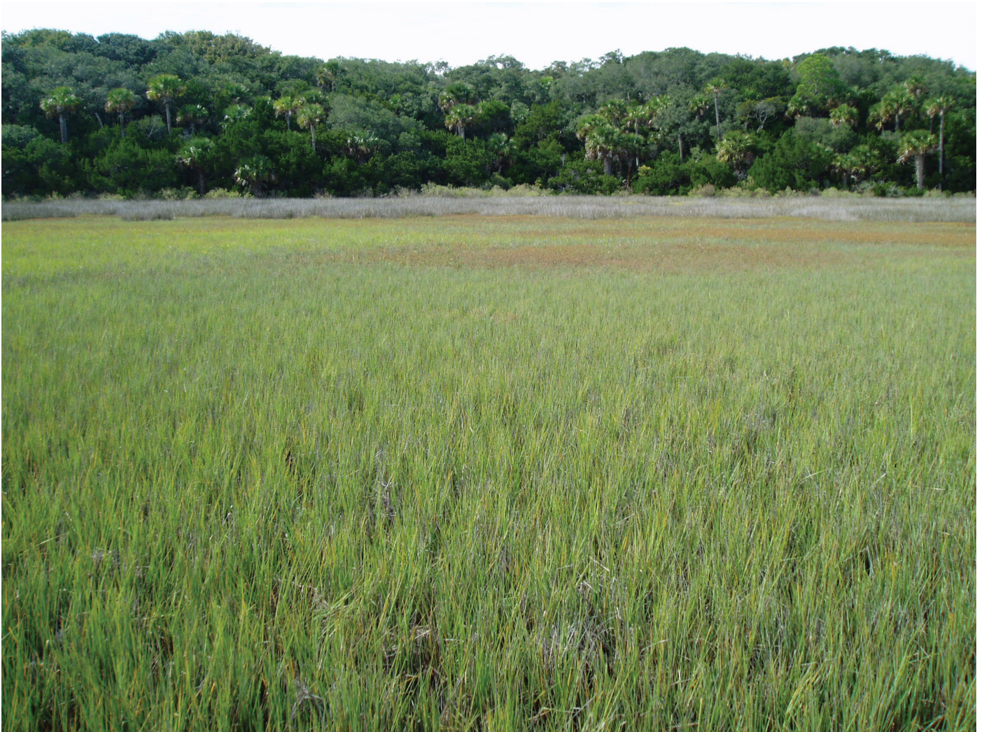
Timucuan Ecological and Historic Preserve (Duval County, salt marsh cordgrass in foreground)