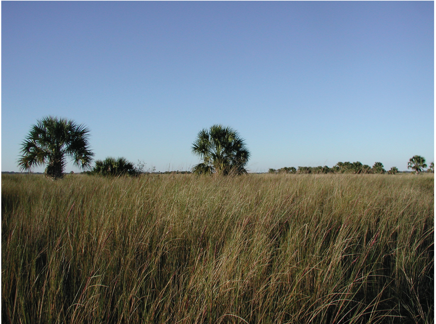
Salt Lake Wildlife Management Area (Brevard County)

zone is typically characterized by maidencane ( Panicum hemitomon ), smooth beggarticks ( Bidens laevis ), dotted smartweed ( Polygonum punctatum ), and sand cordgrass ( Spartina bakeri ), accompanied by a diverse mixture of less common forbs such as sweetscent ( Pluchea odorata ), spadeleaf ( Centella asiatica ), and lemon bacopa ( Bacopa caroliniana ). 117 Coastalplain willow ( Salix caroliniana ), common buttonbush ( Cephalanthus occidentalis ), elderberry ( Sambucus nigra ssp. canadensis ), and wax myrtle ( Myrica cerifera ) are common shrubby components. During droughts exposed marsh and lake beds may be colonized by large native weedy species such as southern amaranth ( Amaranthus australis ) and dogfennel ( Eupatorium capillifolium ). 250 Occasional isolated areas of salt flat vegetation, including shoreline seapurslane ( Sesuvium portulacastrum ) and perennial glasswort ( Sarcocornia perennis ) occur in the marshes of the St. Johns Basin. 122 These salt pockets are presumably relict deposits from an earlier geologic episode when the area was an arm of the sea.