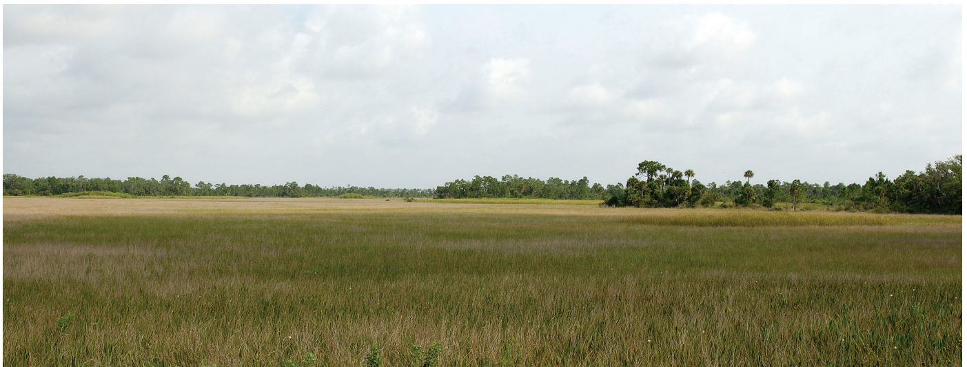
Okaloacoochee Slough State Forest (Hendry County)

There are no rare plant species that are characteristic of slough marsh. Rare animal species that use slough marsh include American alligator ( Alligator mississippiensis ), black rail ( Laterallus jamaicensis ), Florida sandhill crane ( Grus canadensis pratensis ), limpkin ( Aramus guarauna ), numerous species of wading birds, and round-tailed muskrat ( Neofiber alleni ).