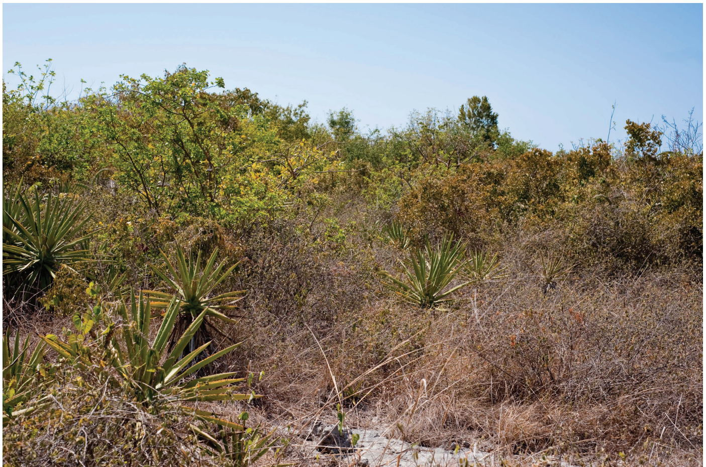
Crawl Key (Monroe County)

Keys cactus barren is confined to the Florida Keys on limestone bedrock (Key Largo limestone) and is known from only six sites, four on the Upper Keys and two from the