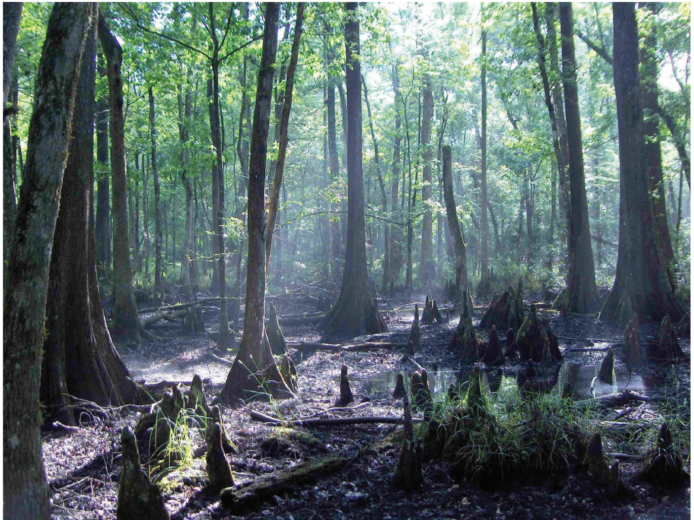
Goethe State Forest (Levy County)

centrated around the perimeter. Common species include Virginia willow ( Itea virginica ), swamp dogwood ( Cornus foemina ), swamp doghobble ( Leucothoe racemosa ), coastal sweetpepperbush ( Clethra alnifolia ), myrtle dahoon ( Ilex cassine var. myrtifolia ), fetterbush ( Lyonia lucida ), wax myrtle ( Myrica cerifera ), titi ( Cyrilla racemiflora ), black titi ( Cliftonia monophylla ), and common buttonbush ( Cephalanthus occidentalis ). The herbaceous layer is also variable and includes a wide array of species including maidencane ( Panicum hemitomon ), Virginia chain fern ( Woodwardia virginica ), arrowheads ( Sagittaria spp.), lizard's tail ( Saururus cernuus ), false nettle ( Boehmeria cylindrica ), beaksedges ( Rhynchospora spp.), bladderworts ( Utricularia spp.), and royal fern ( Osmunda regalis var. spectabilis ). Sphagnum moss ( Sphagnum spp.) often occurs in patches where the soil is saturated but not flooded. 280 Vines may be present, particularly coral greenbrier ( Smilax walteri ), laurel greenbrier ( Smilax laurifolia ), and eastern poison ivy ( Toxicoden-