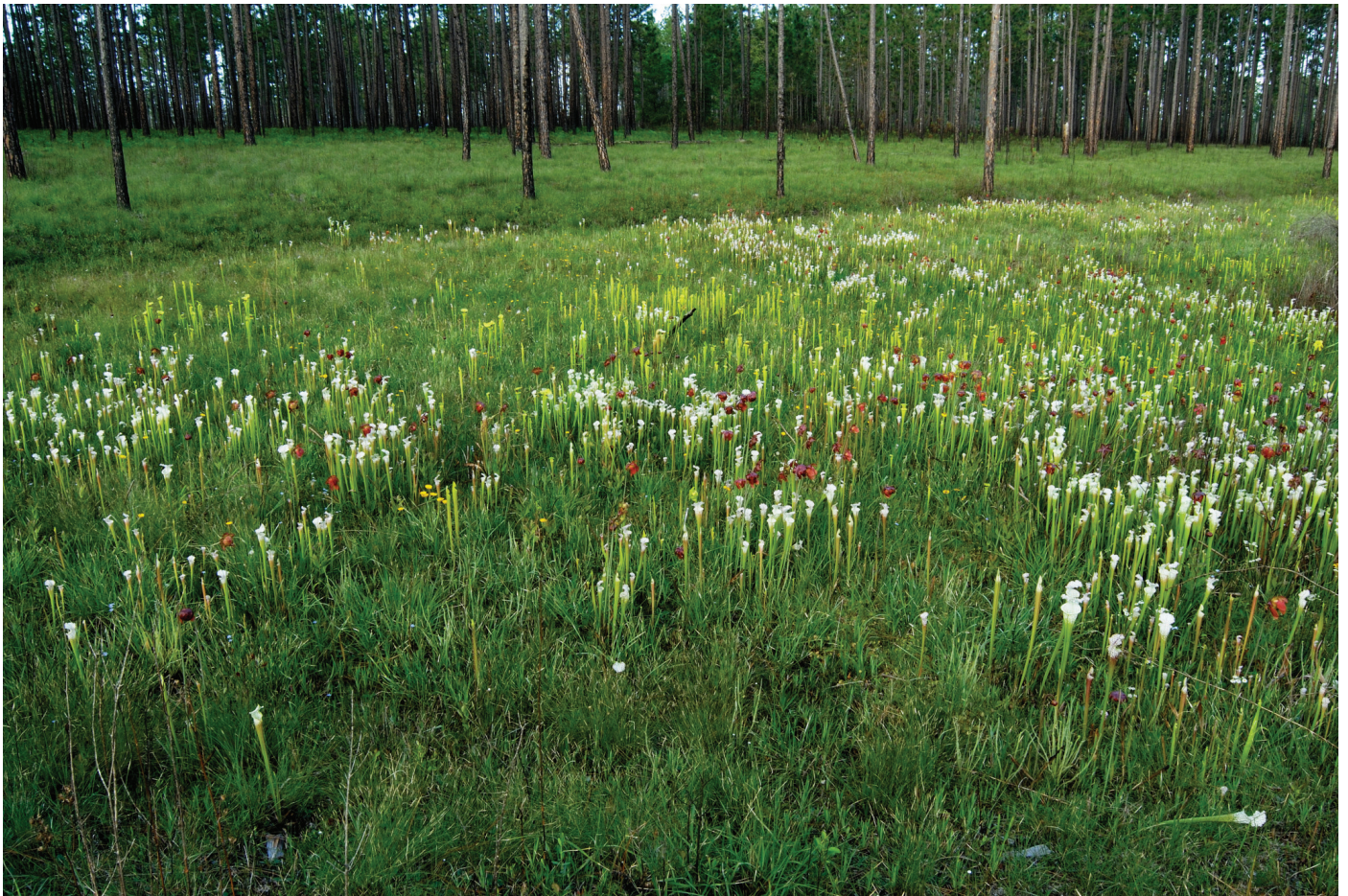
Blackwater River State Forest (Santa Rosa and Okaloosa Counties)

Pitcherplants in the Panhandle include yellow trumpets ( Sarracenia flava ), white-top pitcherplant ( S. leucophylla ), sweet pitcherplant ( S. rubra ), and parrot pitcherplant ( S. psittacina ). In northeast Florida, the parrot pitcherplant and hooded pitcherplant ( S. minor ) are found. Sundews include dewthreads ( Drosera tracyi ) in the Panhandle, and pink sundew ( D. capillaris ) and dwarf sundew ( D. brevifolia ) in both the Panhandle and the northeast. Butterworts include Chapman's butterwort ( Pinguicula planifolia ) and primrose-flowered butterwort ( P. primuliflora ) in the Panhandle. Other species found in wetter portions include longleaf threeawn ( Aristida palustris ), Texas pipewort ( Eriocaulon texense ), shortleaf sneezeweed ( Helenium brevifolium ), sandbog deathcamas ( Zigadenus glaberrimus ), golden crest ( Lophiola aurea ), and rush featherling ( Pleea tenuifolia ). Georgia Indian plantain ( Arnoglossum sulcatum ), and switchcane ( Arundinaria gigantea ) are found on edges of seepage slopes where they border shrub bogs. Scattered low shrubs are often present in seepage slopes, including woolly huckleberry ( Gaylussacia mosieri ), gallberry ( Ilex glabra ), evergreen bayberry ( Myrica carolinensis ), coastal-