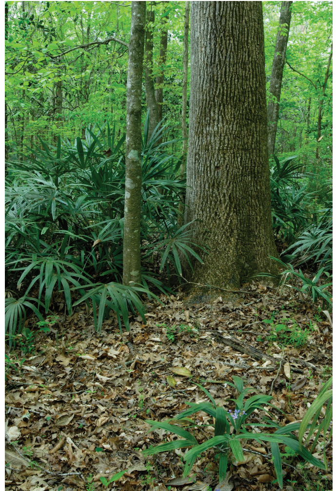
Florida Caverns State Park (Jackson County)

Upland hardwood forest occurs on rolling mesic hills, slopes above river floodplains, in smaller areas on the sides of sinkholes, and occasionally on rises within floodplains. Limestone or phosphatic rock may be near the surface. Soils are generally sandy clays or clayey sands with substantial organic and sometimes calcareous components. These soils have higher nutrient levels than the sandy soils prevalent in most of Florida. The moisture retention properties of clays and layers of leaf mulch conserve soil moisture and create decidedly mesic conditions. The dense canopy and multiple layers of midstory vegetation restrict air movement and light penetration, which maintains high relative humidity within the community.