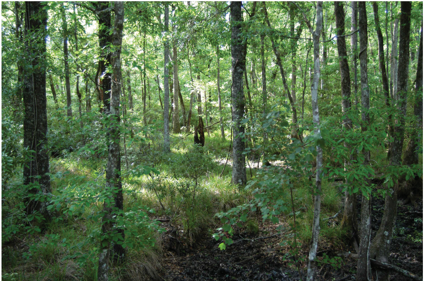
Big Shoals State Forest (Hamilton County)

Situations where bottomland forest occurs include several distinct ecological settings in Florida: along rivers and tributaries, on higher terraces and levees in floodplains, and in somewhat isolated depressions that do not flood