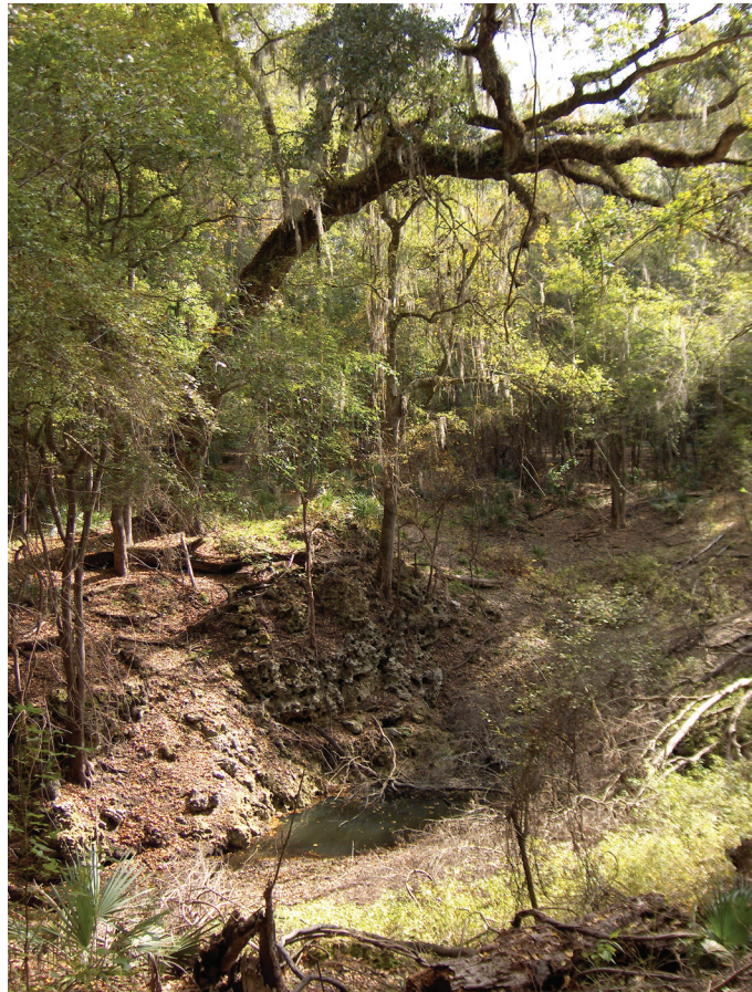
Limestone outcrop within sinkhole, Suwannee Ridge Wildlife and Environmental Area (Hamilton County)

Other synonyms: sink, limesink, banana hole, solution pit, cenote, grotto, doline, chimney hole