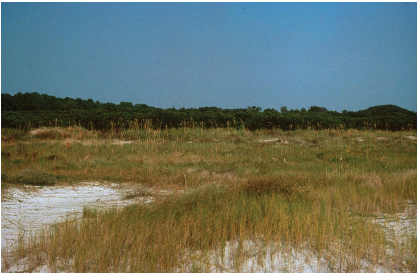
Tyndall Air Force Base (Bay County)

A number of rare animals use coastal grasslands for foraging and nesting, including six subspecies of beach mouse: four along the Panhandle coast, the Perdido Key beach mouse ( Peromyscus polionotus trissyllepsis ), the Santa Rosa beach mouse ( P. p. leucocephalus ), the Choctawhatchee beach mouse ( P. p. allophrys ), and the St. Andrews beach