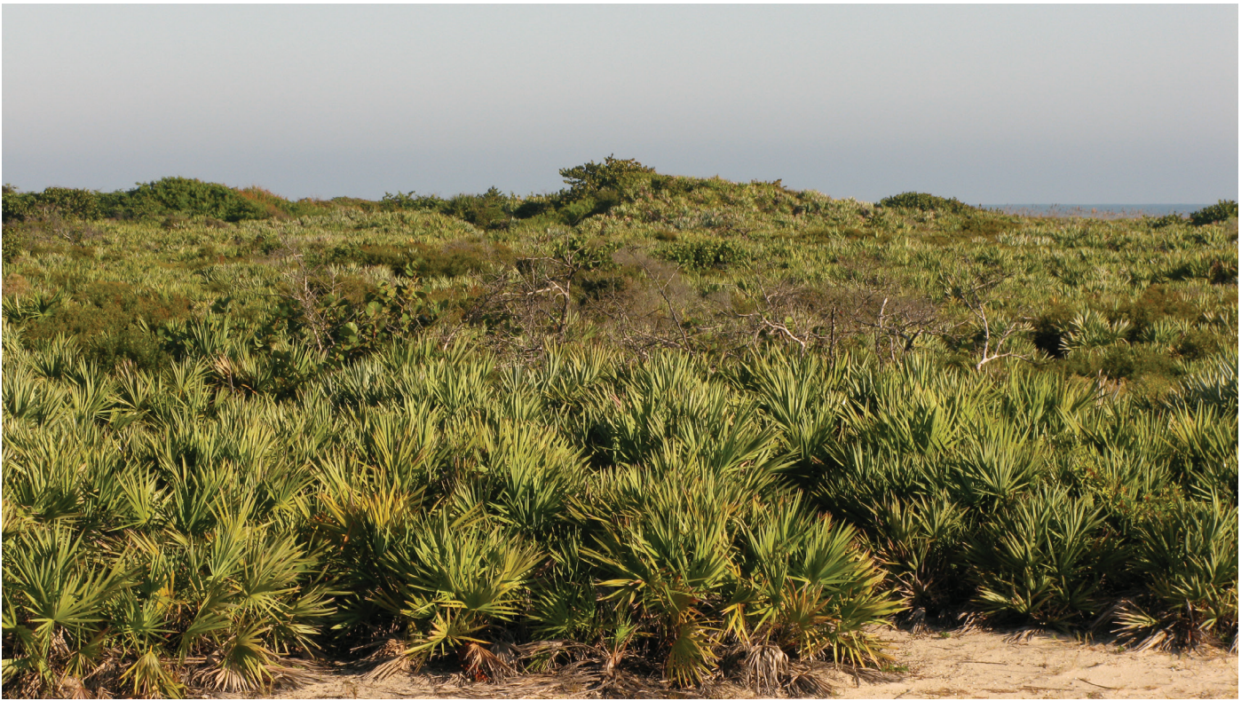
Cape Canaveral Air Force Station (Brevard County)