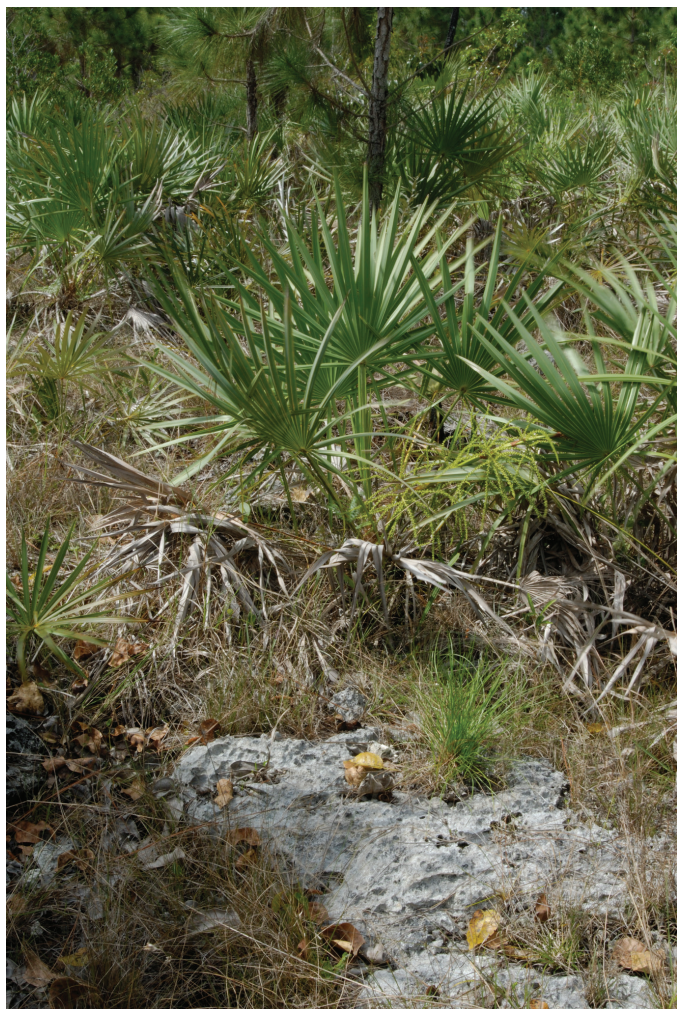
Ludlam Pineland (Miami-Dade County)