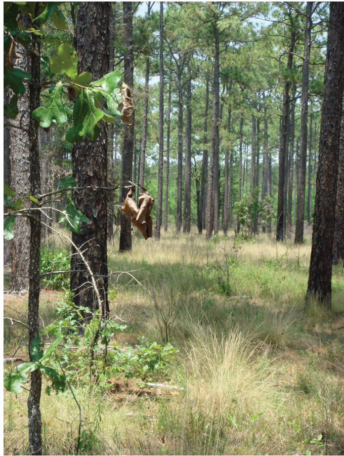
Apalachee Wildlife Management Area (Jackson County)

Other synonyms: longleaf pine upland forest 436 ; longleaf pine savannah 57 ; southern mesic longleaf woodland 318 ; longleaf pine upland forest 436