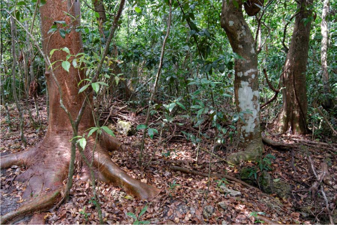
Matheson Hammock (Miami-Dade County)