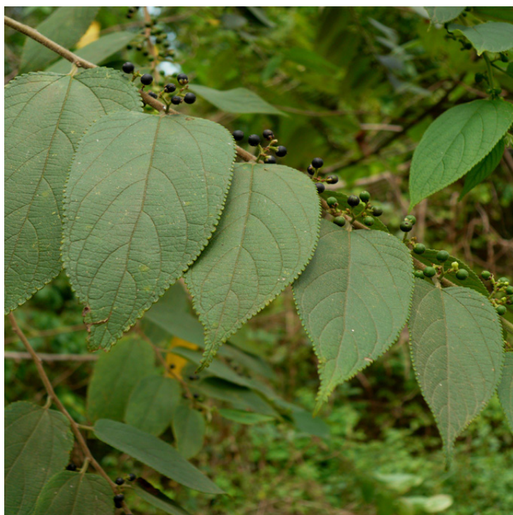
Trema orientalis

Description: Evergreen tree to 18 m tall and 0.6 m in trunk diameter. Bark light gray grown, smooth, finely fissured. Twigs long, slender, unbranched, spreading, light green, turning brown. Leaves alternate, in two rows, with slender leafstalks 1–2 cm long, finely hairy. Blades narrowly ovate, 6–10 cm long and 2–3 cm wide, very long-pointed at apex, base slightly notched with sides unequal, edges finely serrate, thin, with three main veins from base. Upper surface light green, slightly shiny and rough, with veins sunken, lower surface dull and paler, soft hairy, with prominent light yellow veins. Inflorescence an axillary cyme, 1–5 cm long and broad. Flowers many, nearly stalkless, light green, 3 mm long, male and female in separate inflorescences. Fruit a round drupe, 5 mm in diameter, fleshy, pink maturing to black. Seed single, round, brown, more than 1.5 mm long.