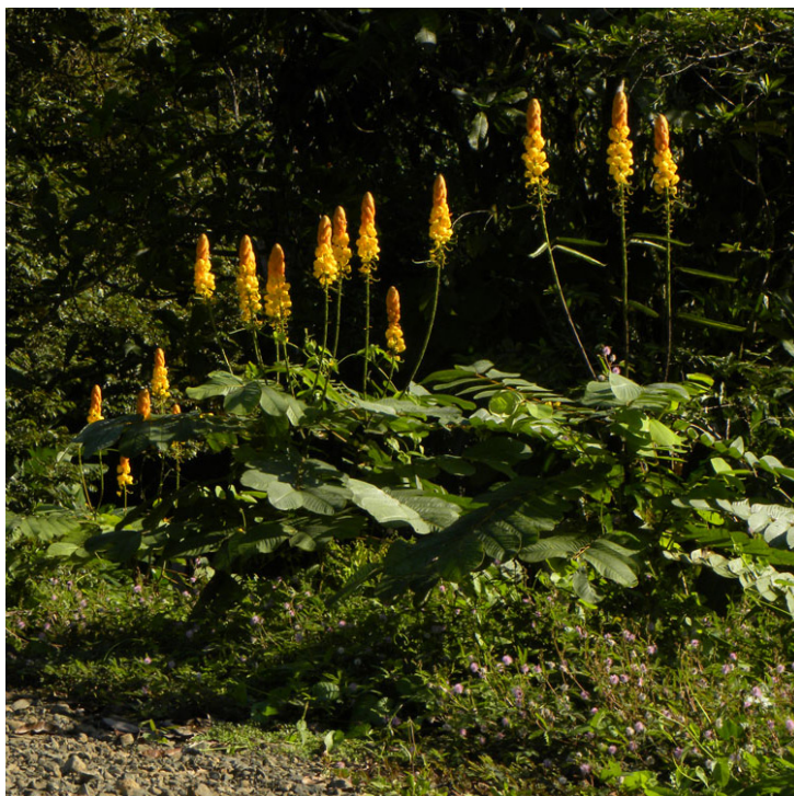
Senna alata (L.) Roxb.

Description: Evergreen shrub 3-5 m tall and 3 m wide. Leaves pinnate, up to 75 cm long. Leaflets in 7-14 pairs, oblong to obovate, 8-20 cm long and 3-10 cm wide. Inflorescence an erect axillary raceme 15-60 cm tall, arising from leaf axil, resembling a candle with bottom flowers opening first. Flowers bright yellow, 2.5 cm across, cup-shaped, petals 5. Sepals waxy and smooth to the touch. Fruit straight or slightly curved, 4-winged pod 10-20 cm long and 1.5 cm wide, dark brown to black when mature. Seeds 50 to 60 per fruit, flattened, triangular, to 6 mm long.