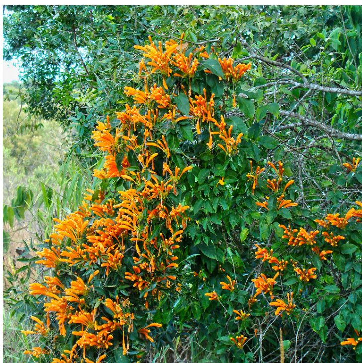
Pyrostegia venusta

Description: Evergreen, rampant woody vine climbing by tendrils. Leaves compound, opposite, leaflets 2 or 3 (terminal leaflet often a 3-parted tendril), up to 8 cm long, ovate, acuminate. Flowers born January to April, in terminal showy dense panicles, bright orange, to 8 cm long, tubular, corolla with 5 reflexed obtuse lobes, stamens 4, exerted.