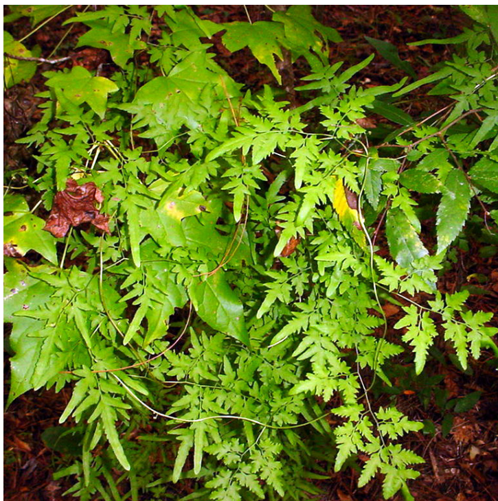
Lygodium japonicum , FNAI

Description: Perennial vine-like fern reaching up to 27 m in length. Fronds are compound and have indeterminate growth, reaching lengths of over 6 m. Stems are green, orange, or black and wiry, forming dense mats. Leafy branches (pinnae) from the main rachis are triangular in shape, 10-20 cm long. Leaflets lobed, stalked, with terminal lobes dissected, pubescent below. Fertile leaflets are contracted in shape and have two rows of sporangia along the inrolled leaf margin.