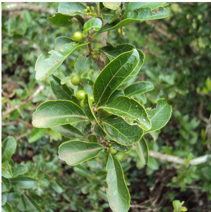
Flacourtia indica 01, by Vinayarajhttp://commons.wikimedia.org/wiki/Category:Flacourtia_indicaUsed under Creative Commons 3.0 license

Description: Evergreen shrub or tree to 10 m tall with sharp spines in the leaf axils and on trunk. Leaves alternate, simple, leathery, to 8 cm long, shape variable, margins toothed to wavy, glabrous or pubescent. Plants dioecious, flowers small and yellowish in small clusters in the leaf axils. Fruit a round edible berry to 2 cm, red to purple when ripe.