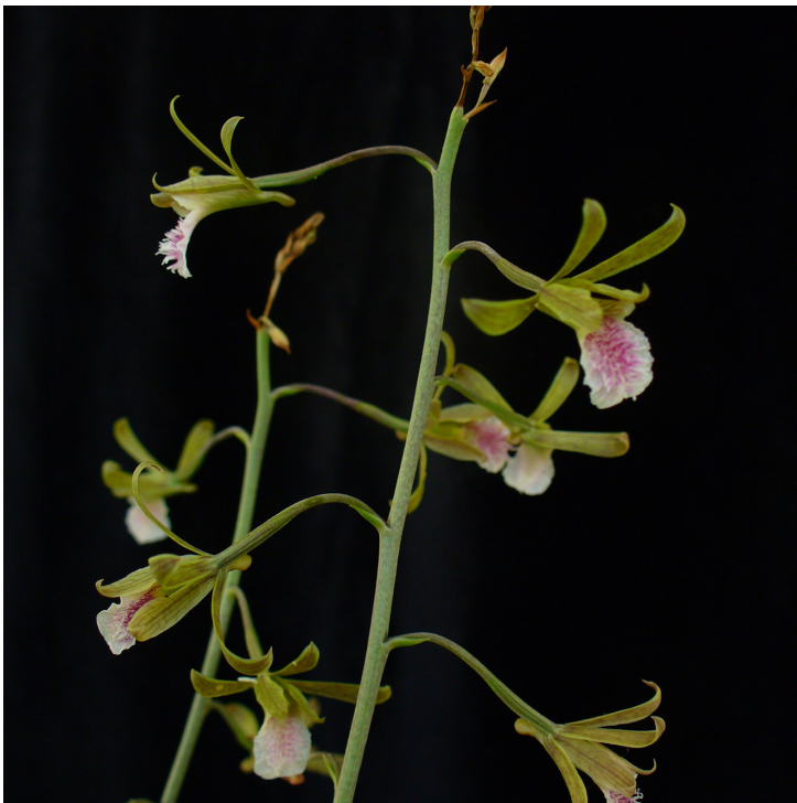
Eulophia graminea flowers

Description: Herbaceous plant arising from a pseudobulb with short lily-like leaves. Inflorescences arise from spherical to conical pseudobulbs, usually about 5-8 cm in diameter, which typically sit completely or partly above the ground. The slender inflorescences range from 30 cm to 1.5 m tall and bear up to 60 small flowers, each usually about 2.5 cm across with a white lip marked with rose-pink, with green petals and sepals.