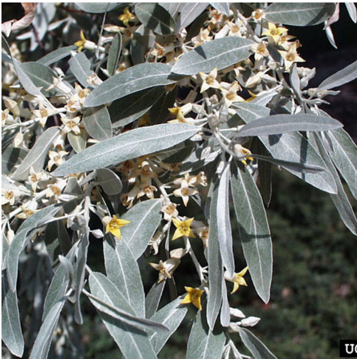
Paul Wray, Iowa State University, Bugwood.org

Description: Large deciduous shrub or small tree to 25 m tall. Bark reddish and shredding. Leaves alternate, silver-gray, lance-shaped. Fragrant yellow flowers in leaf axils. Flowers late spring. Fruit hard, olive-like.