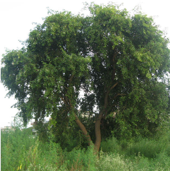
Dalbergia sissoo, by Khalid Mahmoodhttp://en.wikipedia.org/wiki/Dalbergia_sissooUsed under Creative Commons 3.0 license

Description: Medium to large tree, semi-deciduous to 18 m tall with a dense crown and gray bark. Leaves alternate, compound, 3-5 leaflets with a single terminal leaflet. Leaflets glabrous, rounded, to 8 cm long, margins entire, with sharp point. Flowers inconspicuous, pea-like, fragrant, yellowish or white. Fruit a pale brown, flat, papery seed pod, to 8 cm long.