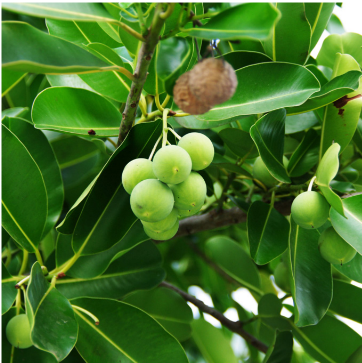
Calophyllum antillanum Britton photographed in San Juan, Puerto Rico, by Michael Reck. Used under Creative Commons 3.0 license

Description: Medium sized tree to 12 m tall with glossy, leathery leaves. Leaves opposite, simple, stalked, elliptic, 10-15 cm long with entire margins and numerous parallel secondary veins. Small fragrant white flowers in clusters at leaf axils. Flowers have many yellow stamens. Fruit is a round, hard-shelled, brown drupe.