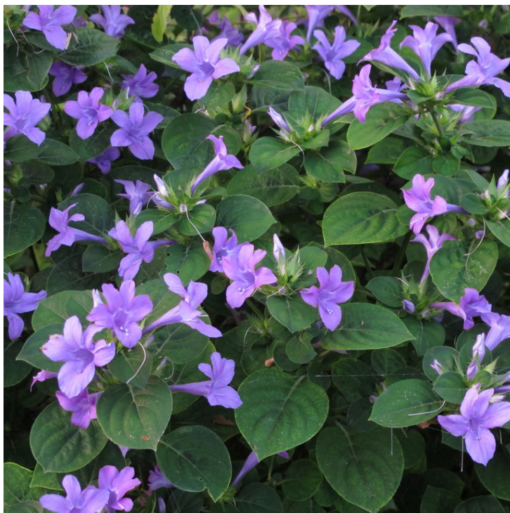
Barleria cristata

Description: Shrub to 1 meter tall. The leaves are dark green on the upper surface and pale green on the lower surface, elliptic to narrowly ovate. Flowers about 5 cm long, funnel-shaped, violet, pink, or white color. Fruits about 1.5 cm long, ellipsoid capsules.