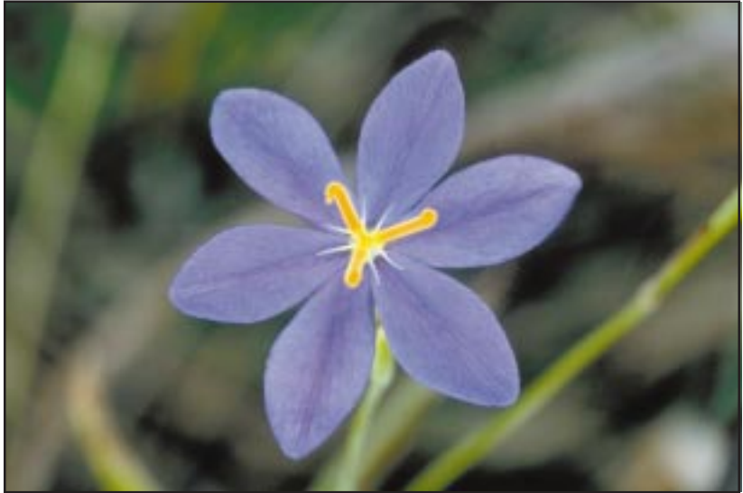
Alfred R. Schotz

Field Description: Perennial herb from a bulb with a single, tall, slender stem , occasionally branching on robust plants. Basal leaves few, grass-like, sometimes more than 2 feet long. Stem leaves small and scattered along the stem. Flowers more than 1.5 inches across, with 6 dark blue, spreading petals and sepals (tepals) ; flowers open around 4 pm and close by dusk. Stamens with 3 coiled, yellow anthers; style divided into 6 narrow, pointed branches. Fruit an erect, oval capsule, about 0.5 inch long.