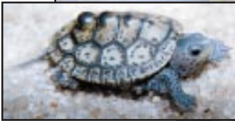
hatchling