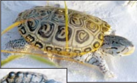
Atlantic coast

State possession limit of two turtles; illegal to buy or sell species or its parts.