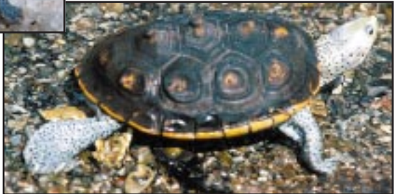
Gulf coast

Description: A small to medium-sized turtle (females to 8.5 in. = 216 mm shell length, males to 5.5 in. = 140 mm) of tidal and salt marsh habitats but otherwise resembling freshwater turtles. Each large scale on back bears concentric grooves and rings or dark and light markings, often with center area slightly raised and of different color than background. Colors vary among regions of Florida, which includes ranges of five races. Head, neck and legs often light with many dark dots, but sometimes streaks. Upper shell (carapace) with low, central keel, sometimes knobbed. Horny covering of beak usually broad and light, giving appearance of a smile. Hatchlings typically with large bulbous knobs down center of back.