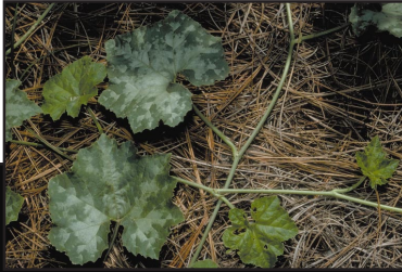
Billy B. Boothe